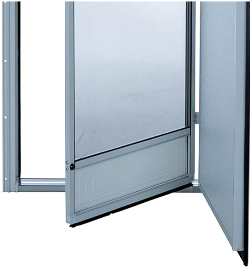
Figure 3: The RV entry door fully open, revealing the integrated screen door.