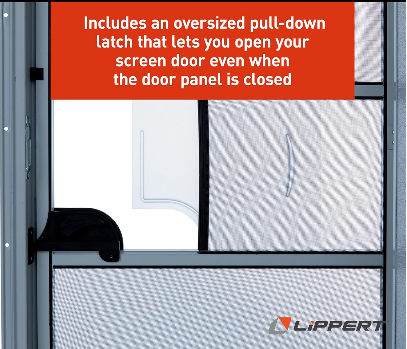
Figure 4: Detail of the oversized pull-down latch on the screen door for convenient access.

Includes an oversized pull-down latch that lets you open your screen door even when the door panel is closed