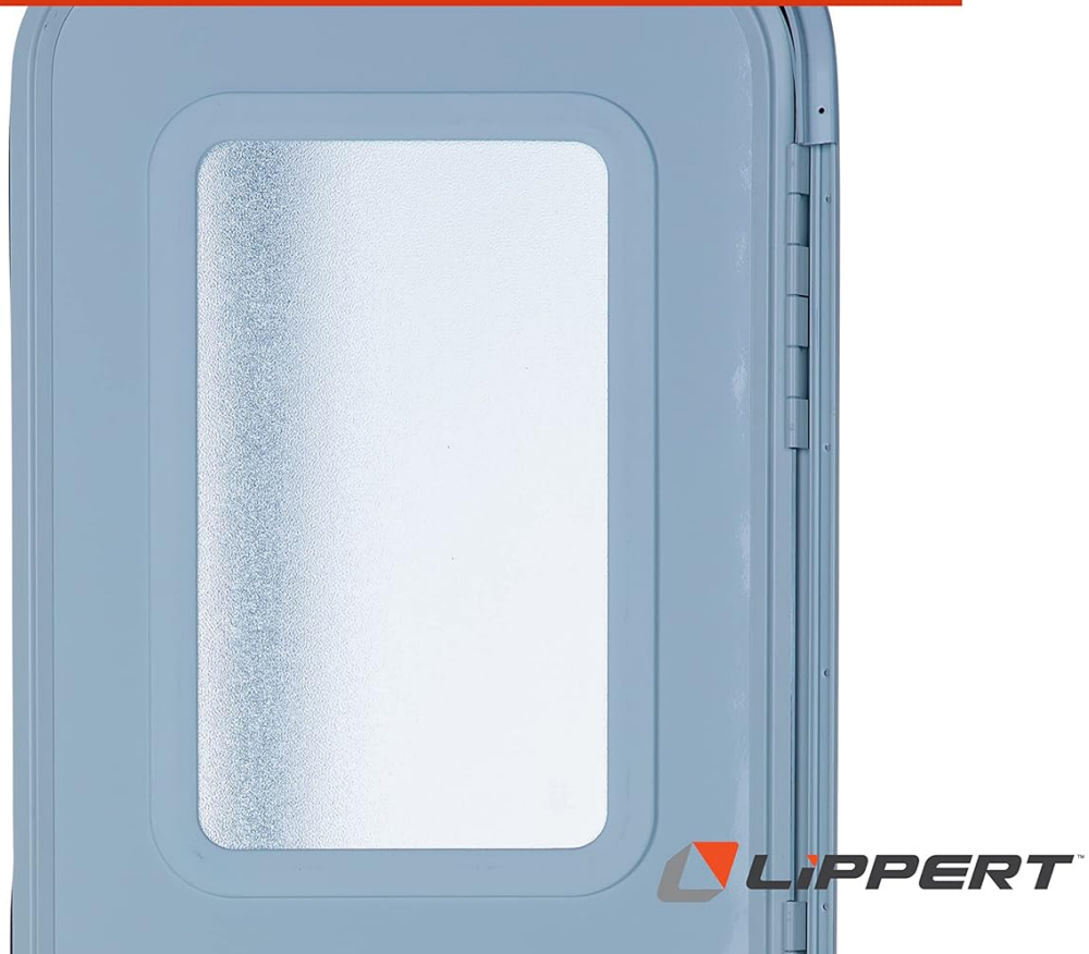
Figure 6: Detail of the premium, UV-stable obscure window.

Unlike other doors on the market our obscure window glass is UV-stable