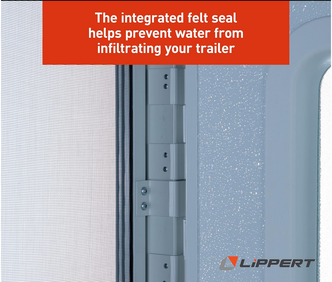
Figure 7: View of the integrated felt seal designed to prevent water intrusion.

The integrated felt seal helps prevent water from infiltrating your trailer