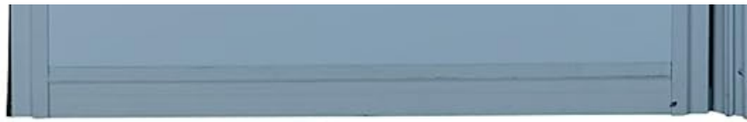
Figure 1: Front view of the Lippert Components RV Radius Entry Door.