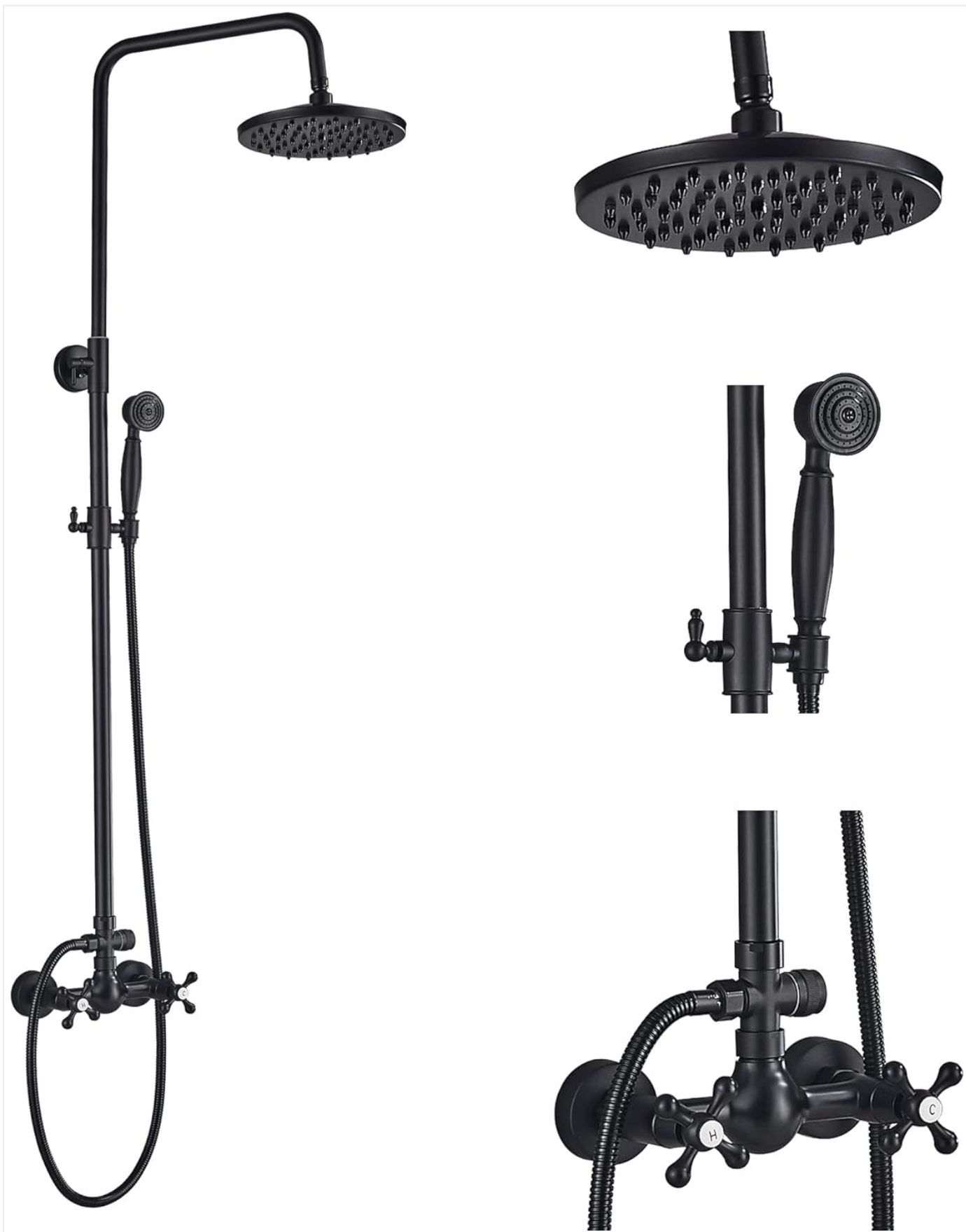
Figure 1: Overview of the Votamuta Wall-Mounted Shower System in Oil-Rubbed Bronze finish, featuring an 8-inch rainfall shower head and a handheld sprayer.