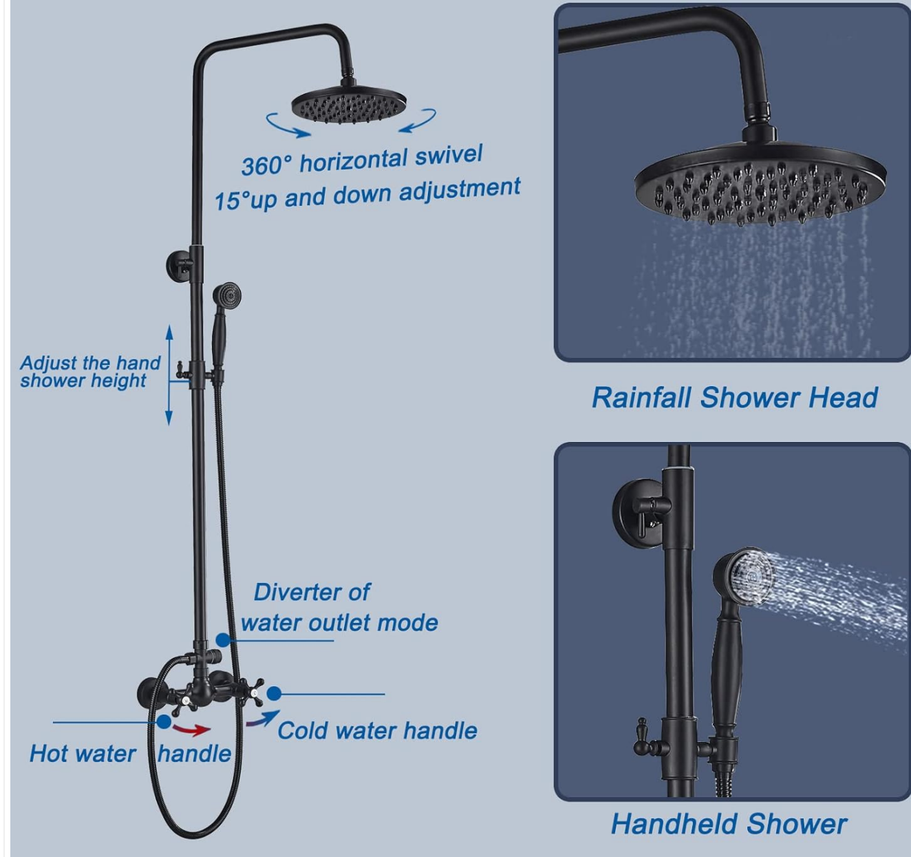
Figure 5: Illustration of the two operational modes: Rainfall Shower Head with its swivel and tilt adjustments, and the Handheld Shower. It also indicates the hot water handle, cold water handle, and the diverter for water outlet mode selection.