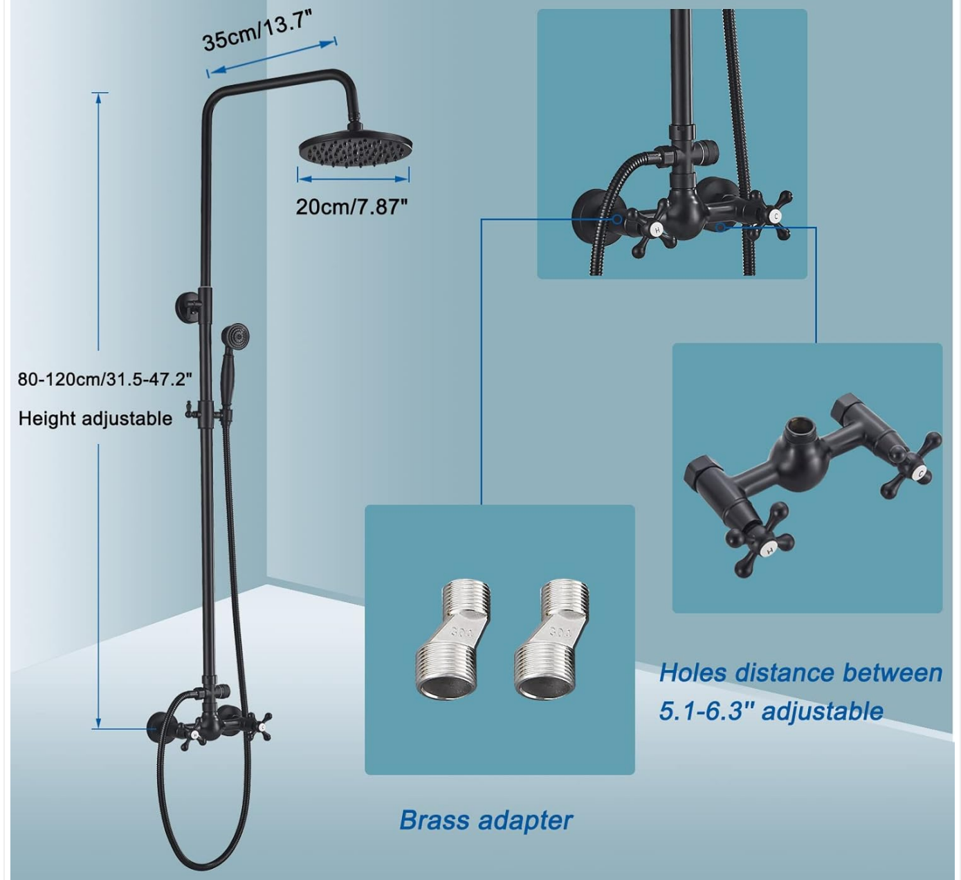
Figure 3: Diagram showing the product dimensions, including the 35cm shower arm, 20cm shower head, and adjustable height range of 80-120cm. It also illustrates the brass adapters and the adjustable hole distance for wall mounting (5.1-6.3 inches).