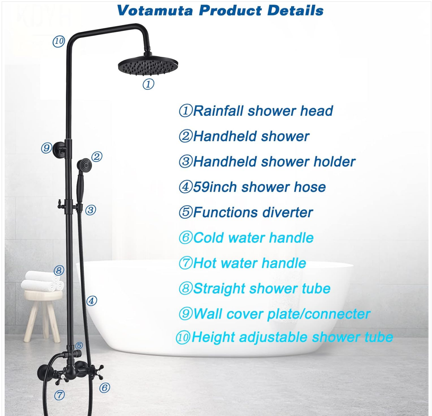
Figure 2: Detailed diagram illustrating the numbered components of the Votamuta shower system, including the rainfall shower head, handheld shower, handheld shower holder, shower hose, functions diverter, cold water handle, hot water handle, straight shower tube, wall cover plate/connector, and height adjustable shower tube.