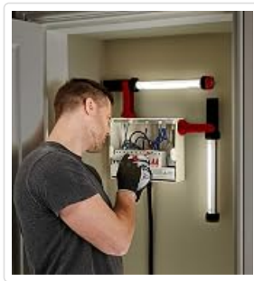
Figure 5.1: Illustration of a person installing an electrical socket (for general reference).