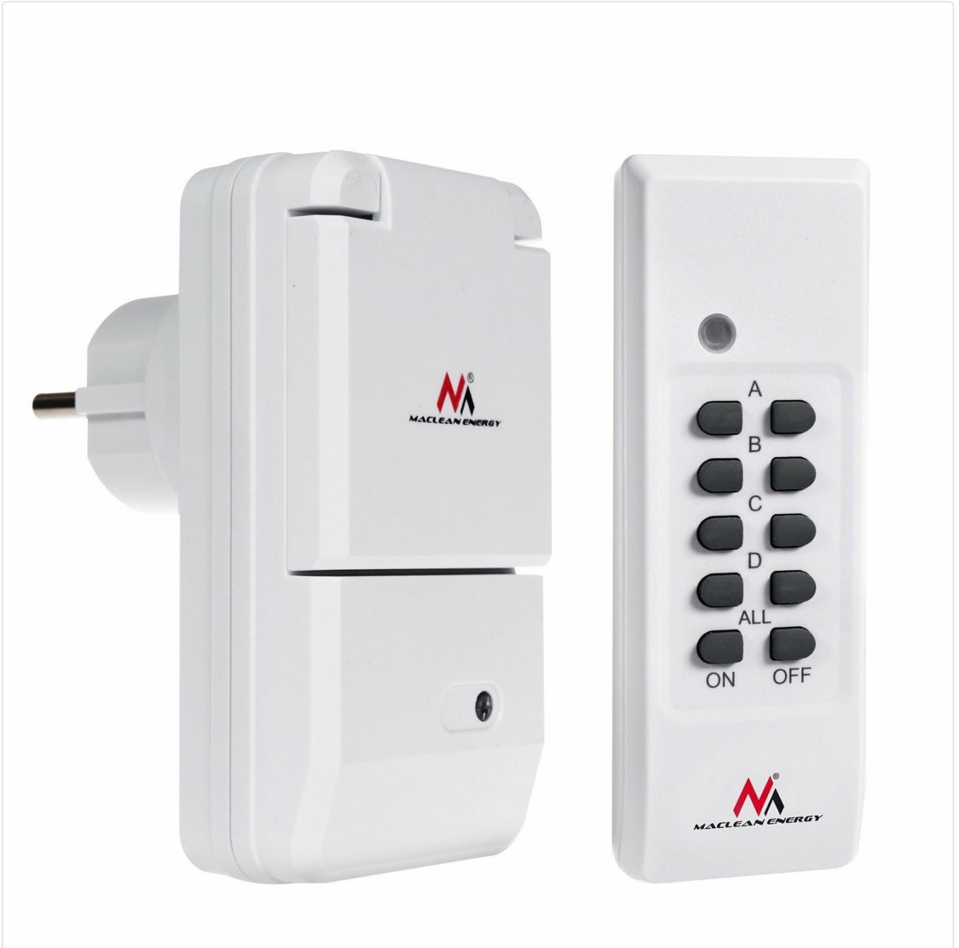
Figure 4.1: Maclean MCE158 Wireless Outdoor Socket with protective lid open.