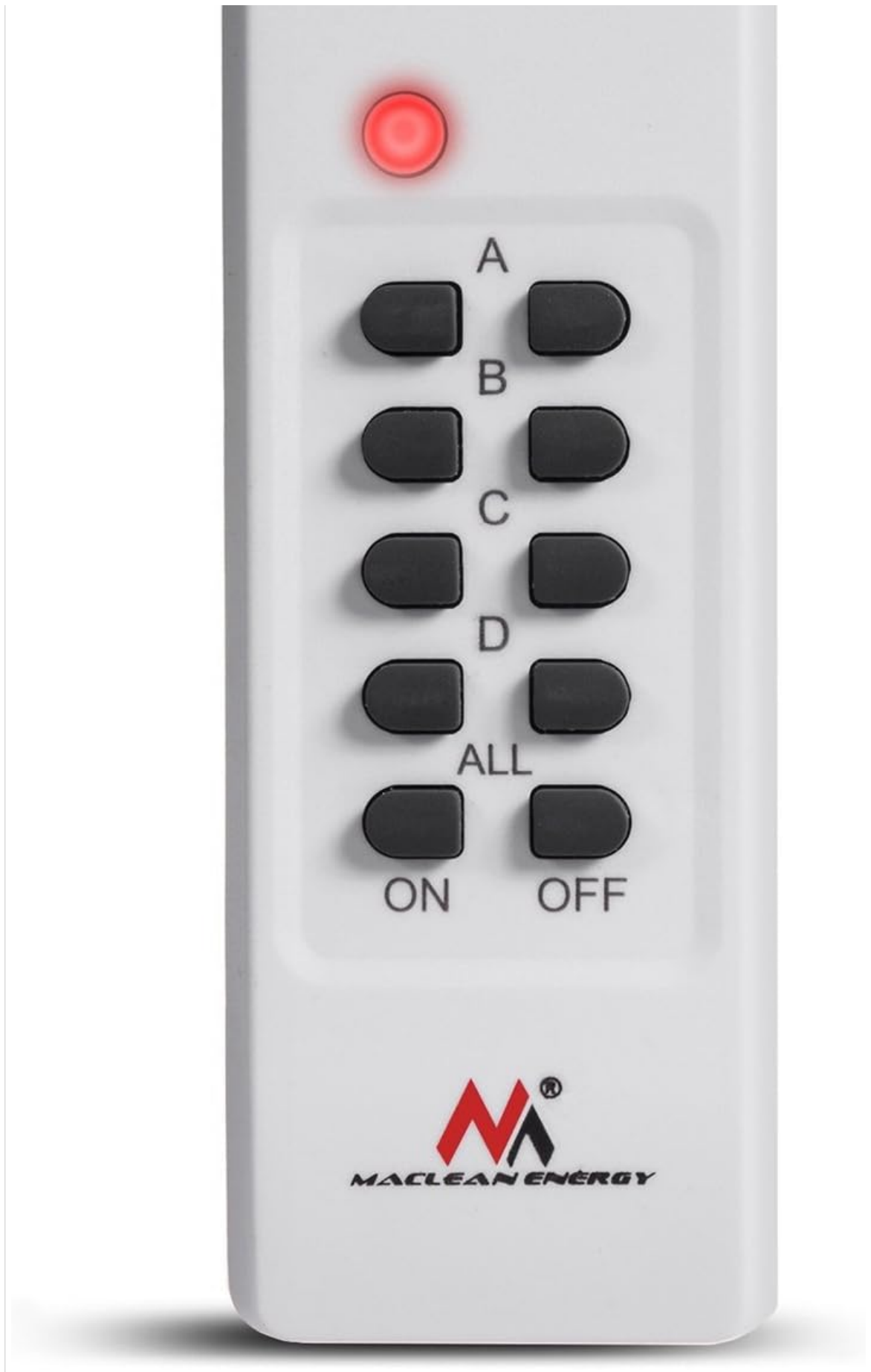
Figure 4.2: Remote control for the MCE158 wireless socket.

The Maclean MCE158 set consists of a wireless outdoor socket and a remote control. The socket features an IP44 rating for splash water protection and a hinged cover for added safety when not in use. The remote control has four channels (A, B, C, D) and master ON/OFF buttons to control multiple sockets or individual channels.