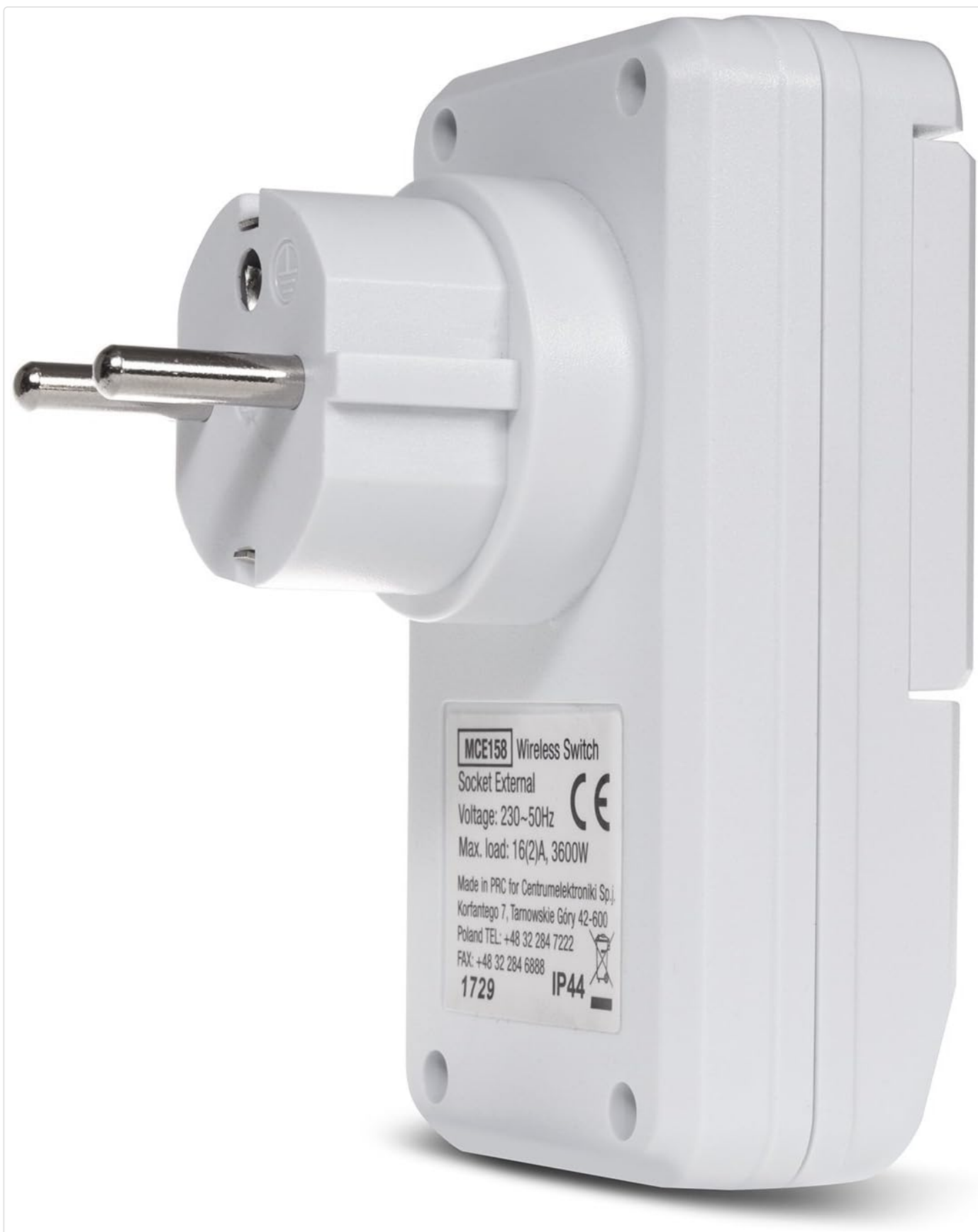
Figure 9.1: Product label with technical specifications.