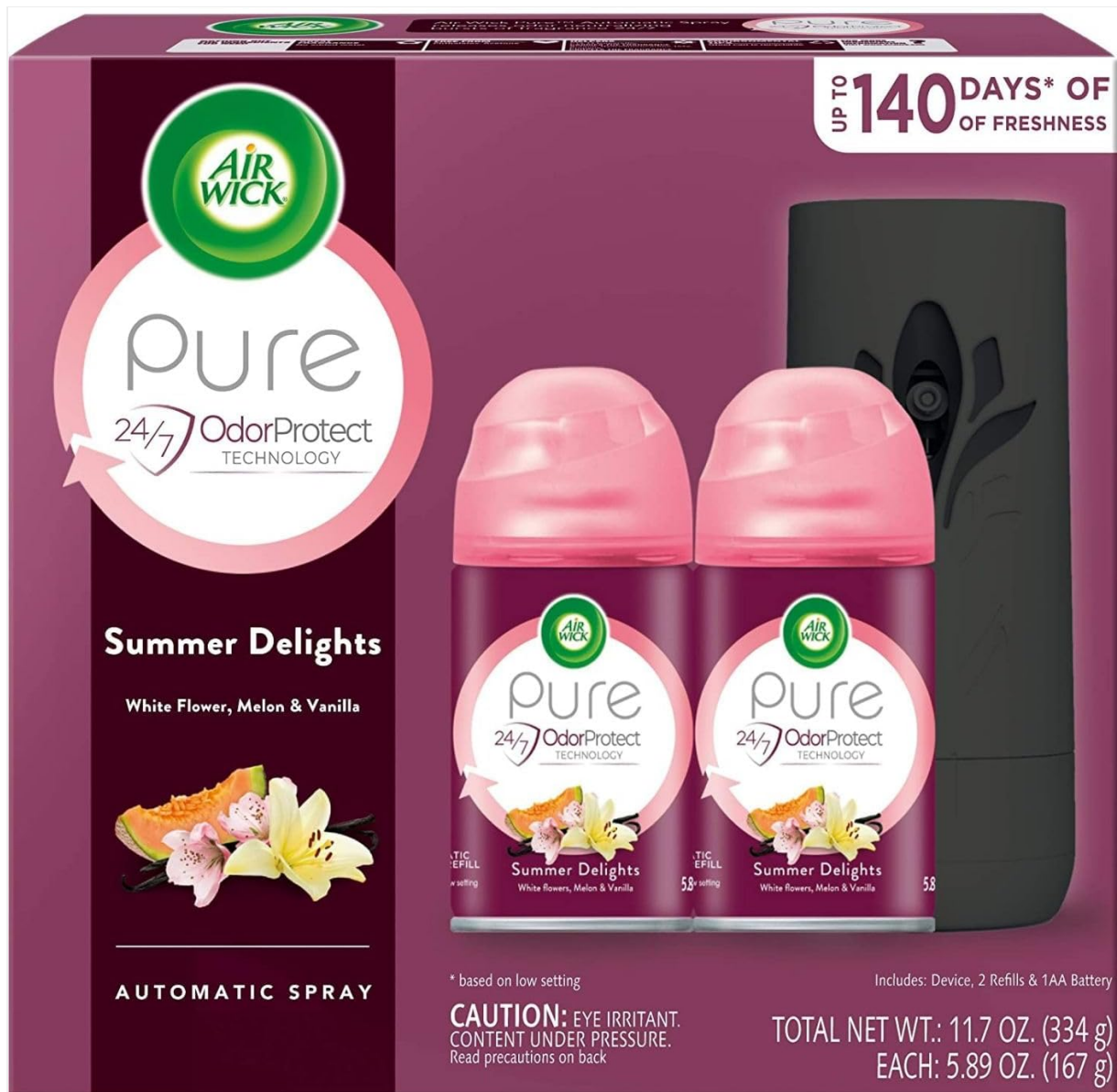
Image: Air Wick Automatic Spray Starter Kit, Summer Delights.