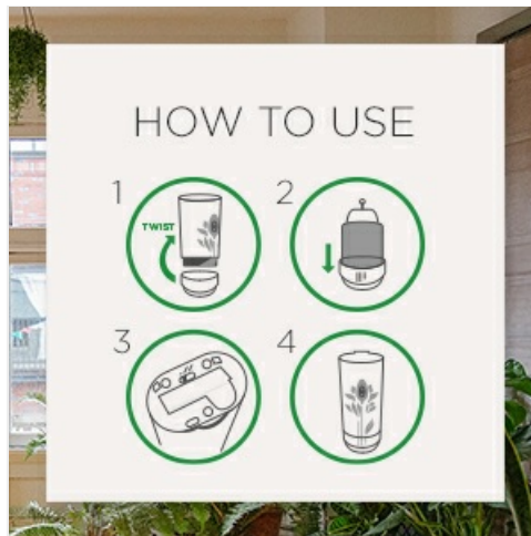
Image: Visual guide for setting up the Air Wick Automatic Spray, illustrating the steps to open, insert refill, and close the device.