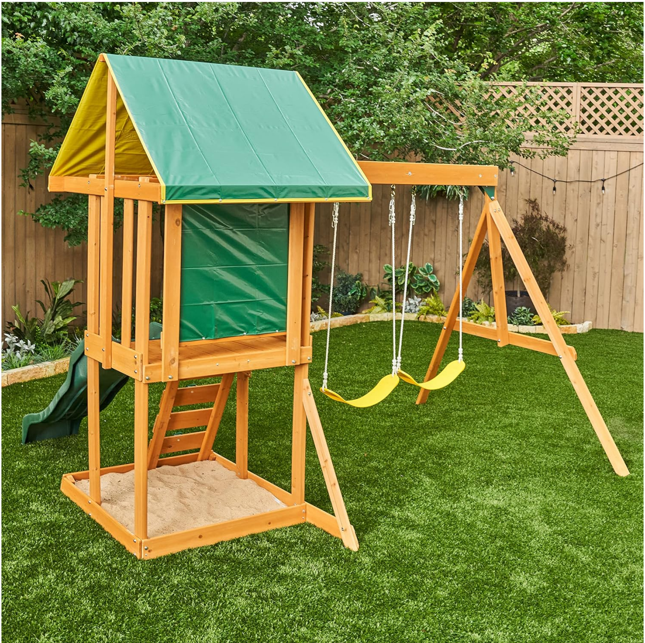
Image 3.2: Back view of the assembled swing set, highlighting the swing beam and support structure.