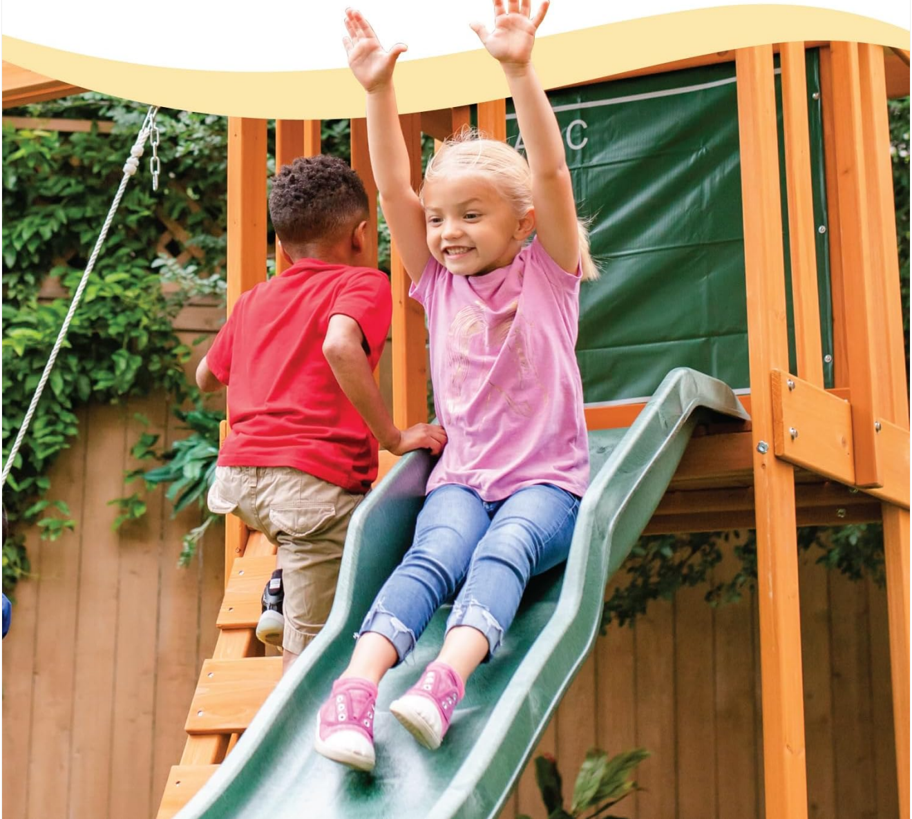
Image 4.3: A child ascending the rock wall ladder, developing climbing skills.