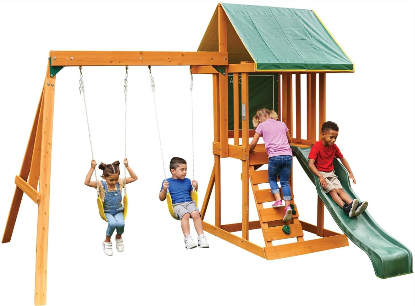
Image 1.1: The KidKraft Appleton Wooden Swing Set, featuring a slide, swings, and a play deck.