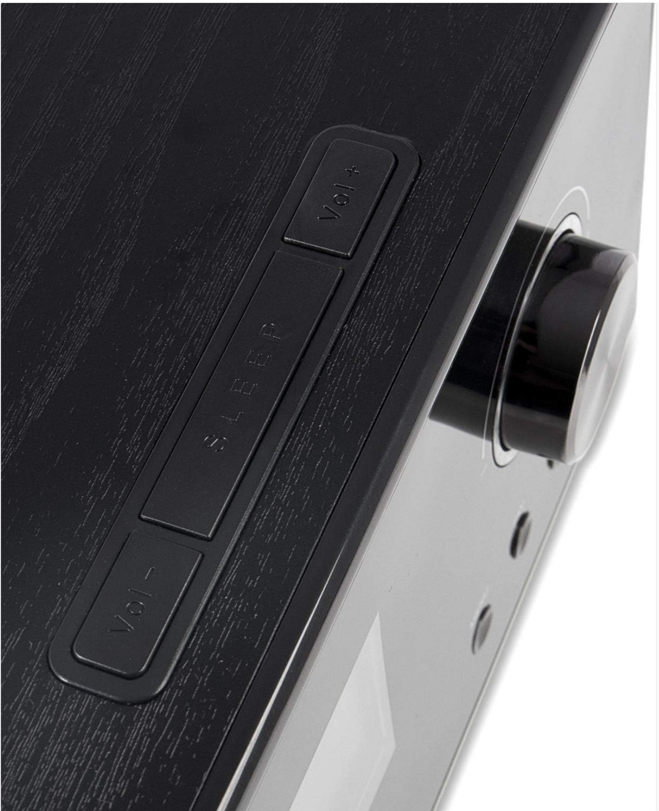
Figure 4.2: Top panel controls.