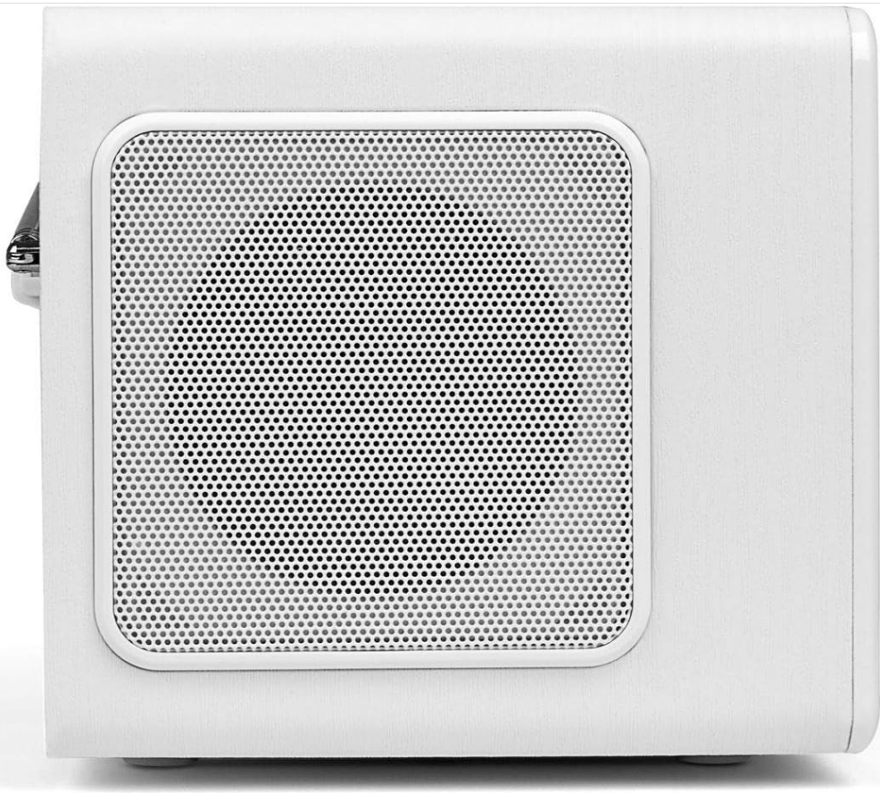
Figure 4.3: Side view with speaker.