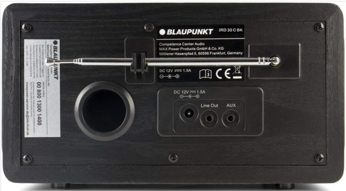
Figure 4.4: Rear panel connections.

The rear panel houses the telescopic antenna, power input, Line Out, and AUX input ports.