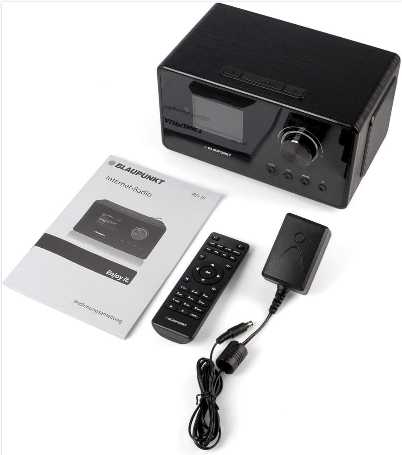
Figure 3.1: Package contents of the Blaupunkt IRD 30c Internet Radio.