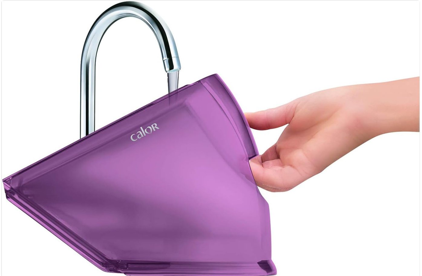
Image 4.1: Demonstrating the process of filling the removable water tank under a faucet.