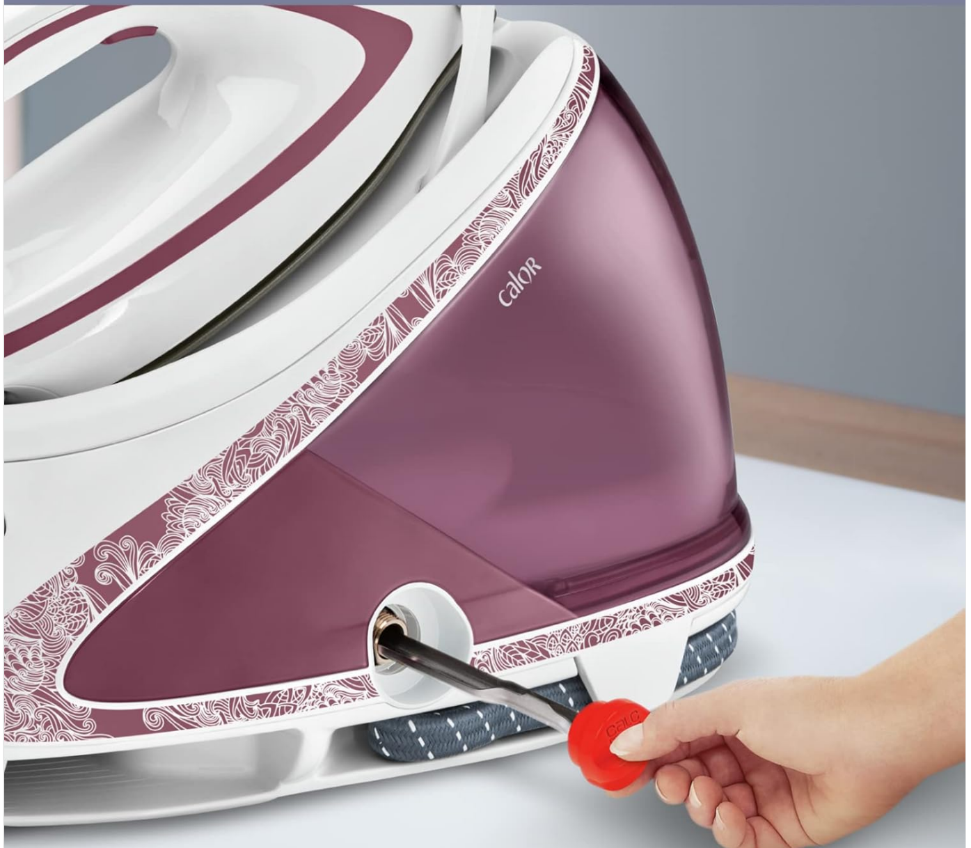
Image 6.1: Illustration of removing the Anti-Calc collector for cleaning and descaling.