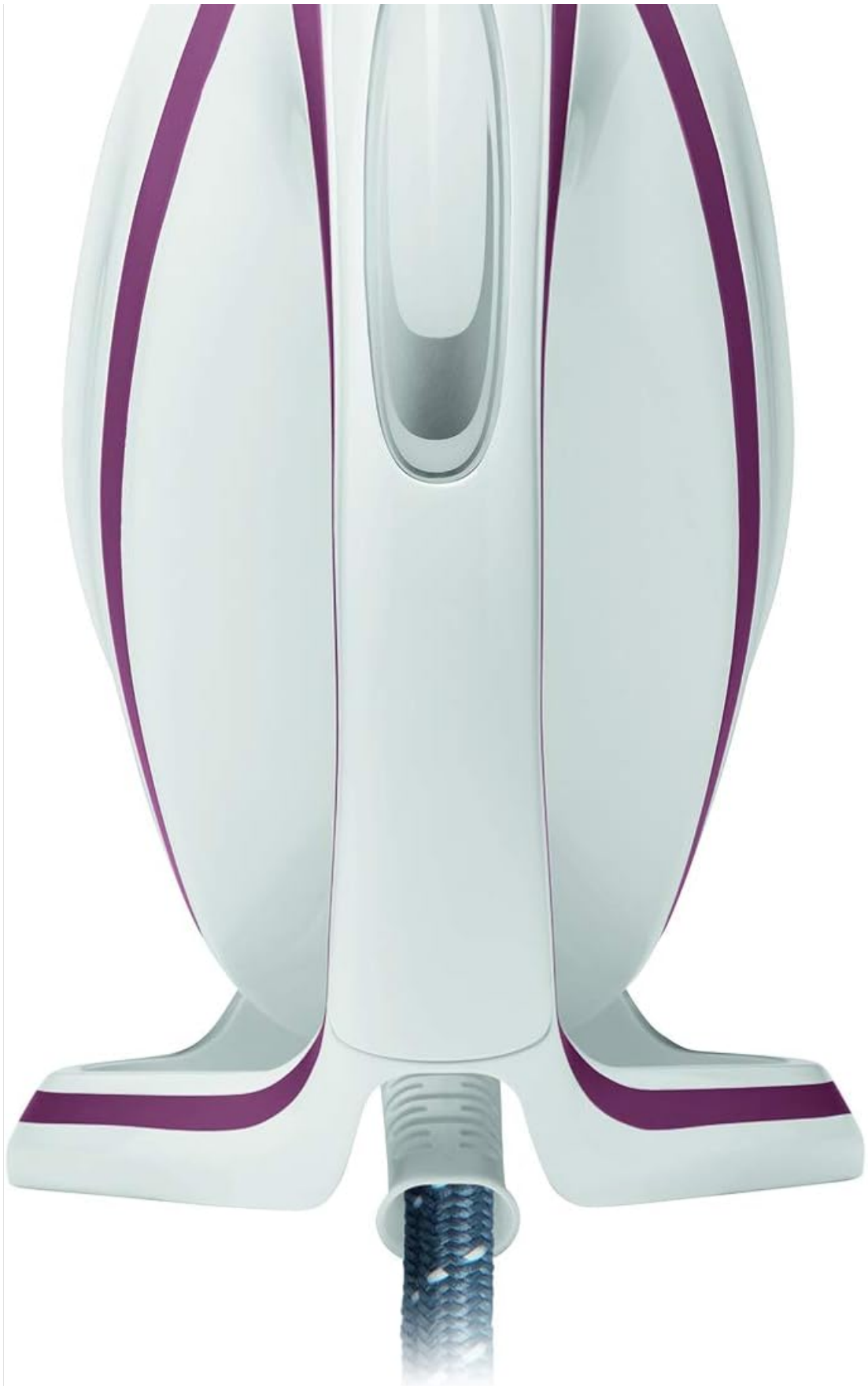
Image 3.3: The Durilium Airglide Autoclean soleplate, designed for smooth gliding and easy maintenance.