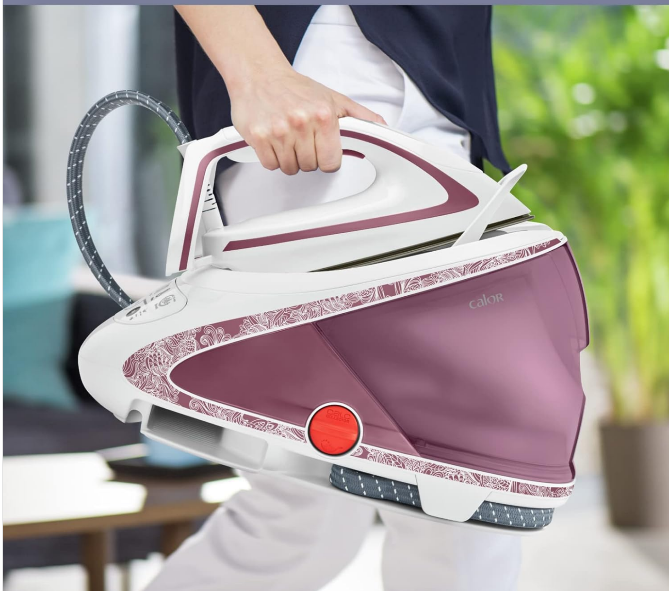
Image 6.2: The steam station is designed for secure transport, making it easy to move and store.