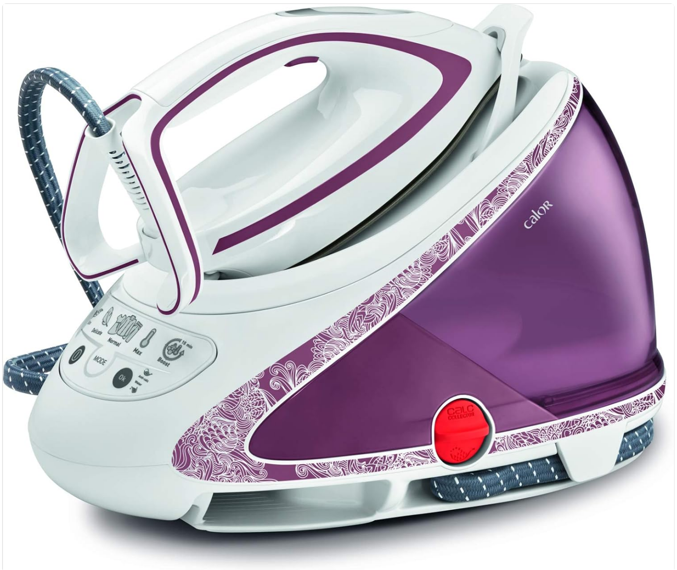
Image 1.1: The Calor Pro Express Ultimate High-Pressure Steam Iron Station, showcasing its compact design and purple accents.