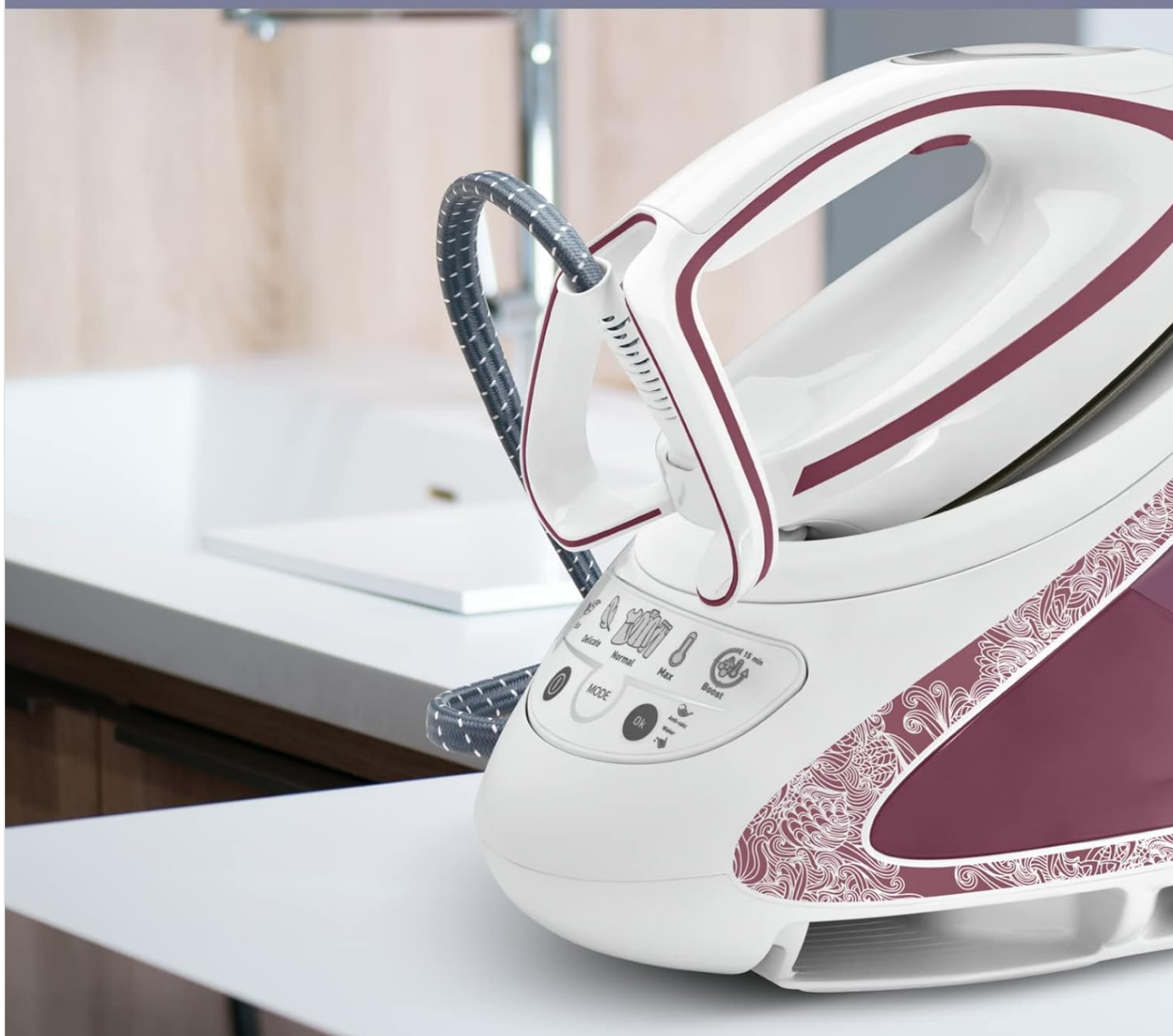
Image 3.2: Detailed view of the intuitive control panel, allowing selection of different ironing modes.