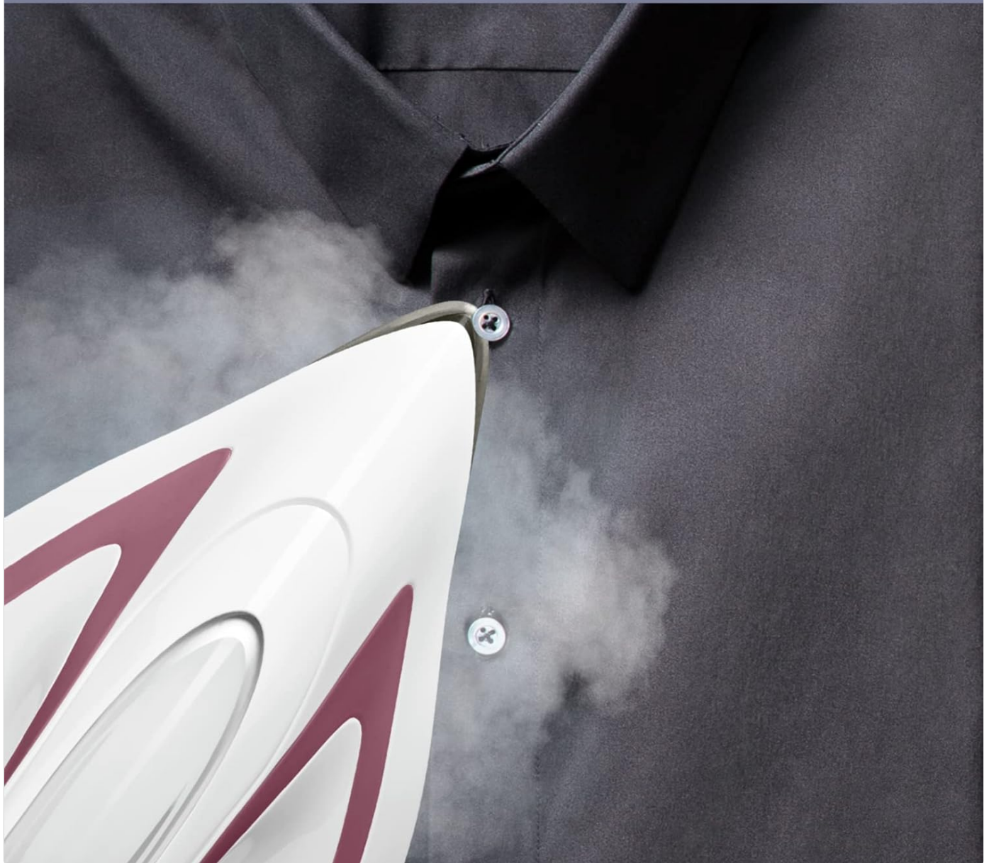
Image 5.1: The iron in use, demonstrating its professional steaming capability on a shirt.