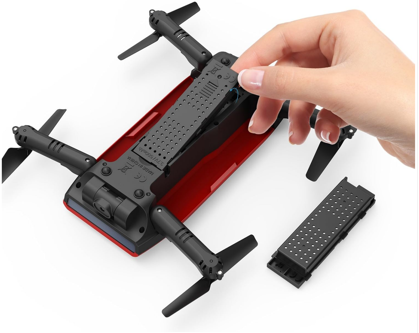
Image: A hand demonstrating the easy installation and removal of the 3.7V 500mAh LiPo battery into the GoolRC T47 drone's battery compartment.