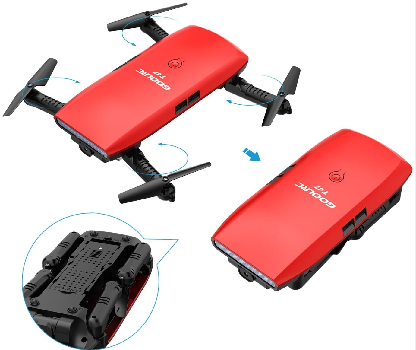
Image: Illustration of the GoolRC T47 drone's foldable arms, showing how they extend for flight and fold inward for compact storage and transport.

The foldable arms, which fold at directional and designated points, make it compact for storage and travel.