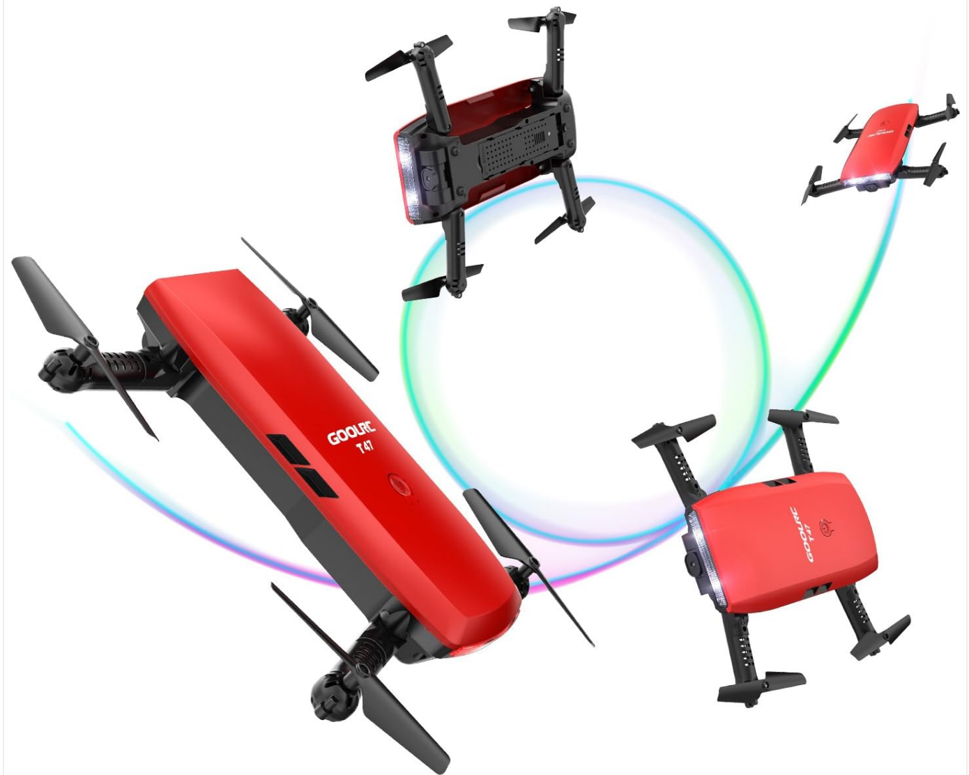
Image: Multiple GoolRC T47 drones depicted in various stages of performing 3D flips and rolls, demonstrating the drone's acrobatic capabilities. The GoolRC T47 supports 3D flip and flight plan functions, providing an engaging flying experience. To perform a 3D flip, fly the drone to a sufficient height (at least 3 meters), then press the 3D flip button on the controller and push the right joystick in the desired flip direction.

3D flip and flight plan function, which provide a lot of flying fun.