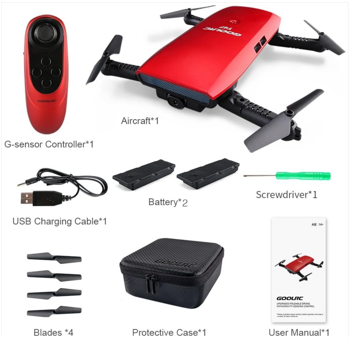
Image: A visual representation of all items included in the GoolRC T47 FPV Drone package, including the drone, controller, batteries, charging cable, screwdriver, spare blades, protective case, and user manual.