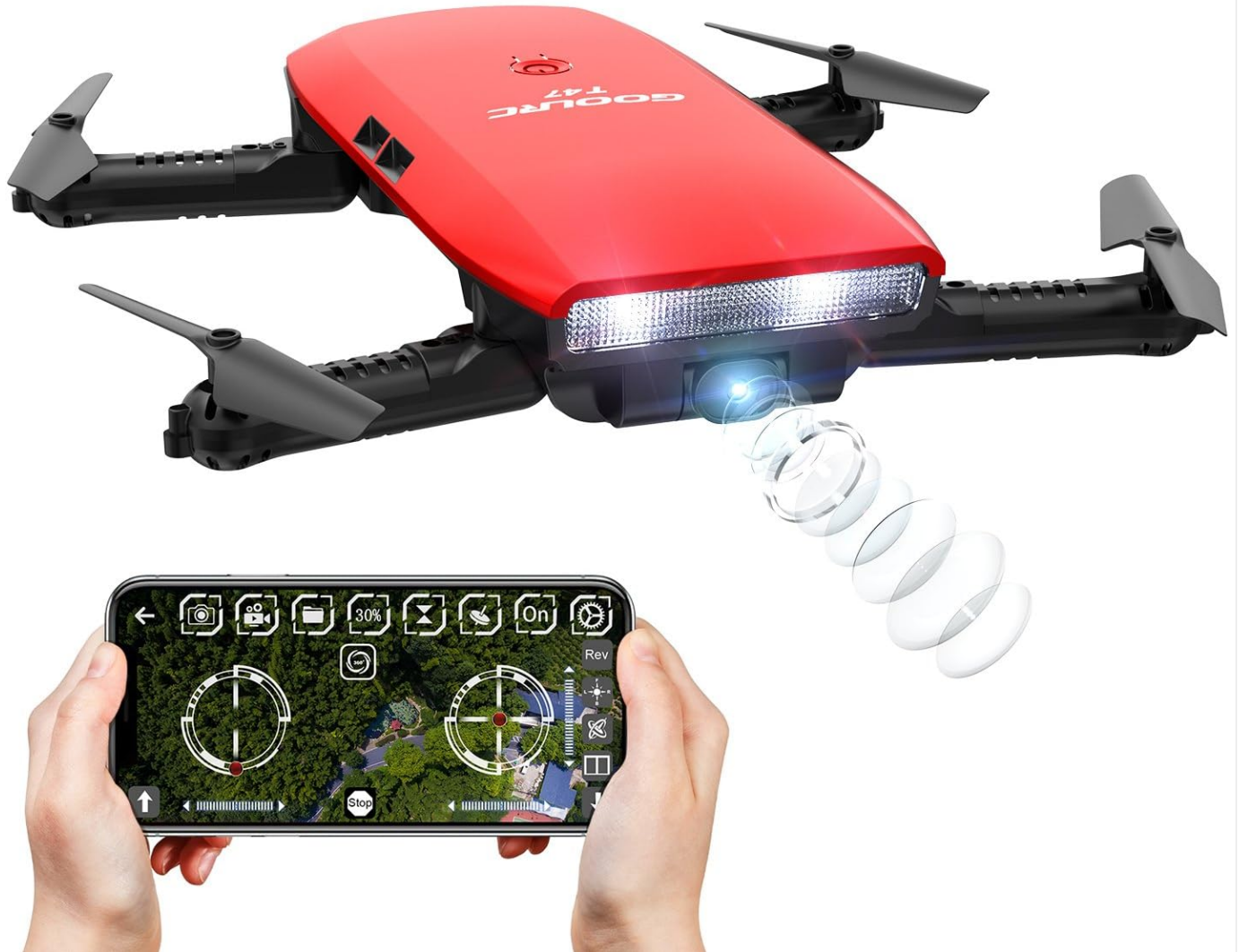
Image: The GoolRC T47 drone with its 720P WiFi camera, alongside a smartphone displaying the live FPV feed and control interface, highlighting its photography capabilities.

The 720P camera with WiFi real-time transmission FPV system allows you to capture photos and videos directly to your smartphone. The image transmission range is approximately 30 meters.