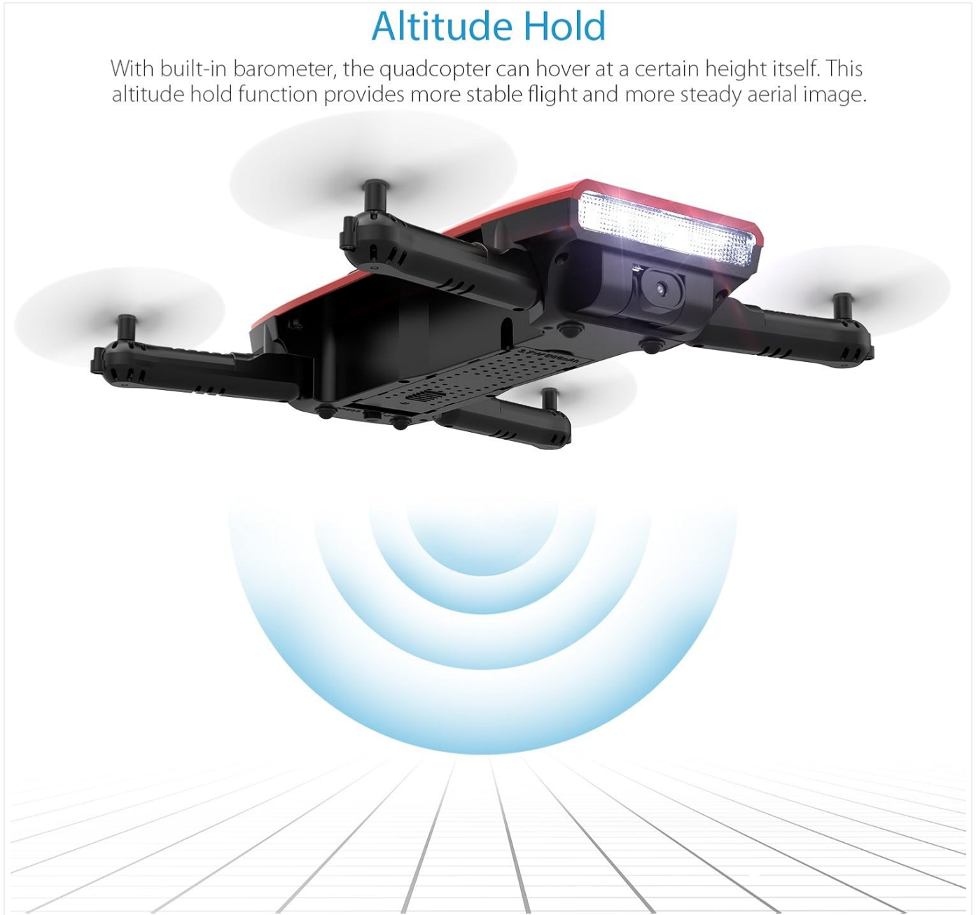
Image: The GoolRC T47 drone hovering stably, illustrating the Altitude Hold function which maintains a consistent height using a built-in barometer. With the built-in barometer, the quadcopter can hover at a certain height itself. This altitude hold function provides more stable flight and more steady aerial images. Once the drone reaches a desired altitude, release the throttle stick, and the drone will maintain its height.