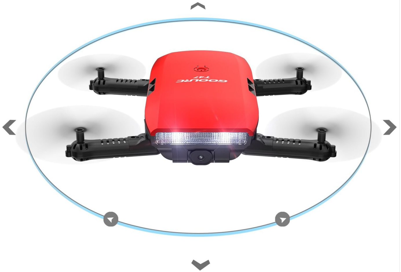
Image: The GoolRC T47 drone flying in Headless Mode, indicating that its flight direction is relative to the pilot's position, regardless of the drone's actual orientation.

In headless mode, the drone will fly toward the direction of the joystick, regardless of the head of the drone. Easy to control.