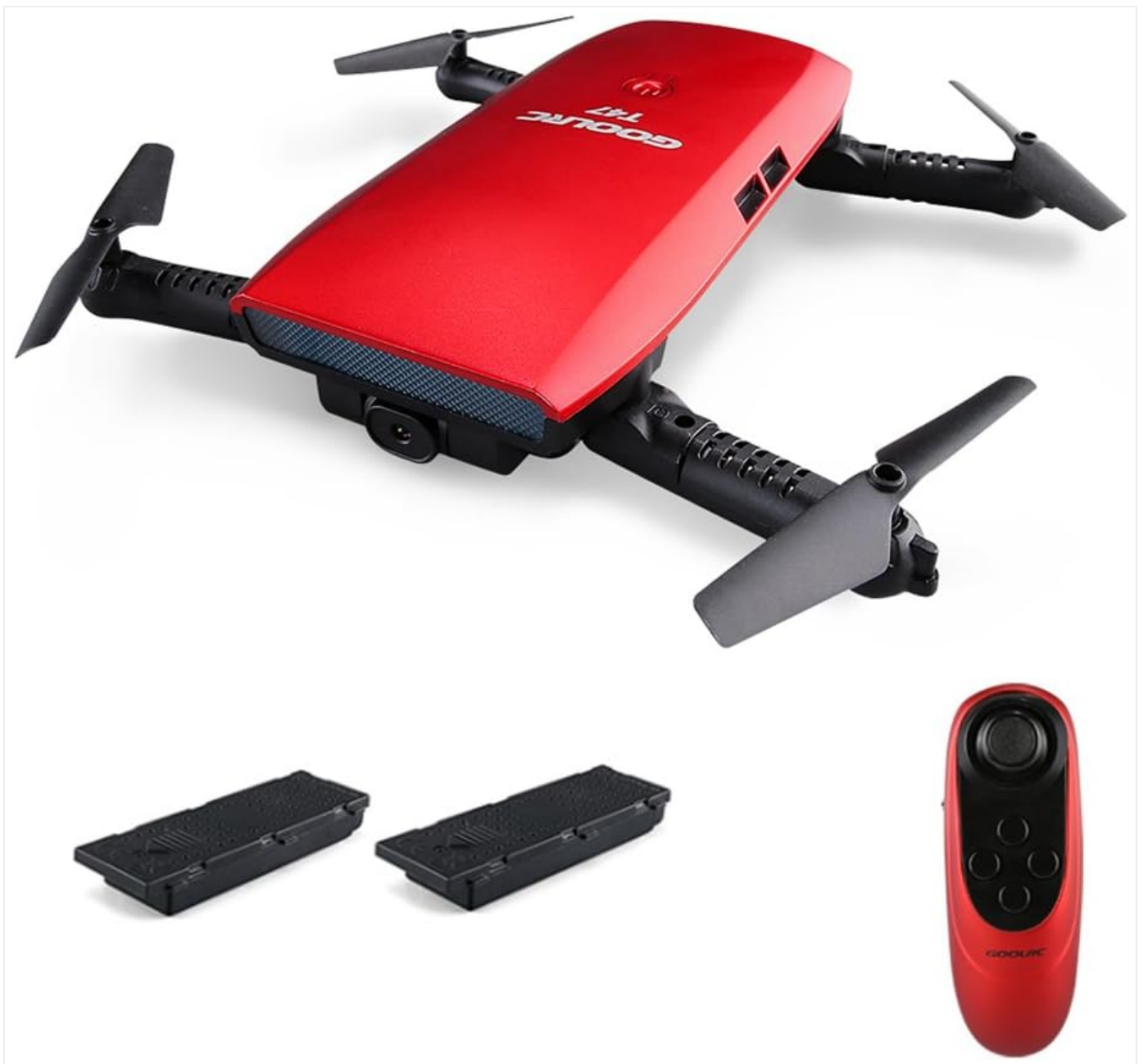
Image: The GoolRC T47 FPV Drone, showcasing its compact design, along with the included remote controller and two rechargeable batteries.