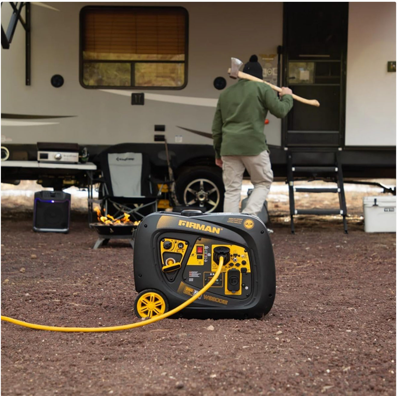
Image: The FIRMAN W03082 generator is shown in an outdoor setting, connected via a yellow power cord to an RV, demonstrating its use for recreational power supply.