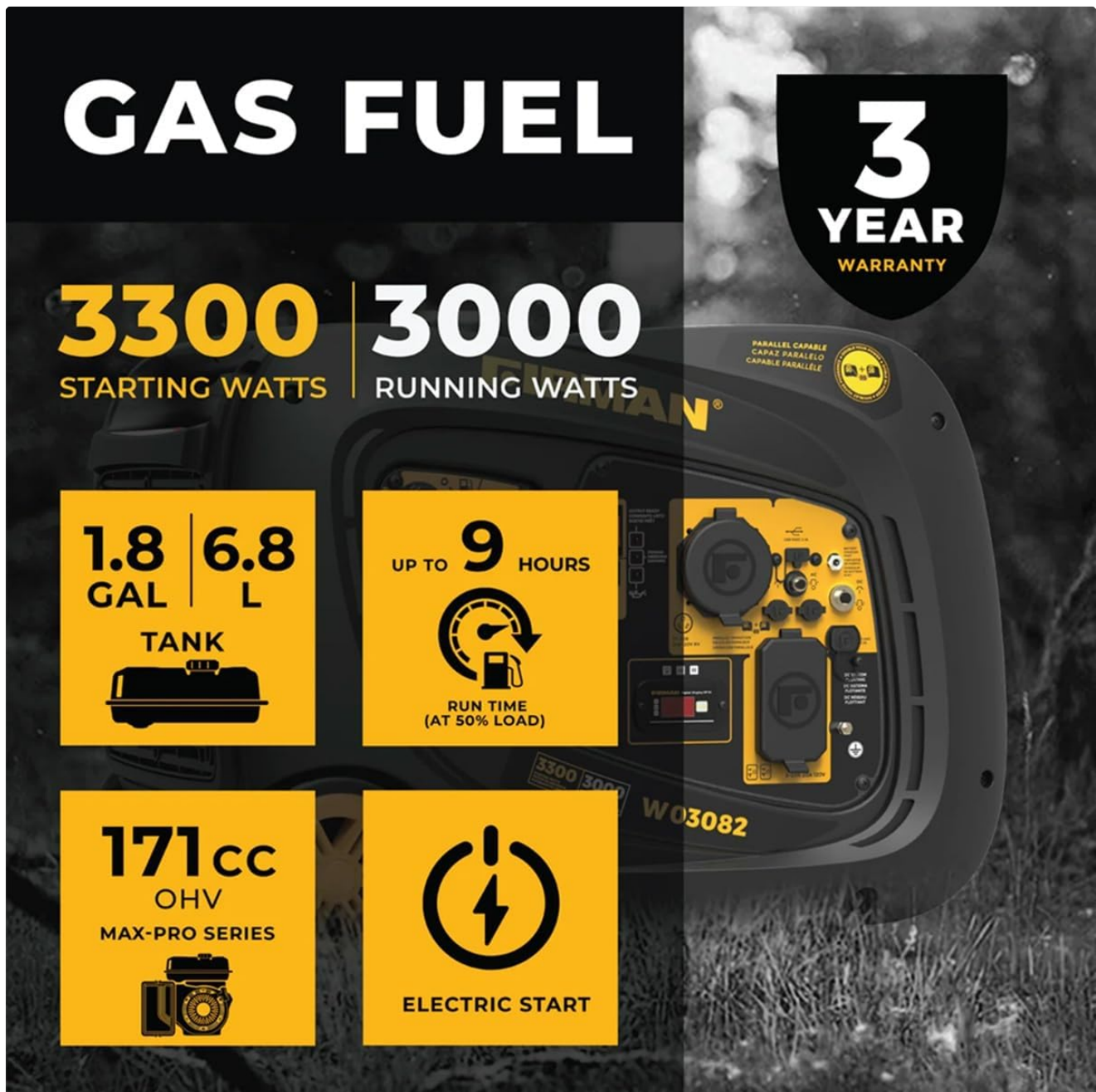
Image: An infographic detailing the generator's fuel type (Gas), starting watts (3300), running watts (3000), tank capacity (1.8 gal / 6.8 L), run time (up to 9 hours at 50% load), engine size (171cc OHV Max-Pro Series), and electric start feature.