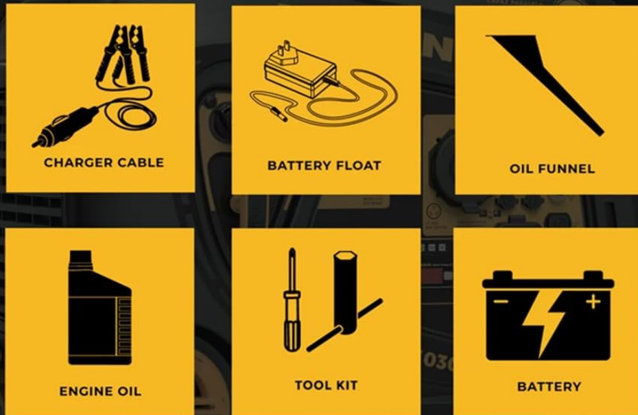
Image: A visual representation of the accessories included with the generator, such as a charger cable, battery float, oil funnel, engine oil, tool kit, and battery.