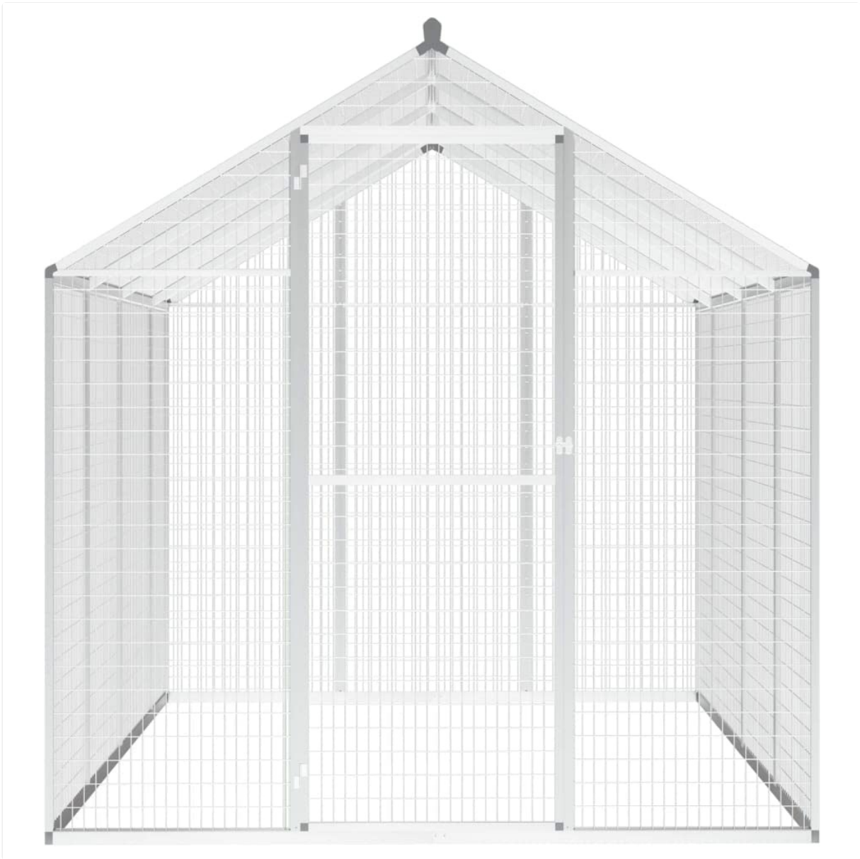
Figure 5.3: Side View.

This image provides a side perspective of the aviary, showcasing its elongated structure and the continuous mesh panels.