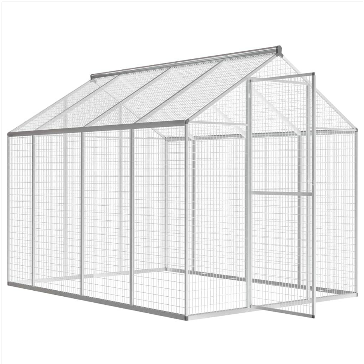
Figure 5.4: Aviary with Door Open.

An angled view of the aviary with its door ajar, providing a glimpse into the spacious interior and demonstrating the accessibility for maintenance or bird placement.