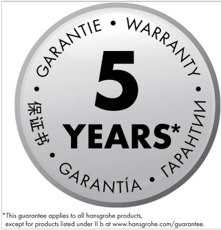
Figure 3: Hansgrohe 5 Years Warranty badge, indicating the product's warranty period.