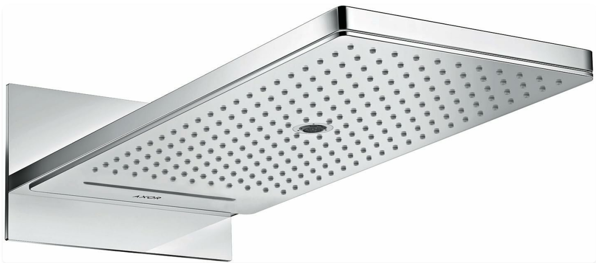
Figure 2.1: Hansgrohe Axor 3-Jet Shower Head in an installed setting, showcasing its sleek design and water flow.