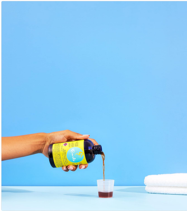
Curls Blueberry Bliss Liquid Hair Growth Vitamin bottle with a measuring cup for accurate dosage.