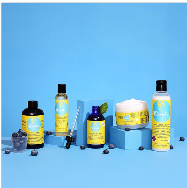
An assortment of Curls Blueberry Bliss hair care products, showcasing the full collection.