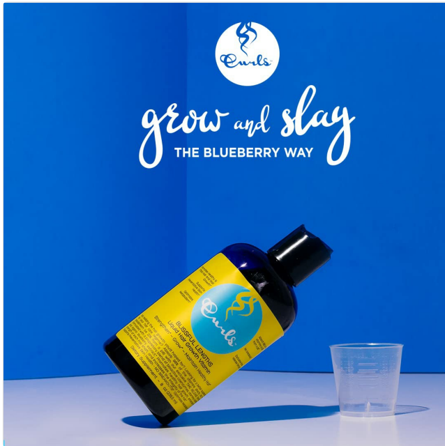
The Curls Blueberry Bliss Liquid Hair Growth Vitamin bottle shown alongside the Blueberry & Mint Scalp Treatment.