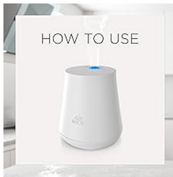
Image: Turn on the device with the slider and select the intensity setting.