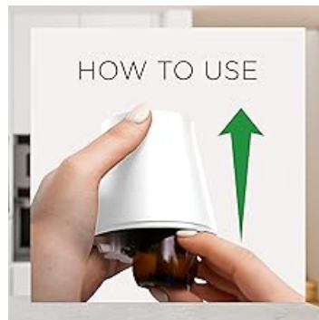
Image: Remove the refill cap and firmly push the refill bottle into the diffuser until it clicks.