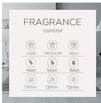
Image: Detailed view of the fragrance control settings.