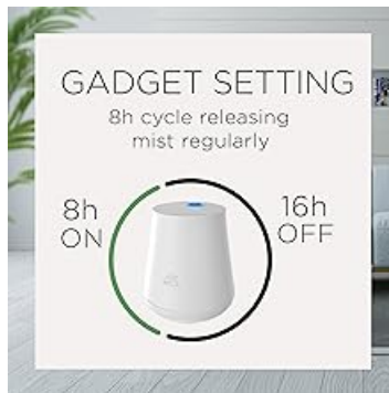
Image: The diffuser's 8-hour operational cycle followed by a 16-hour standby period.