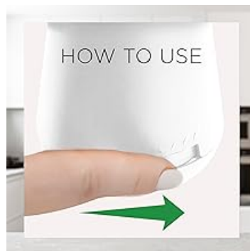
Image: Replace the base cover onto the diffuser.