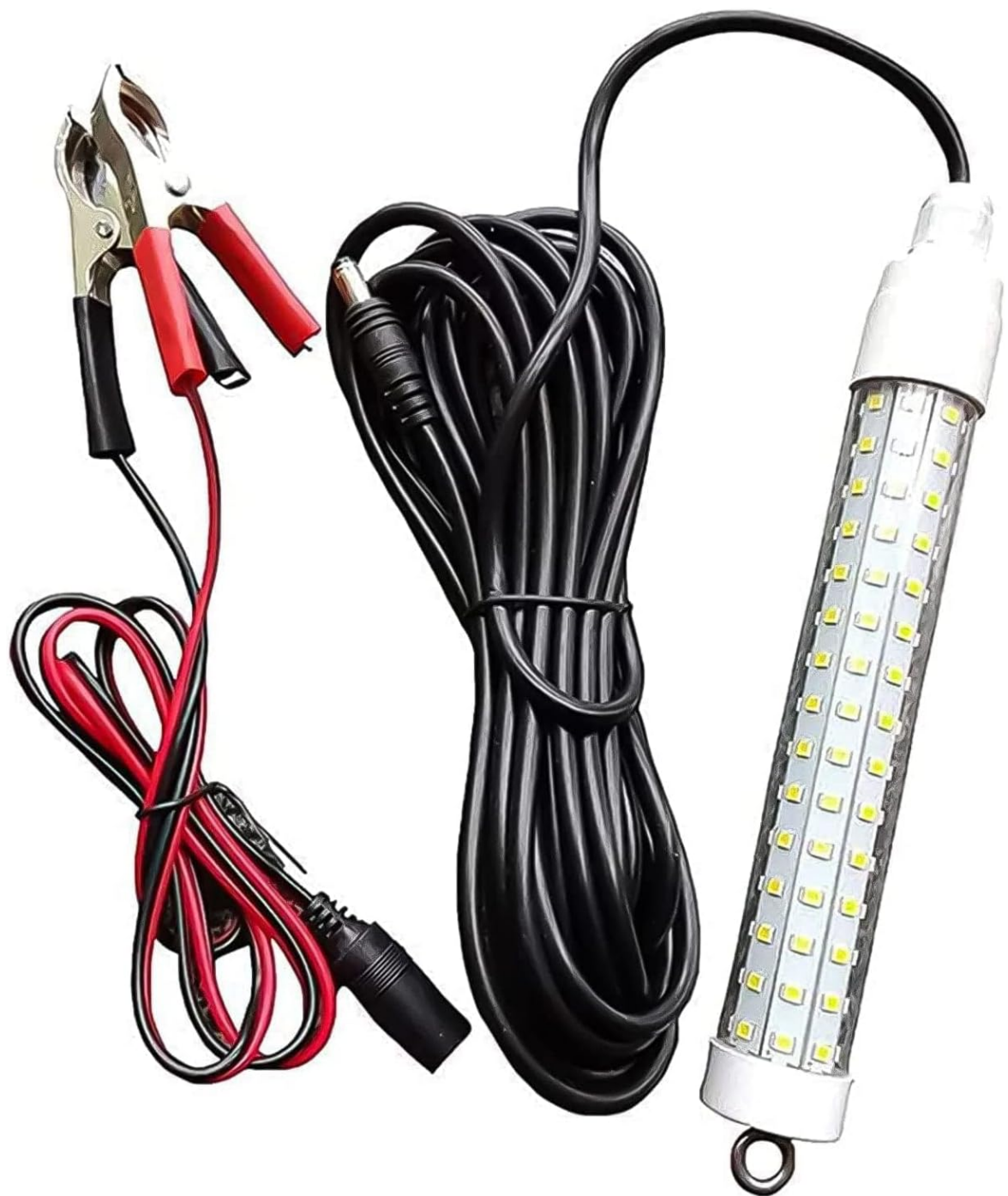
Figure 1.1: Linkstyle 120 LED Underwater Submersible Fishing Light components.