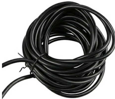
Figure 3.1: Power cord included in the package.