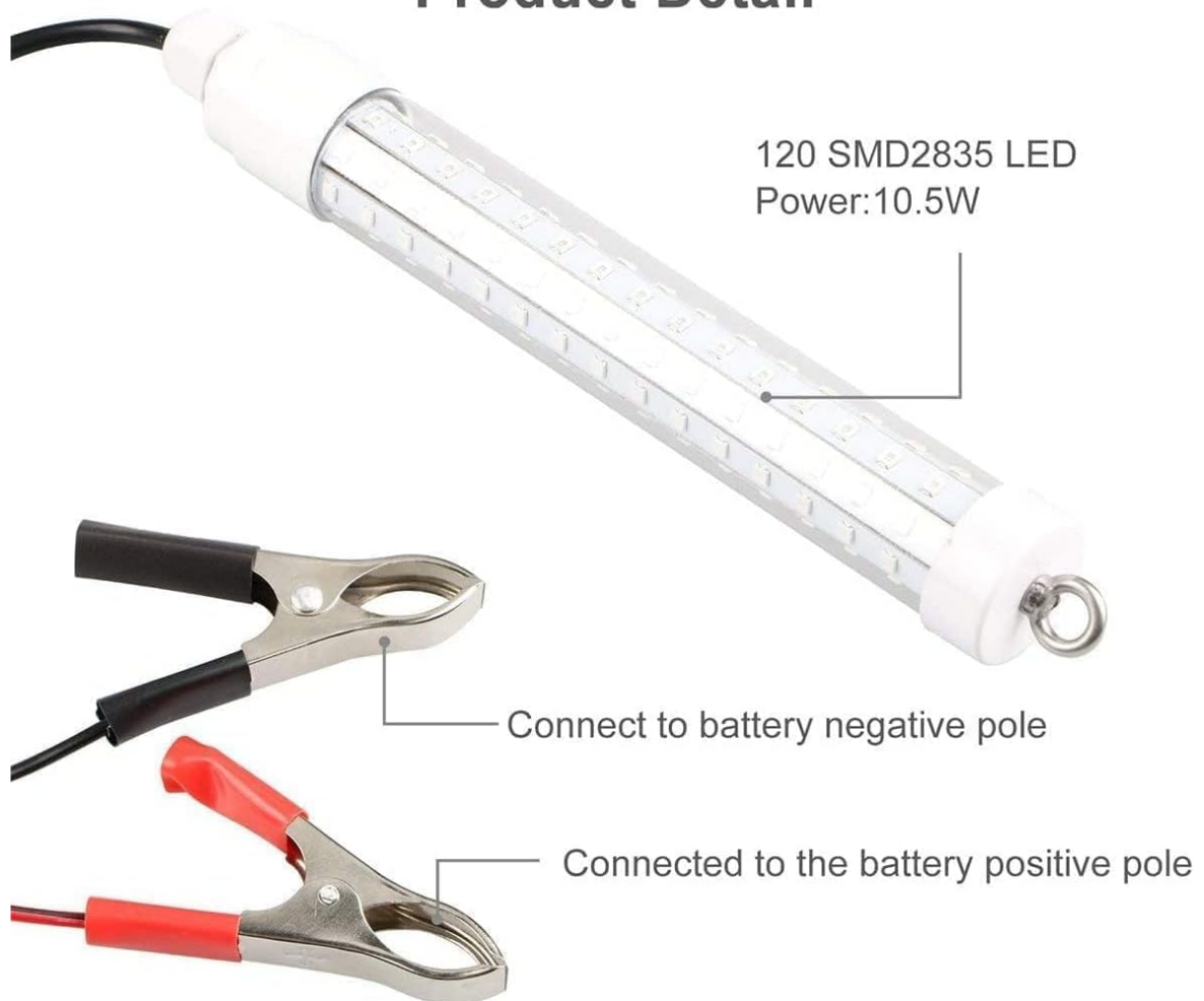
Figure 4.2: Detailed view of the light's components and connection points.