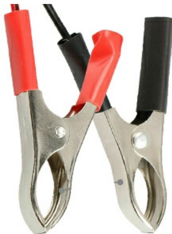
Figure 4.1: Battery clamps for power connection.