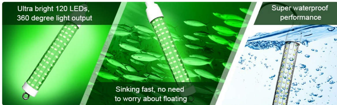
Figure 2.1: Key features of the fishing light.