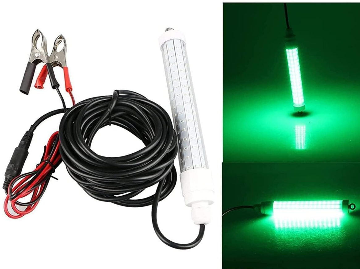
Figure 2.2: Principle of submersible fishing light operation.

The principle of submersible fishing light is that the light attracts insects and plankton to gather in the water, thereby attracting fish to come and prey on these small creatures.