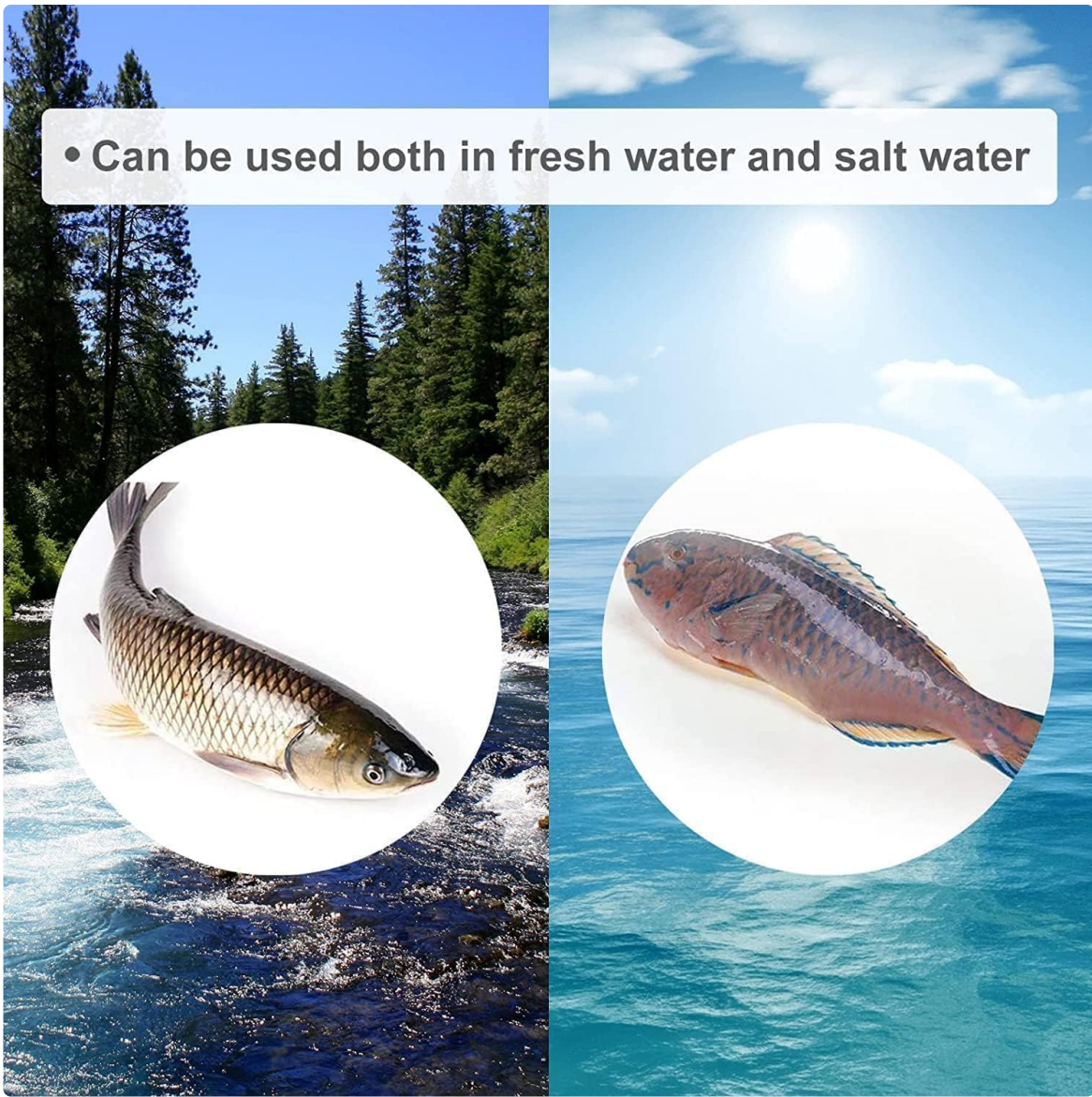
Figure 5.1: Versatility for fresh and saltwater use.