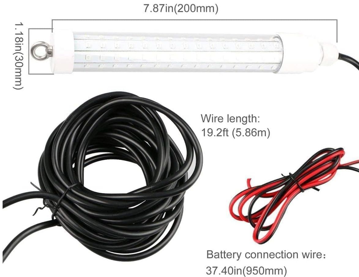
Figure 8.1: Product dimensions and cable lengths.