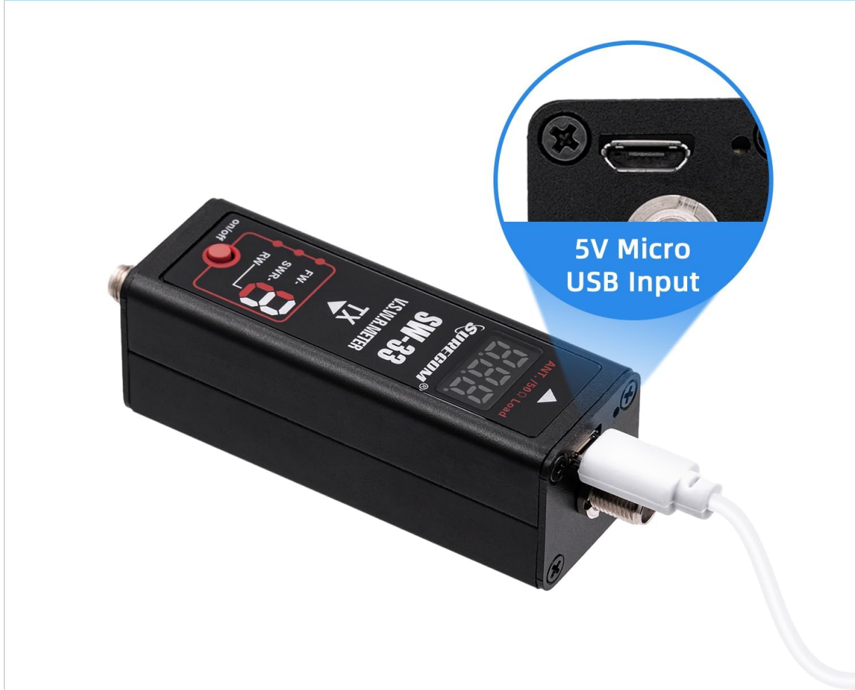
Figure 4.1: The meter being charged via its convenient Micro USB port.