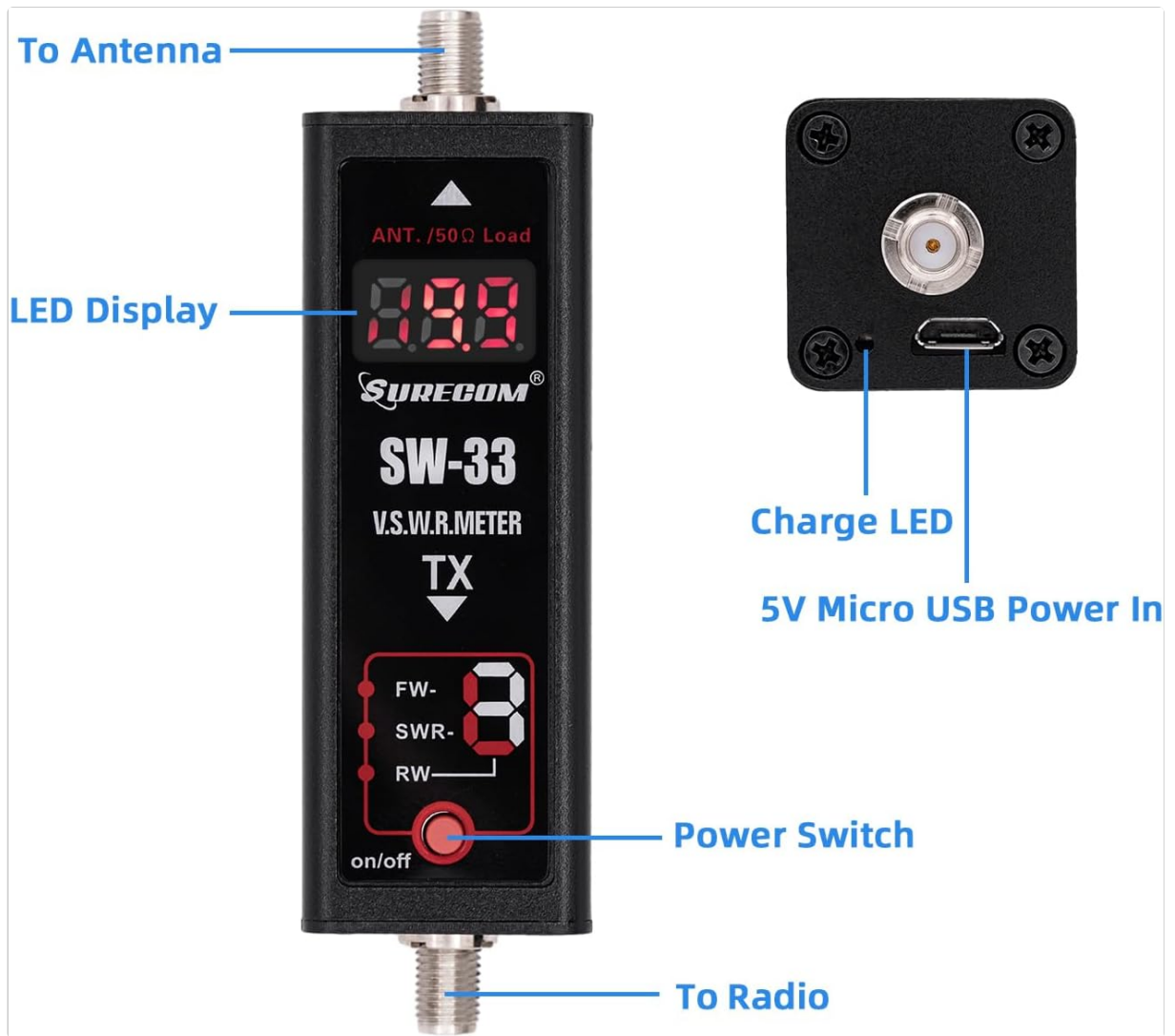
Figure 3.1: Detailed diagram highlighting the main components and connection points of the SW-33 Mark II.