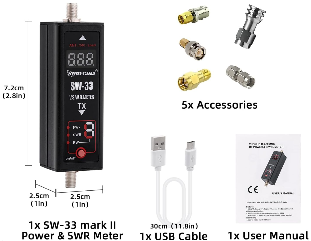
Figure 2.1: A complete view of all items included in the product package.