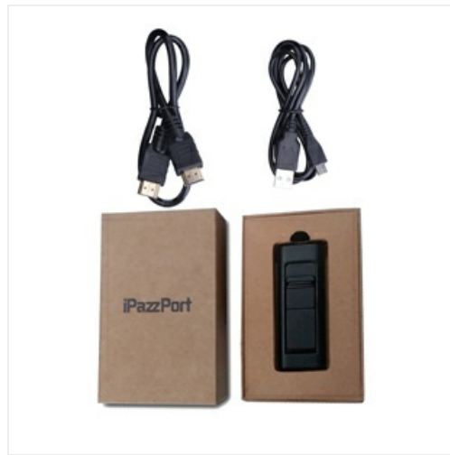
Image: Contents of the iPazzPort Wireless HDMI Display Adapter package, including the adapter, cables, and manual.