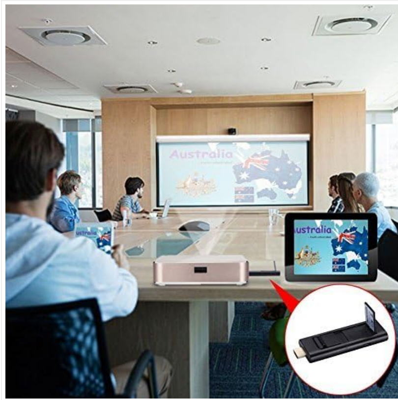
Image: The iPazzPort adapter facilitating a presentation in a meeting room, displaying content from a tablet to a projector screen.