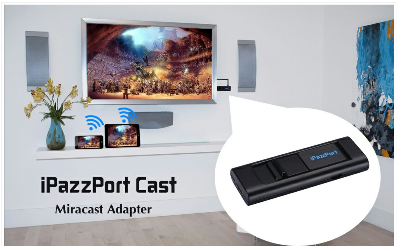
Image: Diagram illustrating how to connect the iPazzPort adapter to Android and iOS devices, and then wirelessly to a monitor, HD TV, or projector.

Video: A demonstration of the physical connection process for the iPazzPort Wireless HDMI Display Adapter, showing how to connect the power cable and HDMI extension to the device and then to a power source and TV.