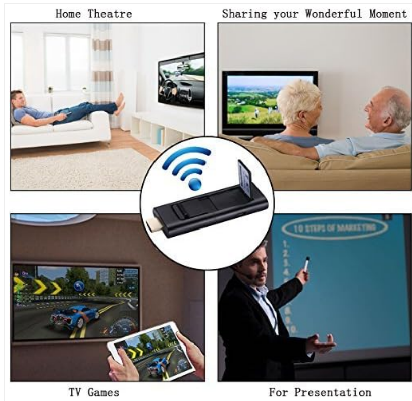
Image: Examples of using the iPazzPort adapter for home theater, sharing moments, TV games, and business presentations.

Open your photo gallery or video player on your mobile device. The content will automatically display on the connected screen. For videos, ensure your device is in landscape mode for optimal viewing on the larger display.