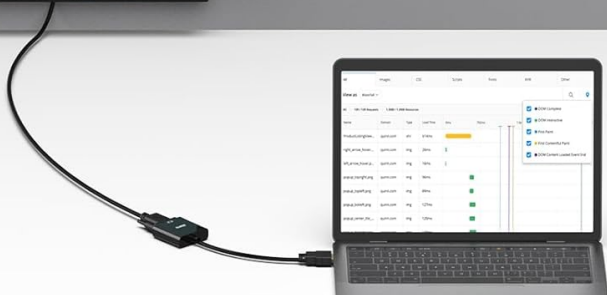
Figure 4: Mirror Mode and Extend Mode Functionality.