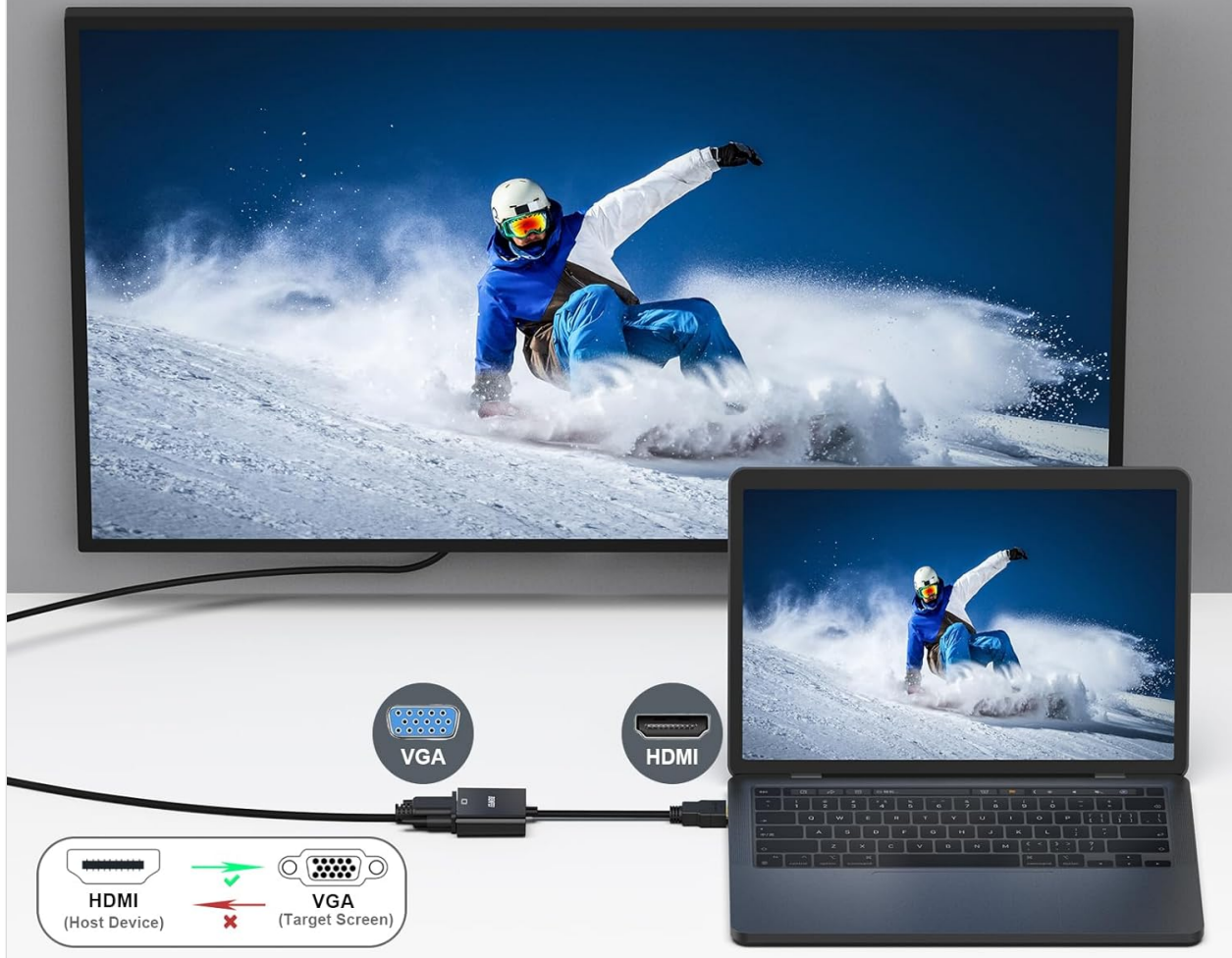
Figure 5: High-Definition Display at 1080P@60Hz Resolution.

High-definition and Crystal-clear Pictures