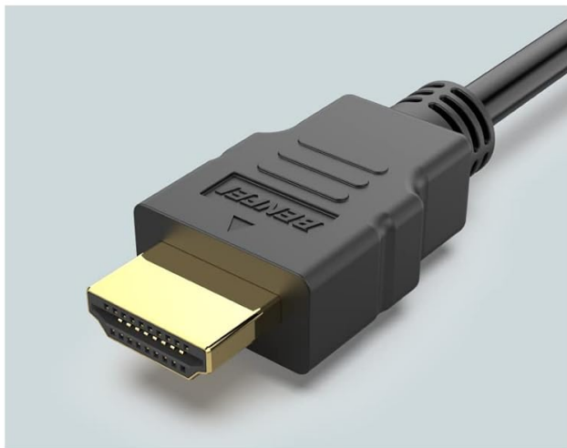
24K Gold Plated HDMI connector