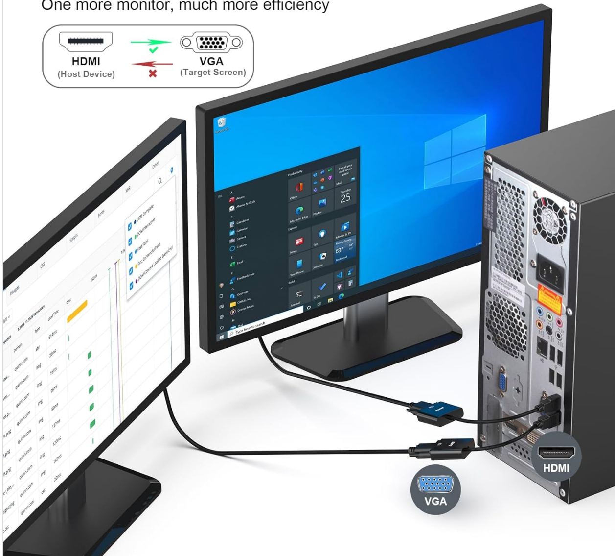
Figure 3: Example Setup for a Workstation with HDMI to VGA Adapter.