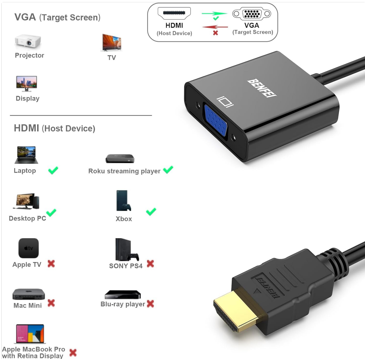
Figure 2: Compatible Devices for HDMI Input and VGA Output.