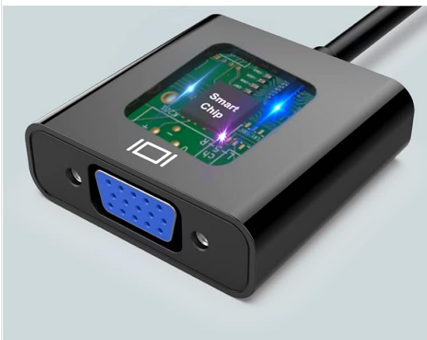
Upgraded chip solution