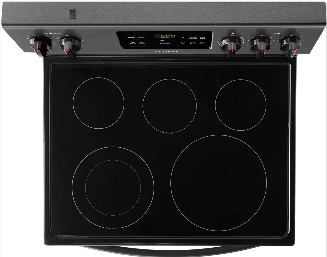
Image 4.1: Top-down view of the smoothtop cooktop with five elements and control knobs.

Your range features a smoothtop cooktop with five elements, including a 3,000W element for faster boiling and flexible elements that expand to accommodate various pot and pan sizes. The cooktop also includes a dedicated warm zone.