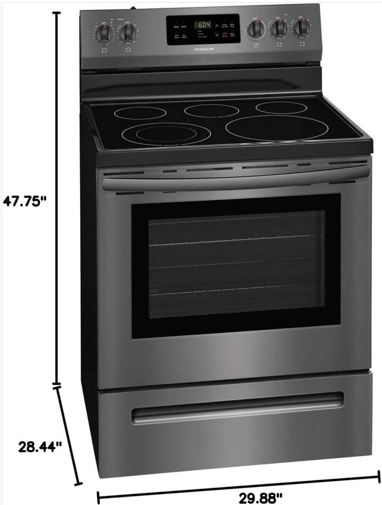
Image 3.1: Dimensional drawing of the Frigidaire FFEF3054TD electric range, showing height, width, and depth.