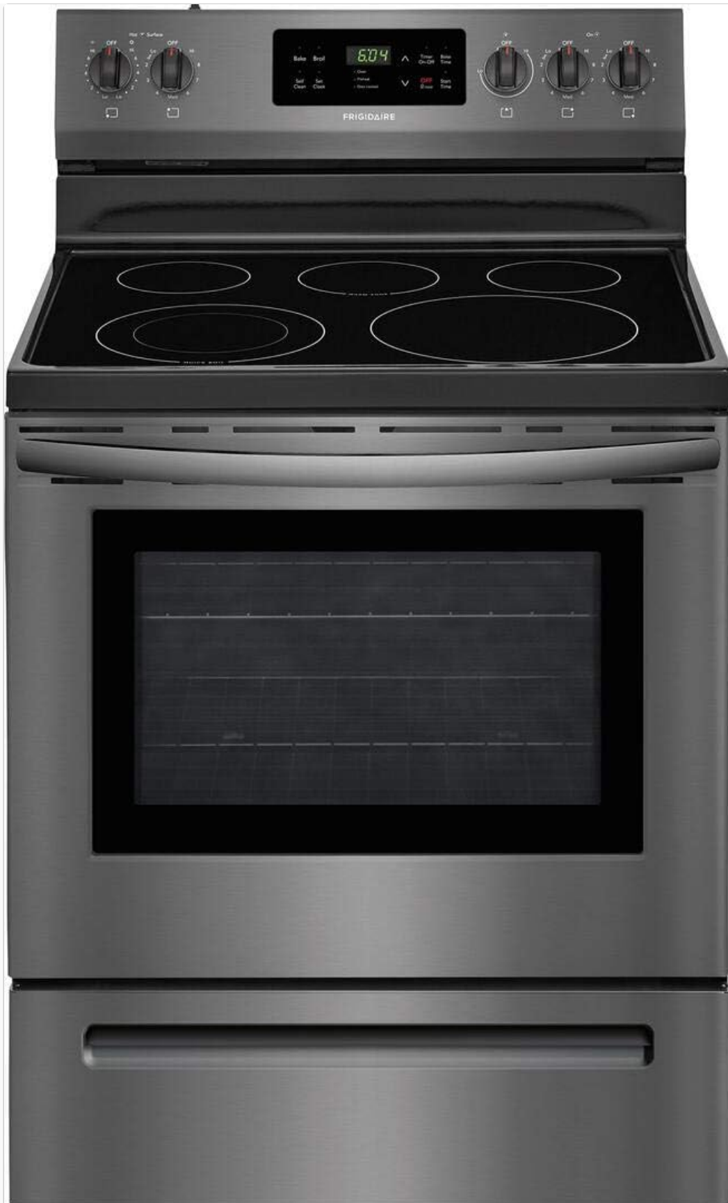
Image 1.1: Front view of the Frigidaire FFEF3054TD electric range.