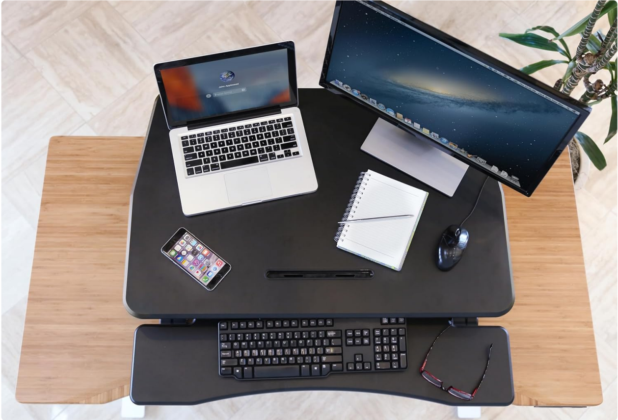
Image: Top-down view showcasing the spacious work surface accommodating a laptop, monitor, and other accessories.