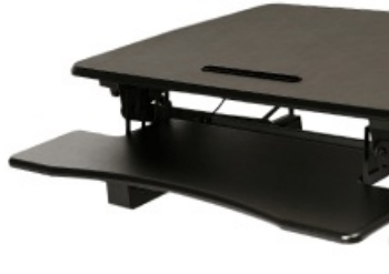
Image: Diagram illustrating the monitor riser, keyboard tray, and tablet holder features.