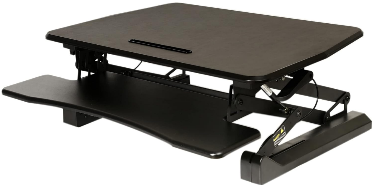
Image: Front view of the assembled workstation, ready for use.