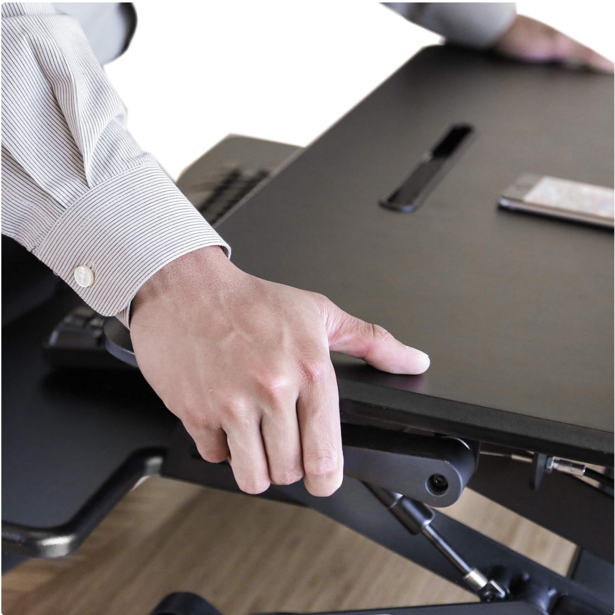
Image: Close-up of the height adjustment levers.

Your browser does not support the video tag.