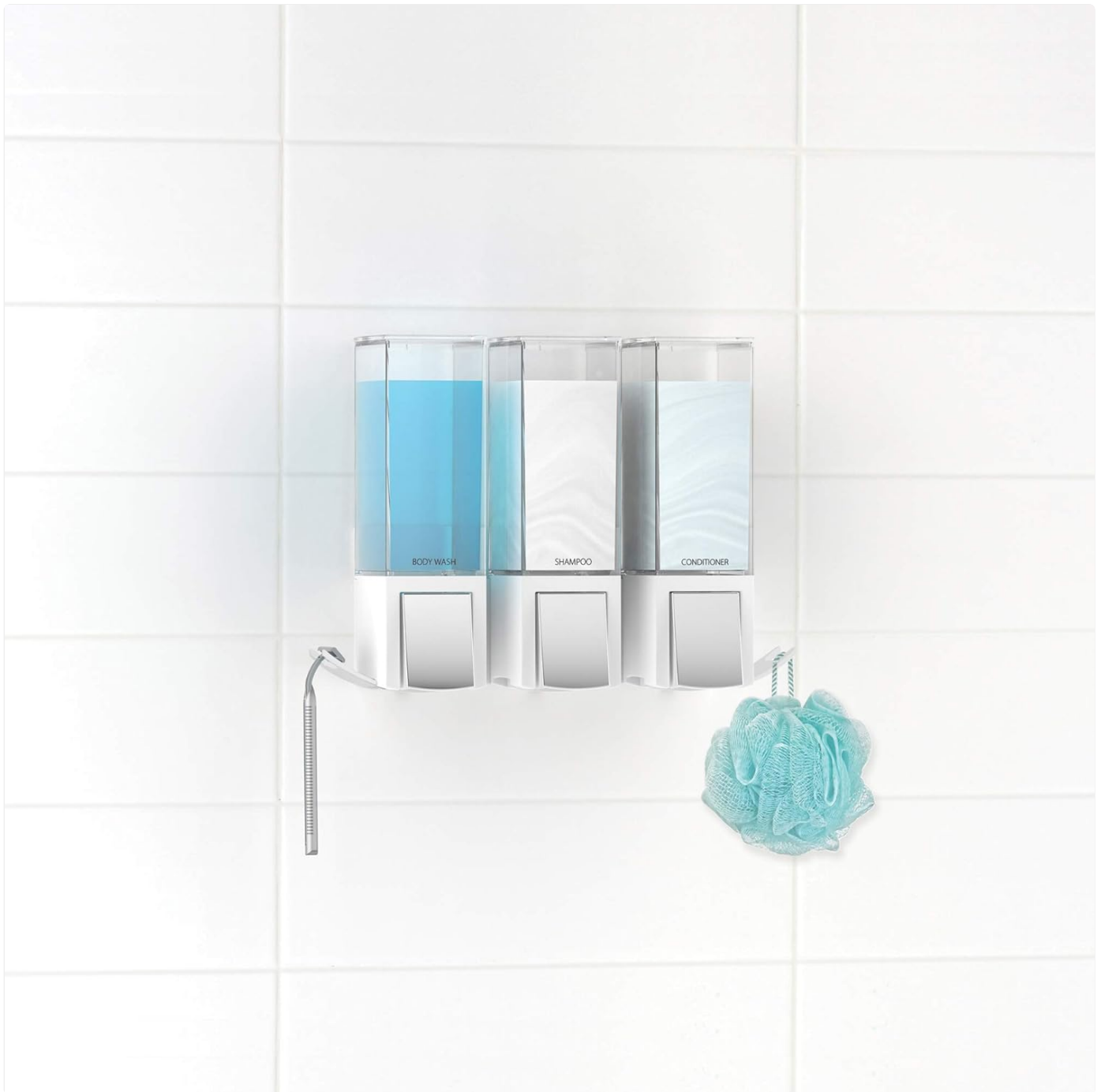
Image: The Clever Triple Shower Dispenser mounted on a white tiled shower wall, filled with blue body wash, white shampoo, and light blue conditioner. A blue loofah hangs from one of the accessory hooks.