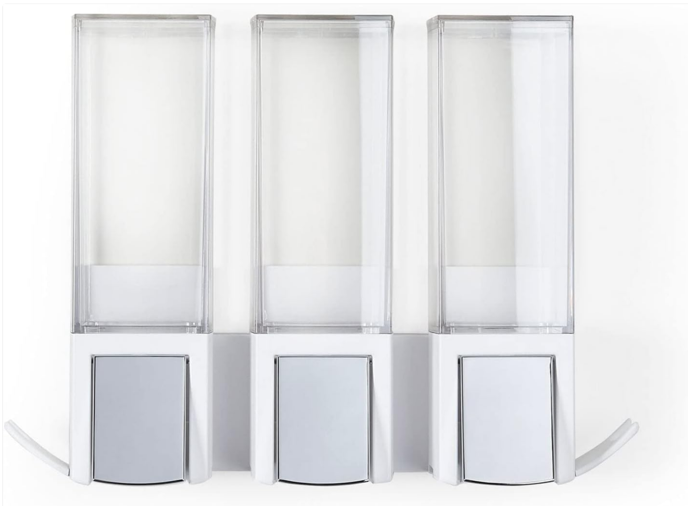
Image: Front view of the Better Living Clever Triple Shower Dispenser, showcasing its three clear chambers and white/chrome finish.