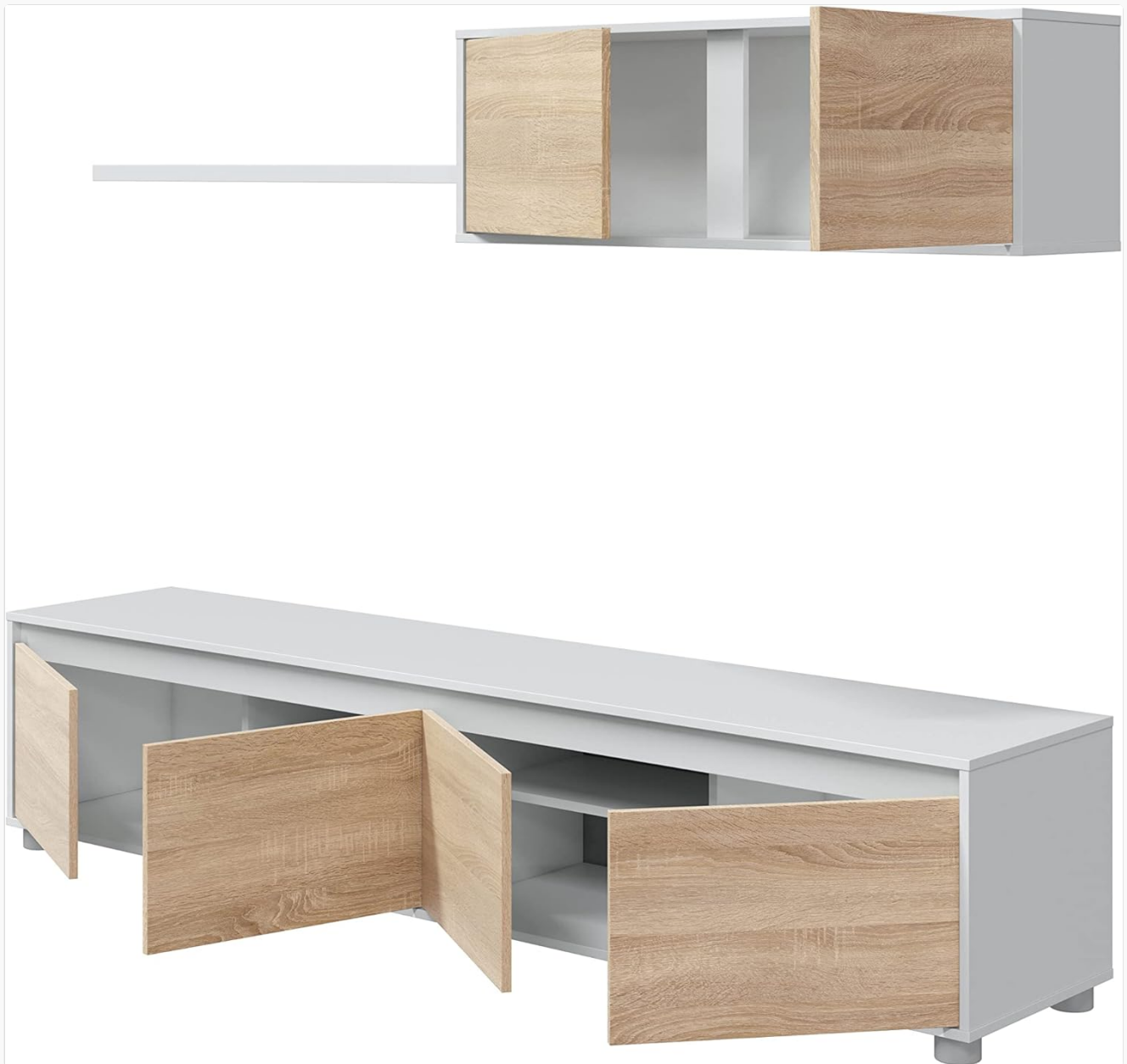
Figure 3.1: Interior view of the lower TV cabinet, showing multiple compartments for storage.