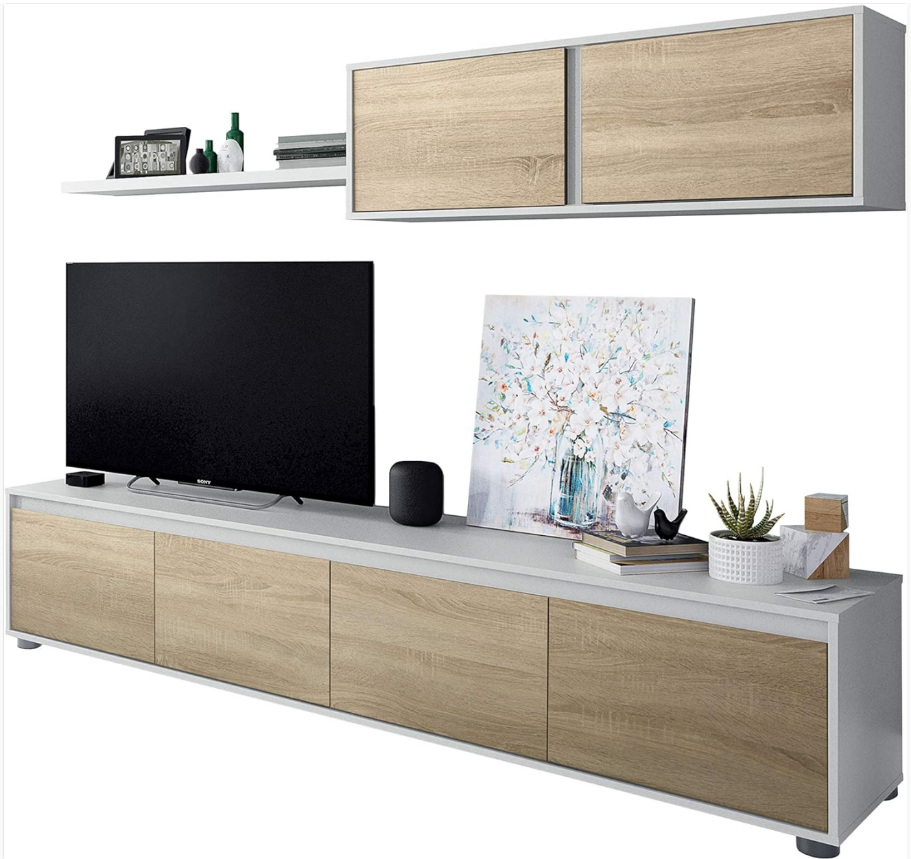
Figure 2.1: Fully assembled Habitdesign DISTRIMOBEL Saetabis Vanilla A10 Wall Unit, showcasing the lower TV cabinet and upper wall-mounted shelf with storage.