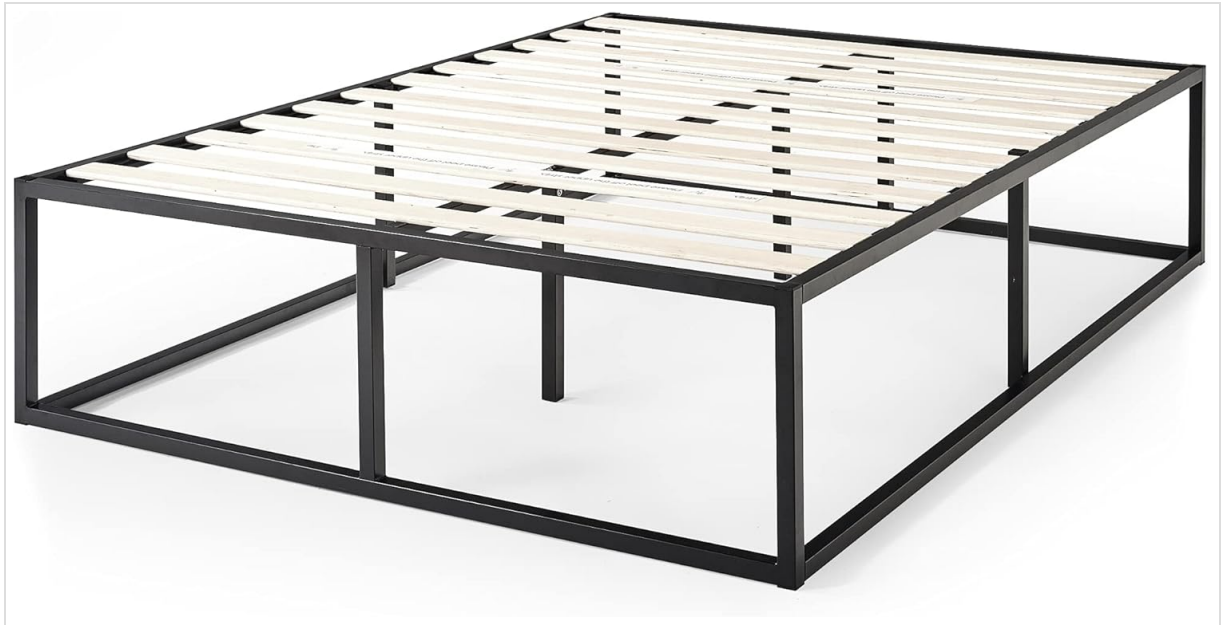
Figure 3: The bed frame with wooden slats in place, ready for a mattress.