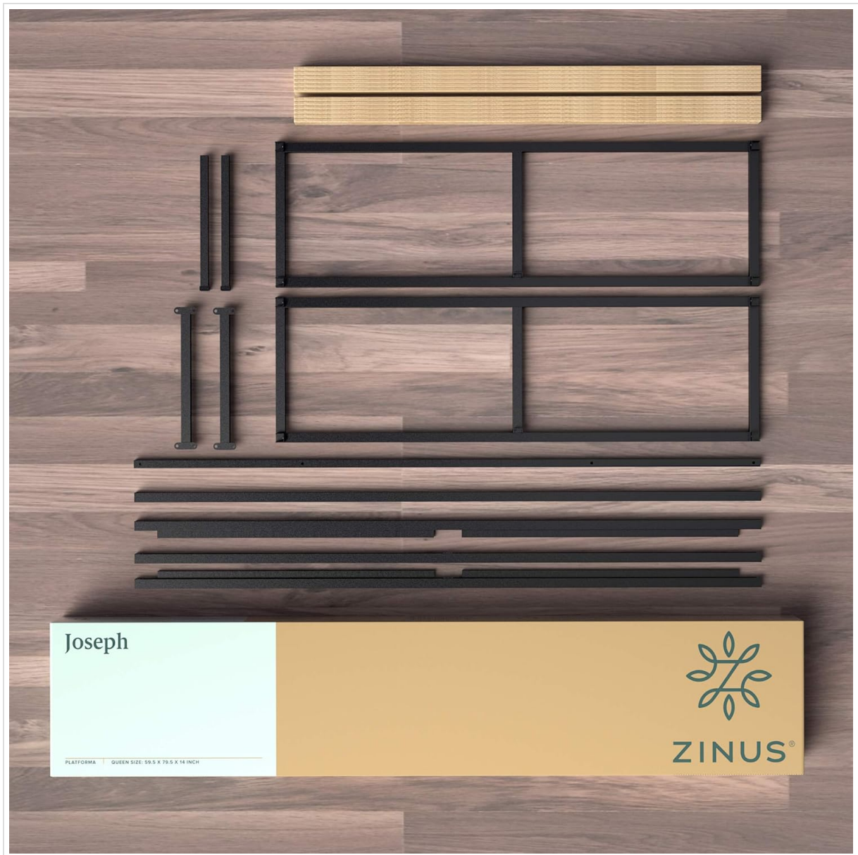
Figure 2: All components of the ZINUS Joseph bed frame prior to assembly.