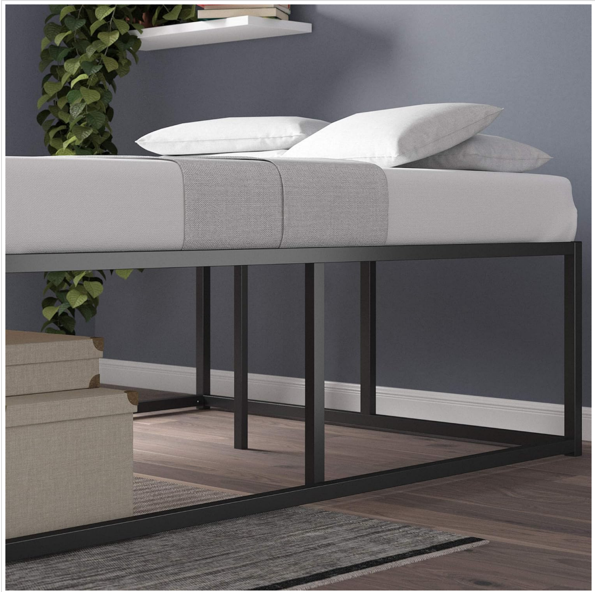
Figure 5: Side profile illustrating the 15.4-inch underbed clearance.