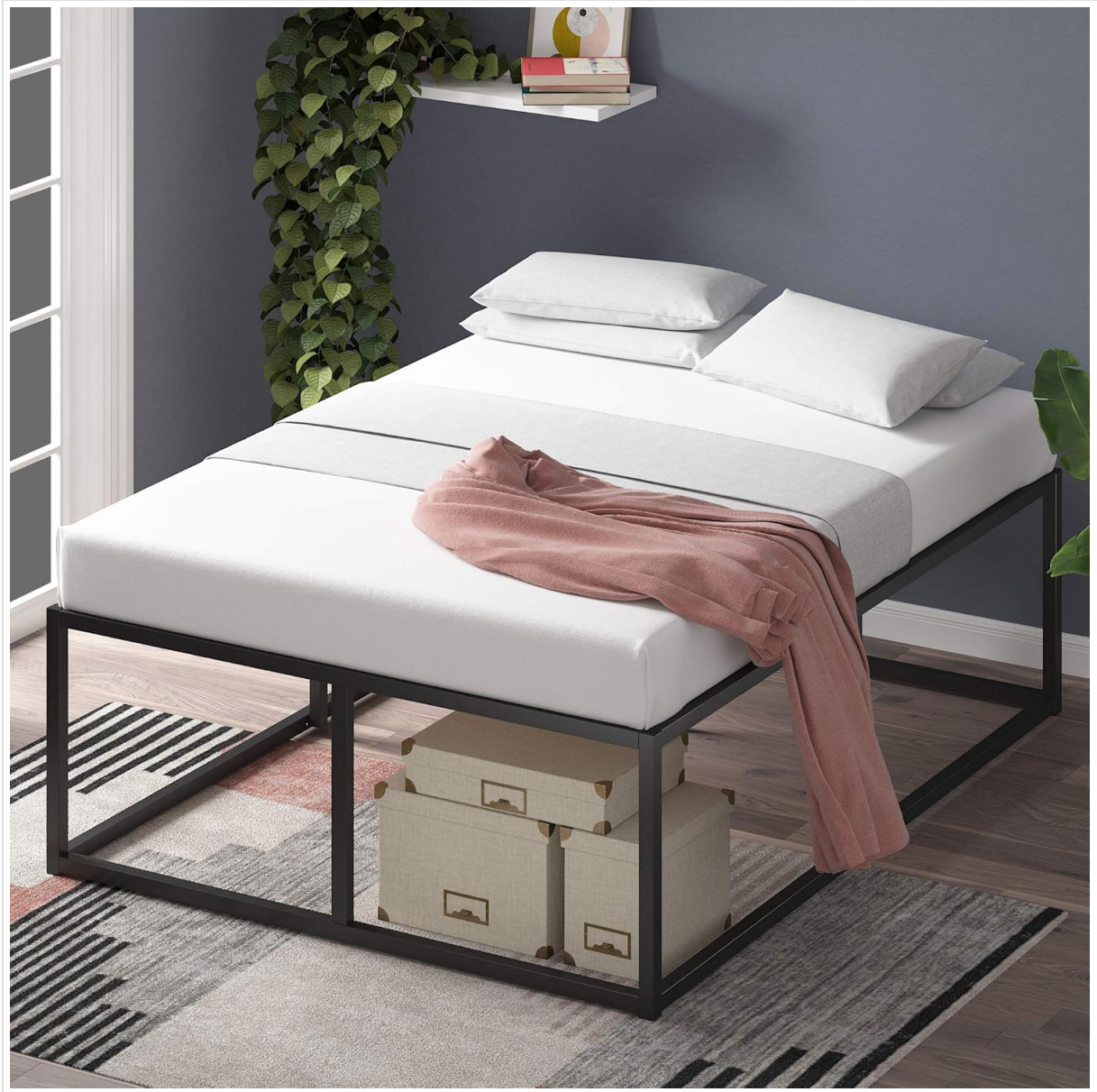
Figure 1: Assembled ZINUS Joseph 18-Inch King Metal Platform Bed Frame.