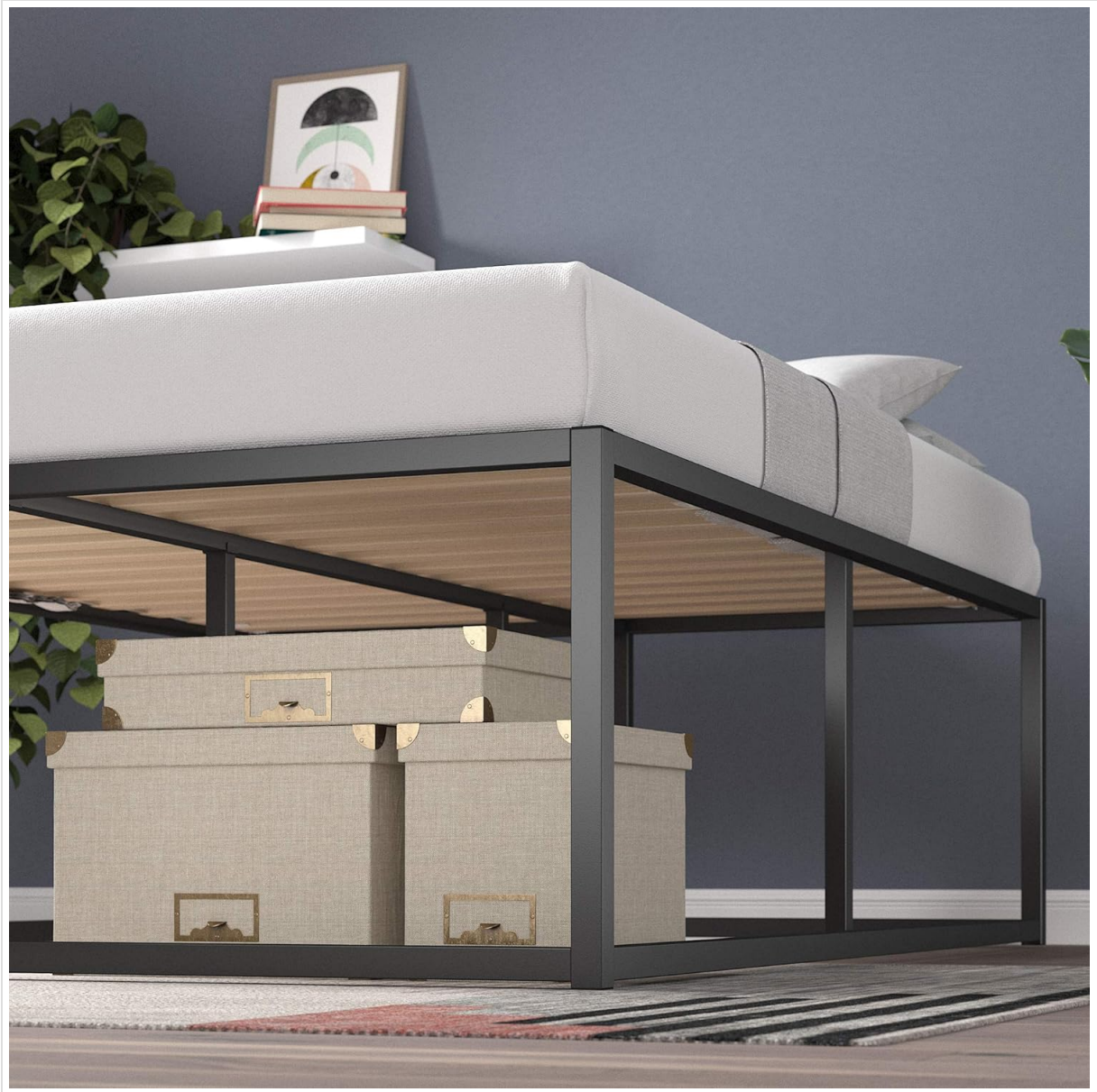
Figure 4: Example of underbed storage capacity.