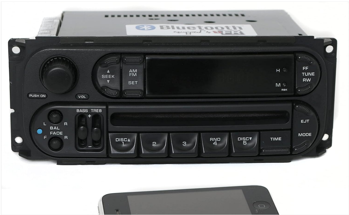
Figure 1: Front View. This image displays the front panel of the radio, showing the volume knob, push-button controls, display screen, CD slot, and the slider control for bass and treble.