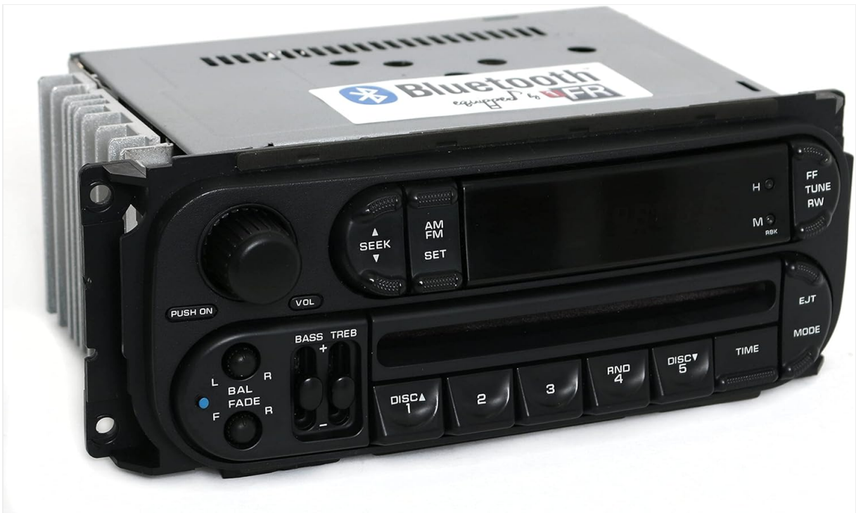
Figure 2: Angled Front View. An angled perspective of the radio's front, providing a clearer view of the button layout and the overall design.