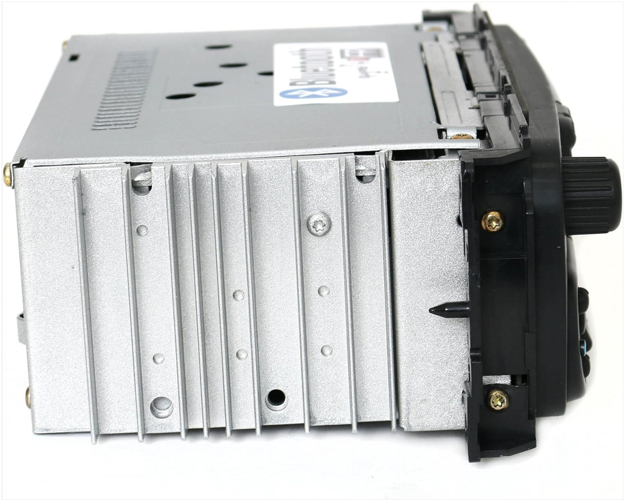
Figure 3: Side View. This image shows the side of the radio unit, highlighting the heat sinks designed for thermal management.