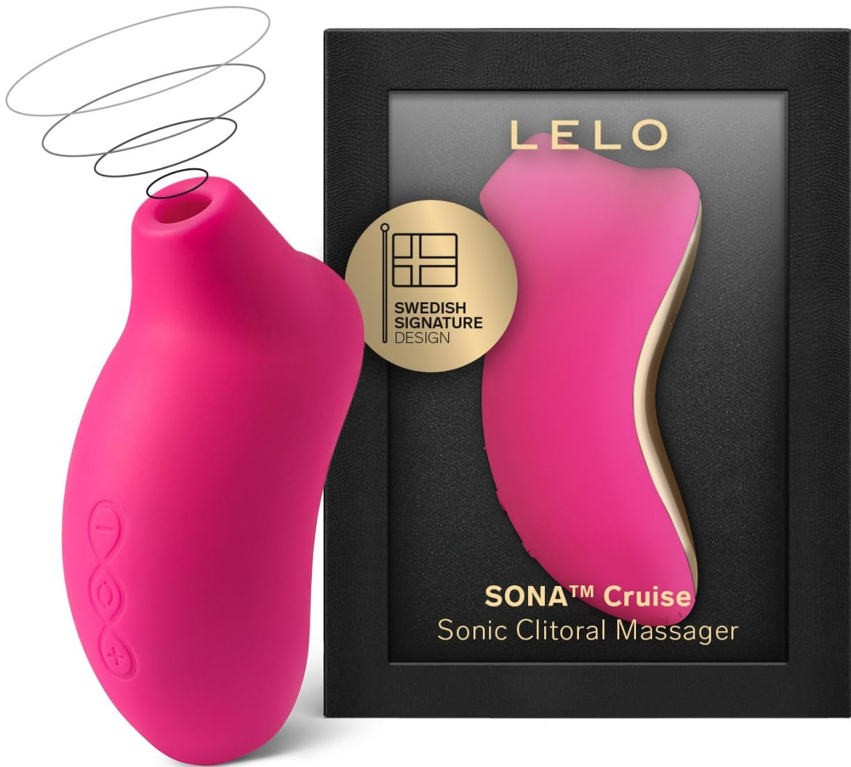
Image: The LELO SONA Cruise device in cerise, showcasing its sleek design and the accompanying product packaging.