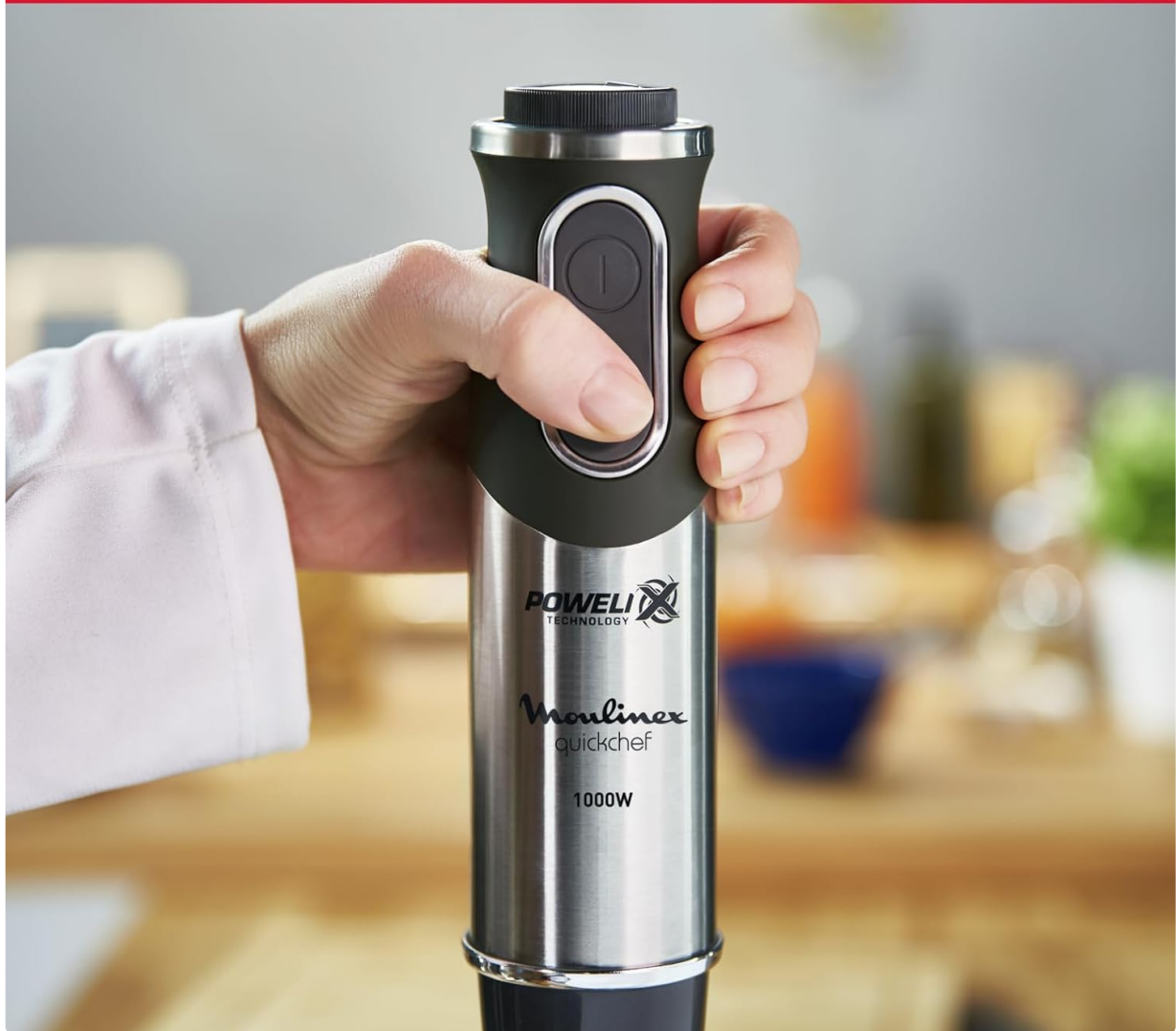
Image 3: Close-up of the hand blender's motor unit, highlighting the 10-speed control dial.