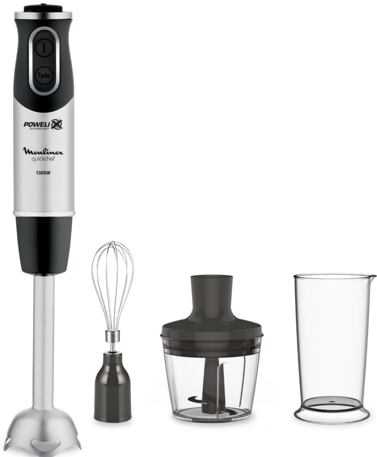
Image 1: The Moulinex DD6558 Quickchef 3in1 Immersion Blender with its included accessories.