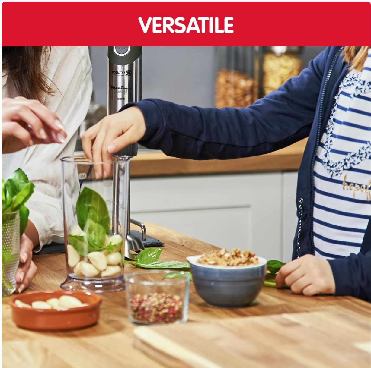
Image 2: The versatile Moulinex Quickchef Immersion Blender shown with ingredients for various preparations.