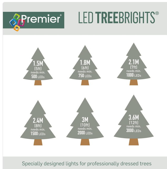
Image: A guide illustrating the minimum recommended LED count for different Christmas tree heights (e.g., 2.1m tree needs 1000 LEDs).

These lights are suitable for both indoor and outdoor Christmas trees or other decorative displays. The 25-meter length with 2.5cm bulb spacing is ideal for trees up to 2.1 meters (7 feet) for a dense, professional look. For larger trees, consider additional sets.