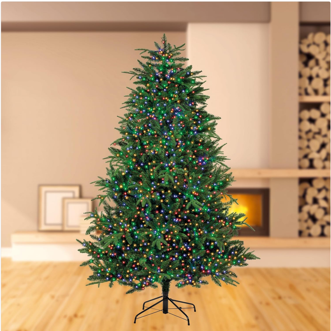
Image: A Christmas tree fully decorated with the 1000 multicolour LED cluster lights, showcasing their vibrant display.