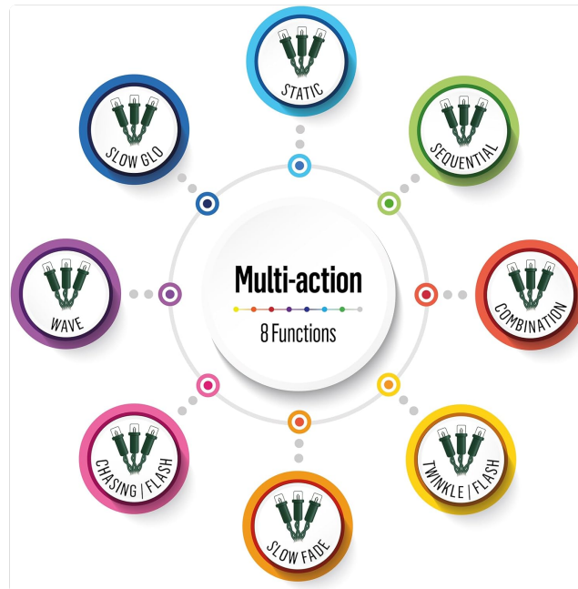
Image: A circular diagram illustrating the 8 distinct multi-action lighting functions available on the controller.