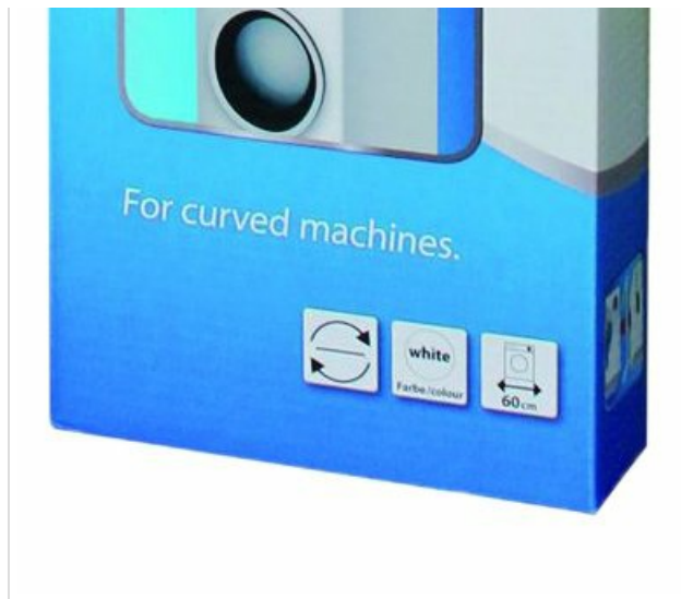
Image 1: The Scanpart 0150120108 Intermediate Frame. This white frame is designed to sit between a washing machine and a dryer, providing a stable platform for stacking.