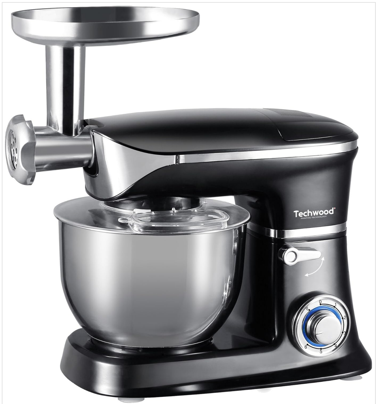
Image: The Techwood TRP-1366 Food Processor with the meat grinder attachment installed on the front port.