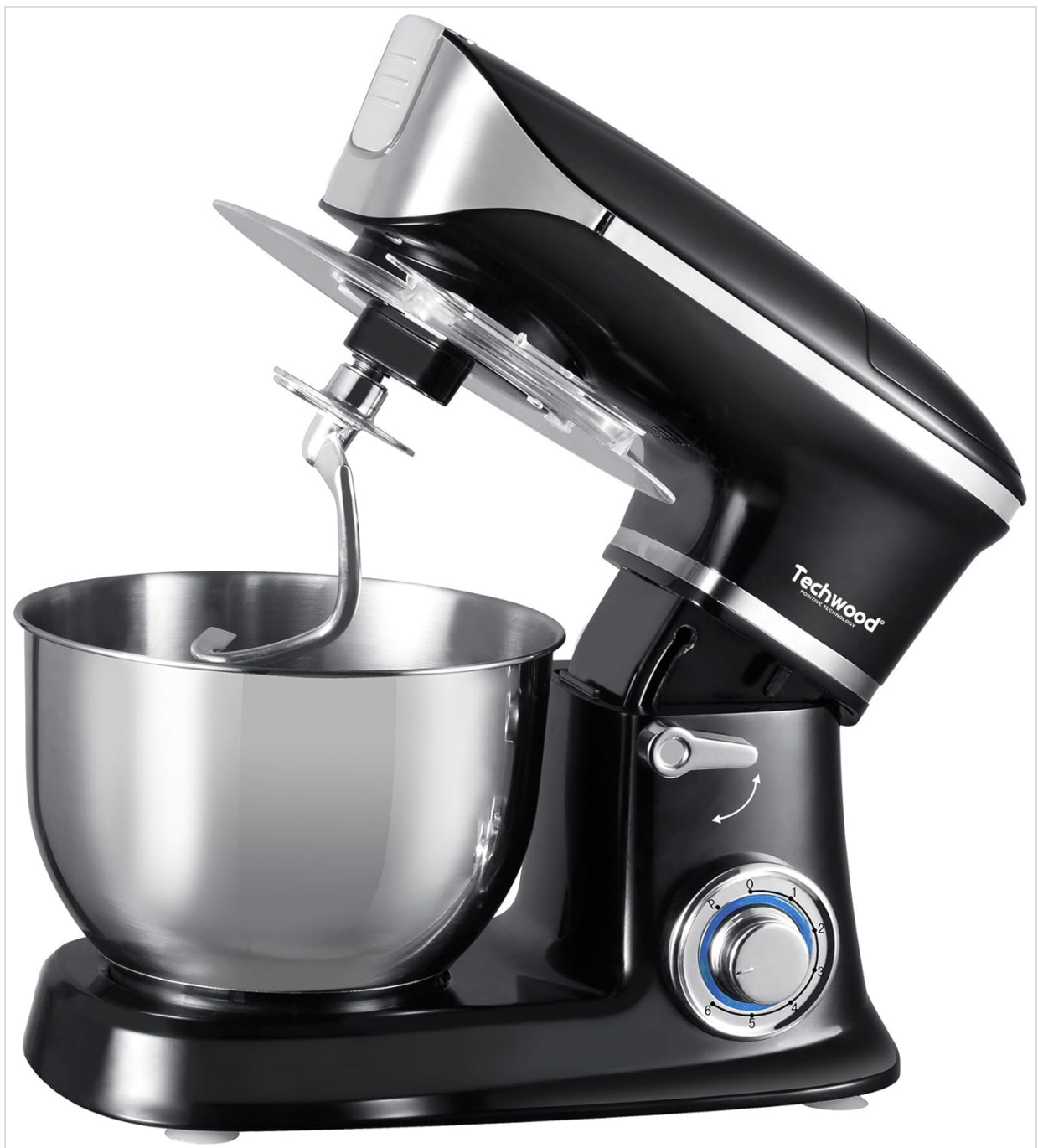
Image: The Techwood TRP-1366 Food Processor with its head tilted up, showing the whisk attachment and mixing bowl.