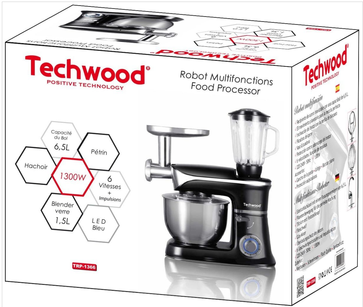
Image: The Techwood TRP-1366 Food Processor and its various attachments as seen in the product packaging.