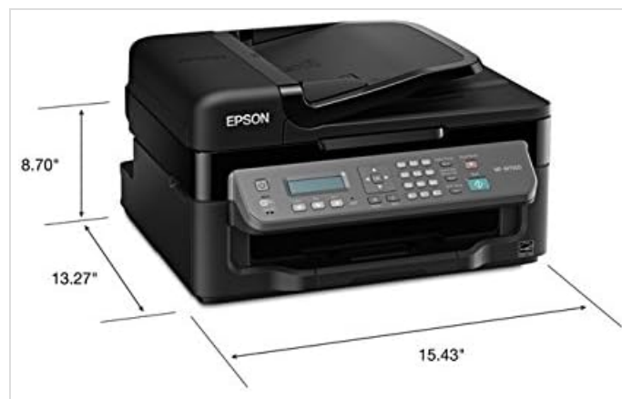
Figure 2: Dimensions of the Epson Workforce WF-M1560 printer (Height: 8.70", Depth: 13.27", Width: 15.43").