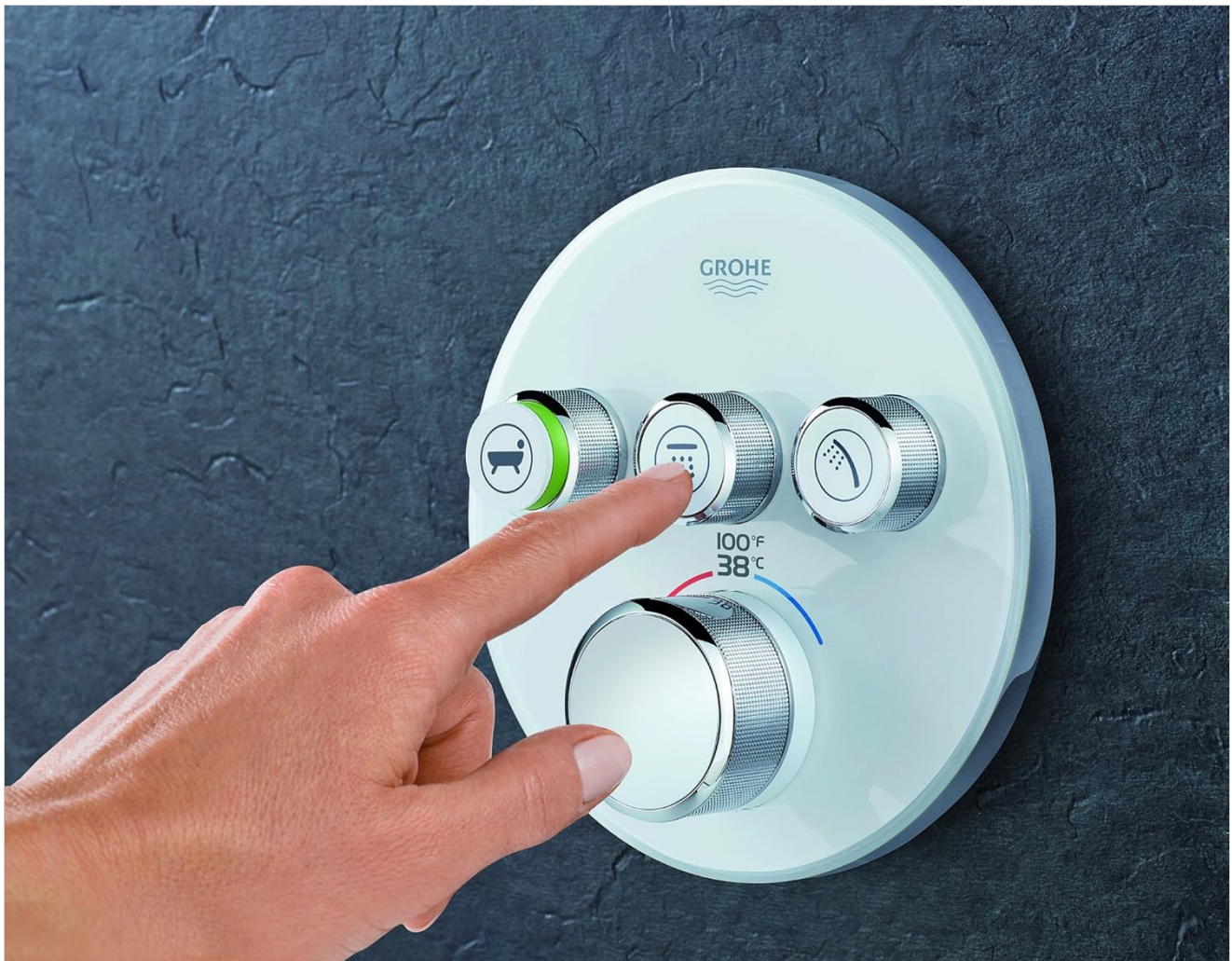
Figure 4: Activating a Function. A user's hand demonstrates pressing one of the SmartControl buttons to initiate water flow from a selected outlet.