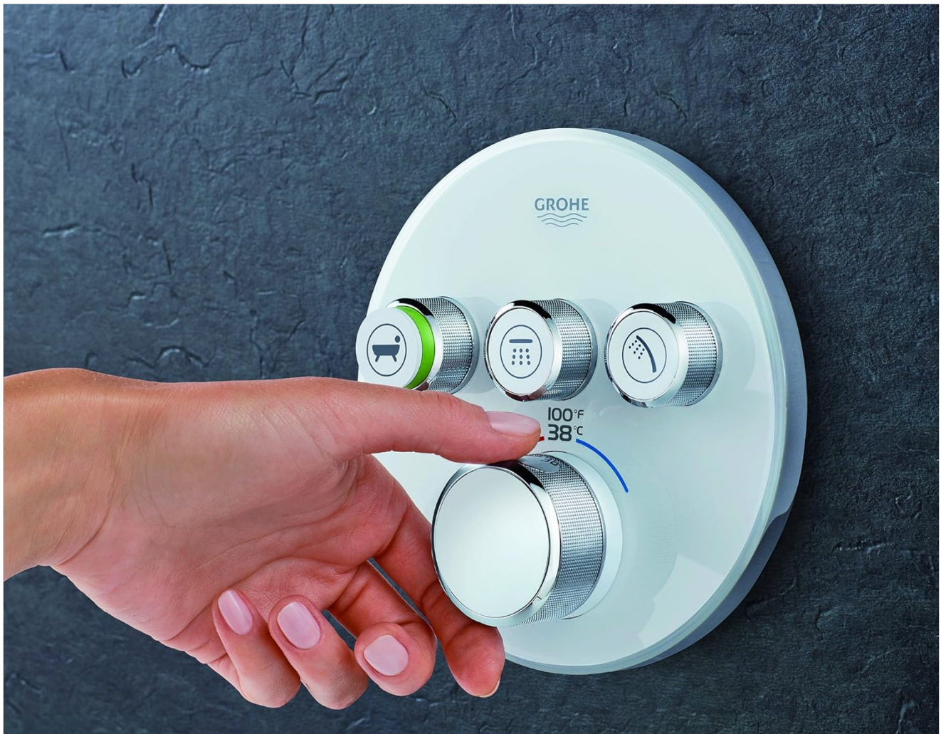
Figure 5: Adjusting Water Volume. This image shows a hand rotating a SmartControl button to precisely adjust the water flow from the chosen outlet.