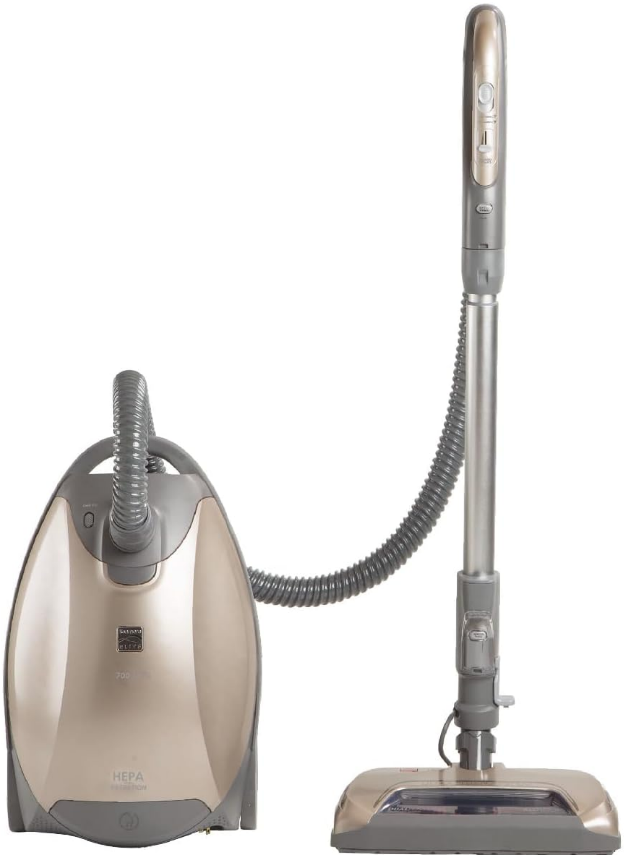
Figure 1: Kenmore Elite 81714 Canister Vacuum with main components.