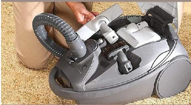
Elite Floor Brush