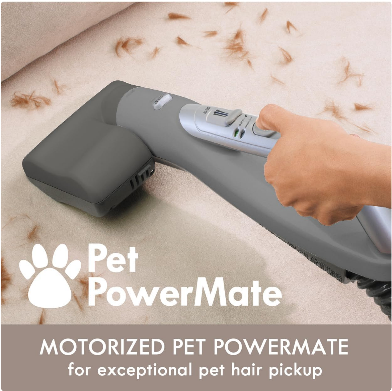
Figure 5: Motorized Pet PowerMate for exceptional pet hair pickup.