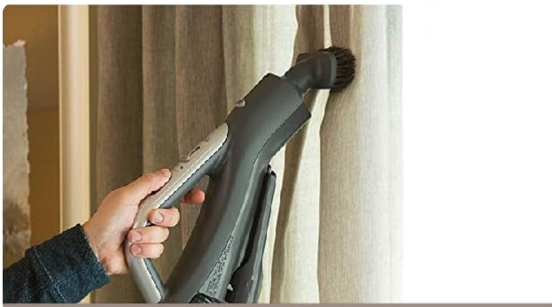
Elite Dusting Brush