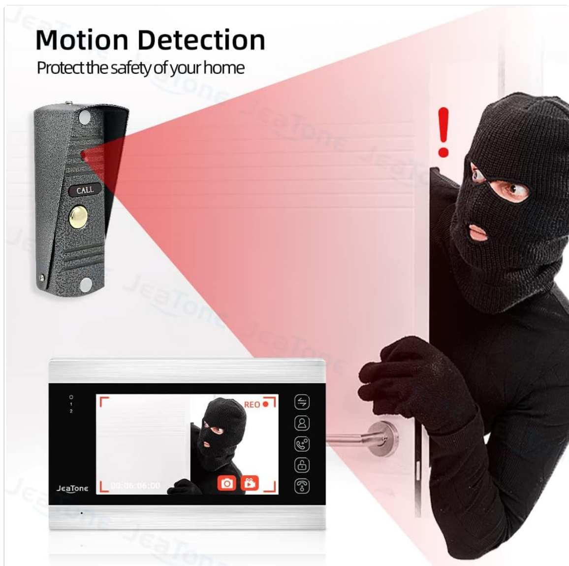
Image 6: Motion Detection. This image illustrates the motion detection feature, showing the outdoor call panel detecting movement and the indoor monitor displaying a recording of the event, indicating enhanced home security.