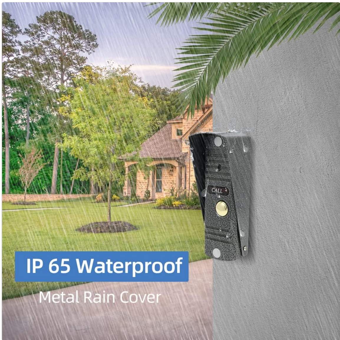
Image 4: IP65 Weatherproof with Metal Rain Cover. This image illustrates the outdoor call panel mounted on a wall, highlighting its IP65 weatherproof rating and the protective metal rain cover installed above it, ensuring durability against outdoor elements.