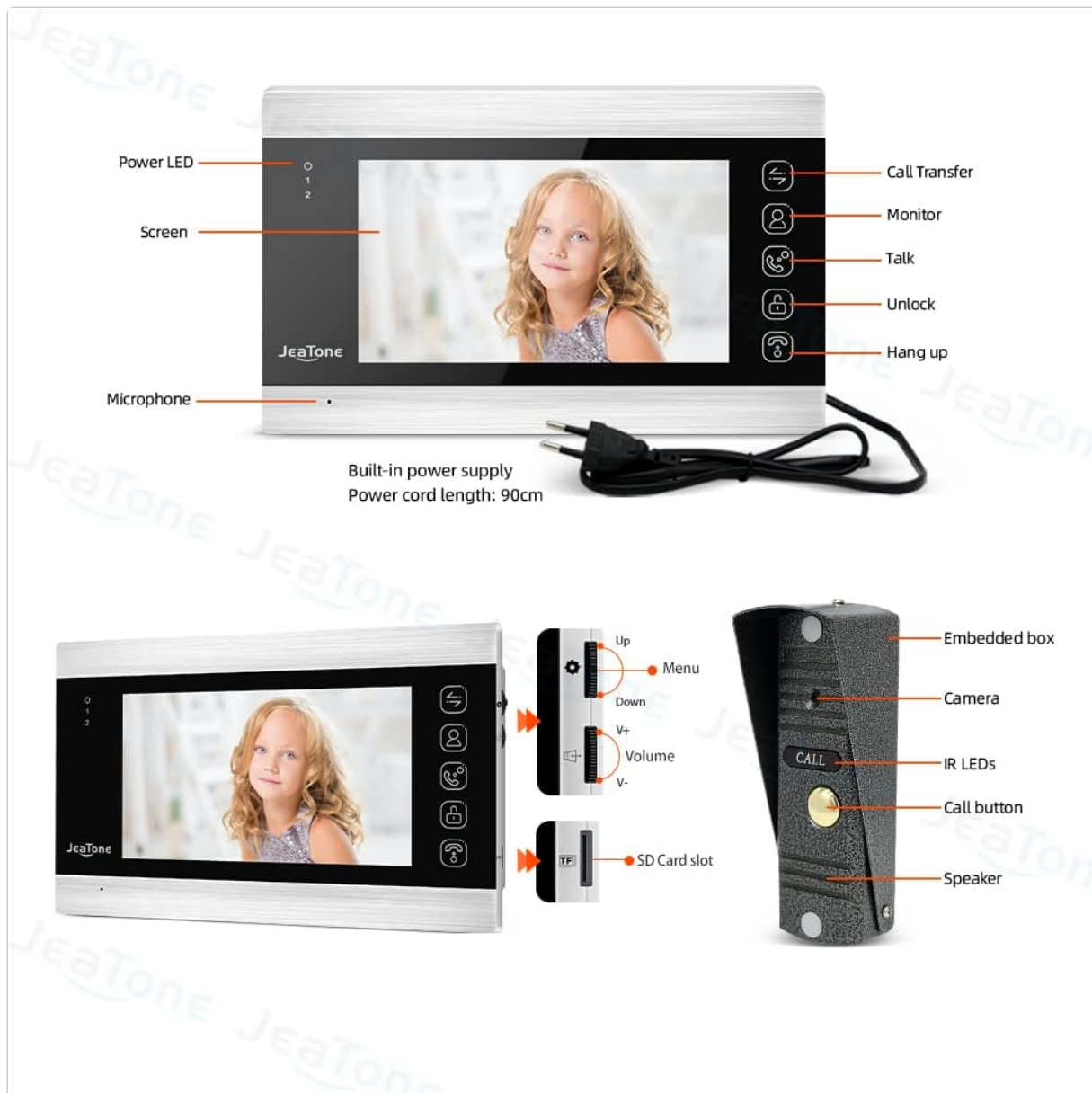
Image 3: Component Identification. This image provides a detailed view of the indoor monitor and outdoor call panel with their respective parts labeled. For the indoor monitor, labels include Power LED, Screen, Microphone, Call Transfer, Monitor, Talk, Unlock, Hang Up buttons, and a built-in power supply. For the outdoor call panel, labels include Embedded box, Camera, IR LEDs, Call button, and Speaker.

The JeaTone Video Doorbell Intercom System consists of an indoor monitor and an outdoor call panel, designed for secure and convenient communication with visitors.