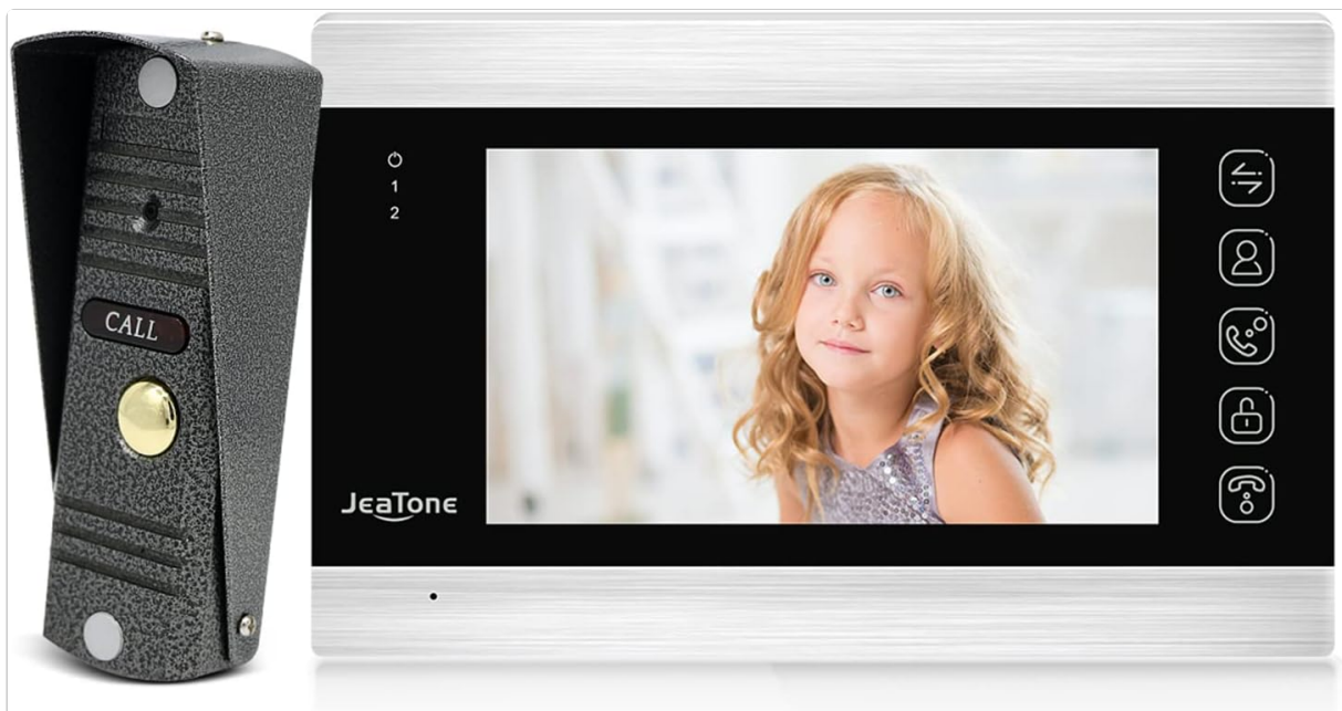
Image 1: JeaTone 7-inch Video Doorbell Intercom System. This image displays the indoor monitor on the right, featuring a large screen and control buttons, alongside the outdoor call panel on the left, which includes a call button and camera.

This user manual provides detailed instructions for the installation, operation, and maintenance of your JeaTone 7-inch Video Doorbell Intercom System. Please read this manual thoroughly before installation and use to ensure proper function and to prevent damage to the device. Keep this manual for future reference.