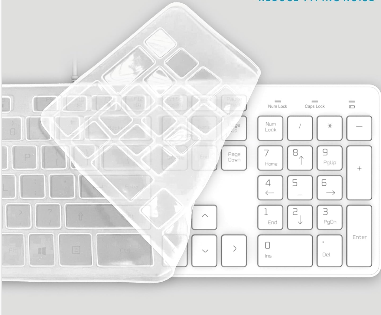
Image showing the transparent silicone keyboard cover placed over the B.FRIENDIT KB1430 keyboard, designed for spill protection and noise reduction.