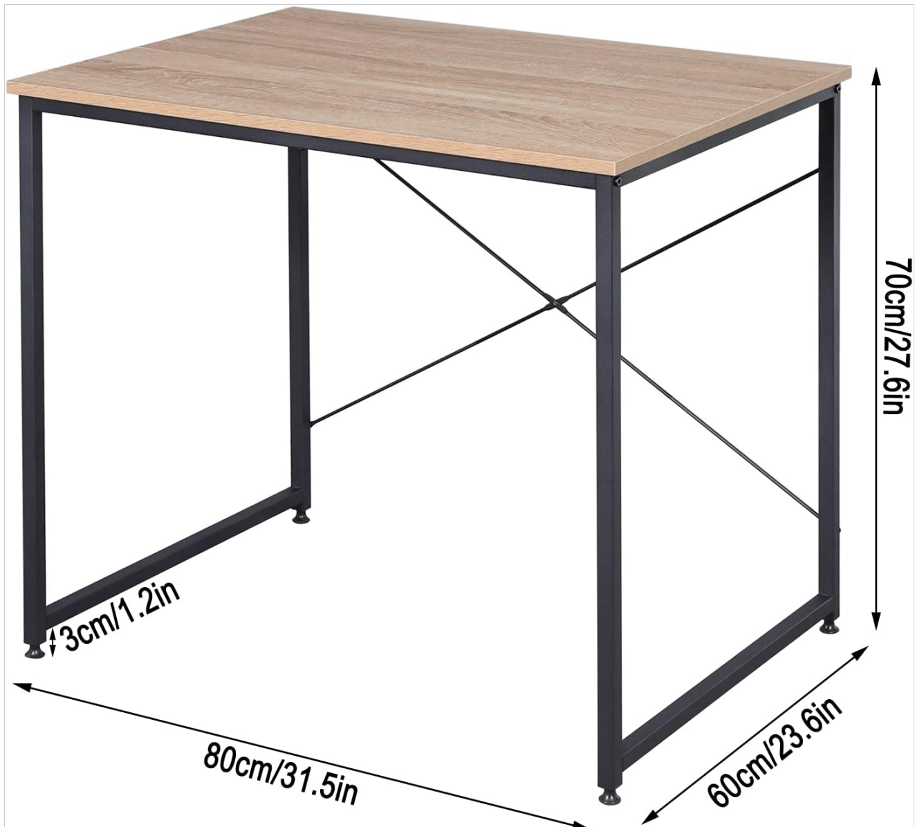
Figure 7: Desk dimensions.