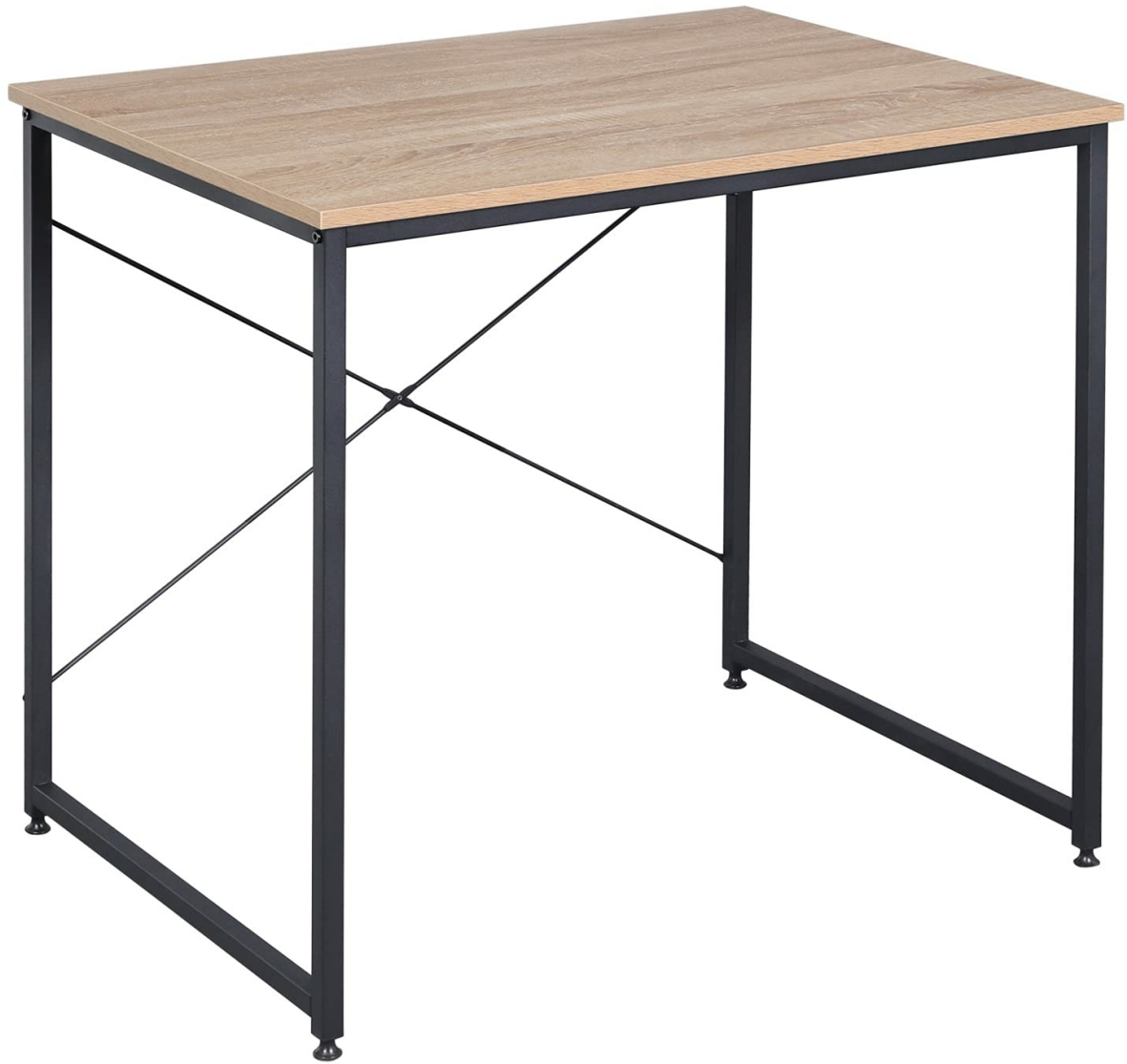
Figure 4: The assembled desk.