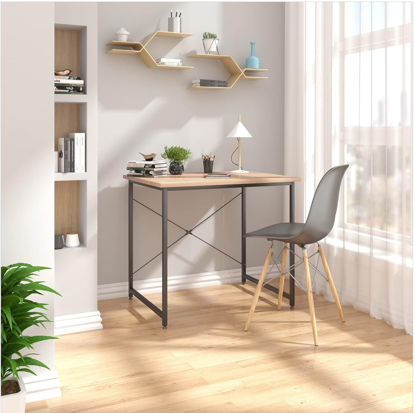
Figure 5: Desk in use as a home office workstation.