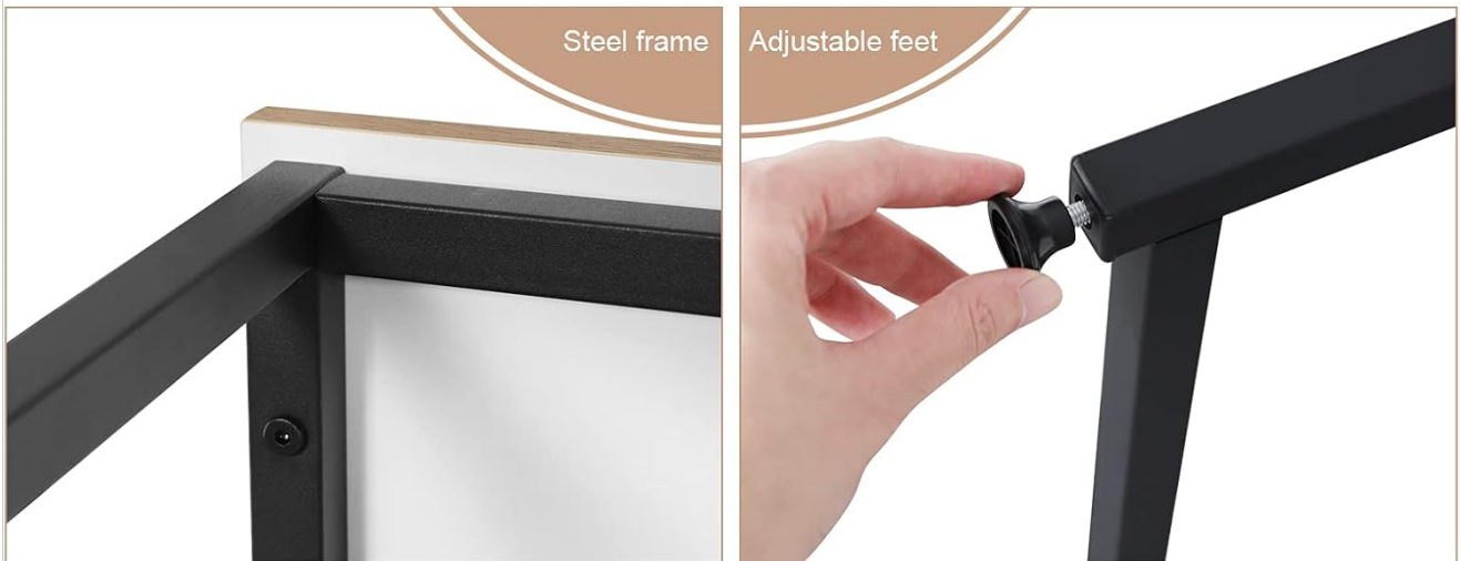
Figure 1: Key structural components including crossed steel bars and adjustable feet.