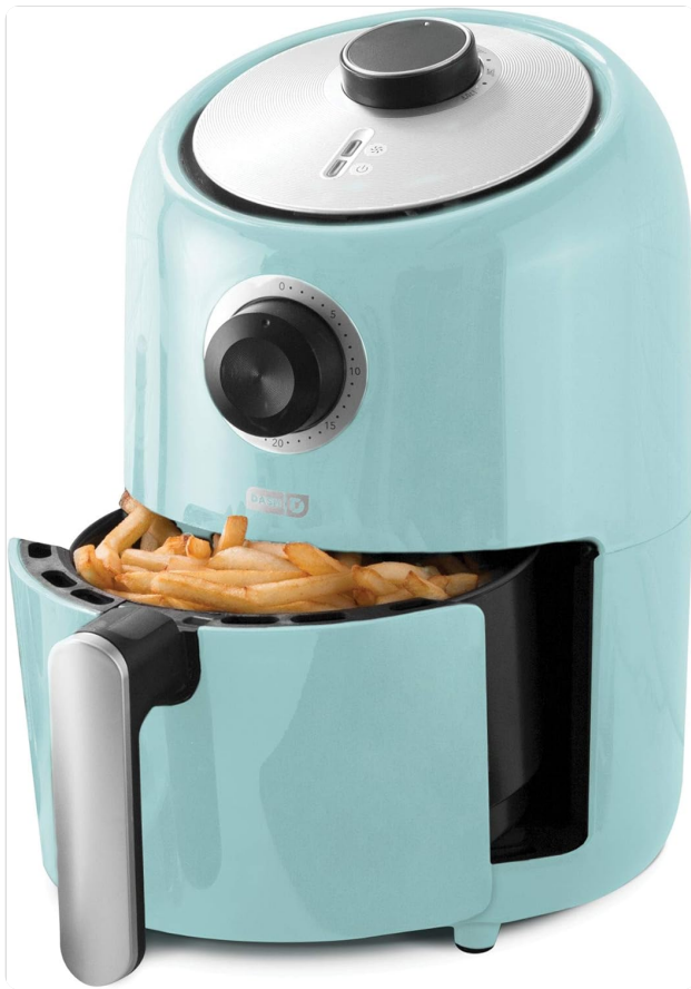
The DASH Compact Air Fryer in Aqua, shown with its removable fry basket filled with crispy fries.