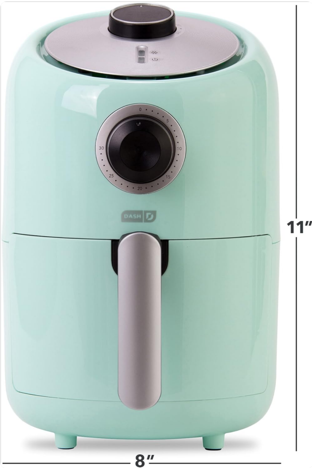
The compact dimensions of the Air Fryer, approximately 11 inches in height and 8 inches in width.