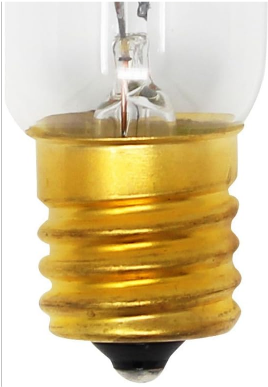
Figure 2: Side profile of the light bulb, highlighting its tubular shape and filament structure.