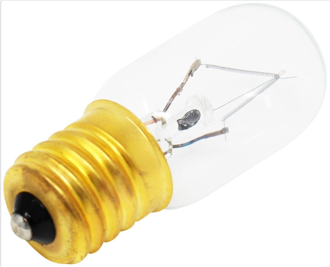
Figure 1: Front view of the UpStart Components Replacement Light Bulb. This image shows the clear glass bulb and the brass E17 screw base.