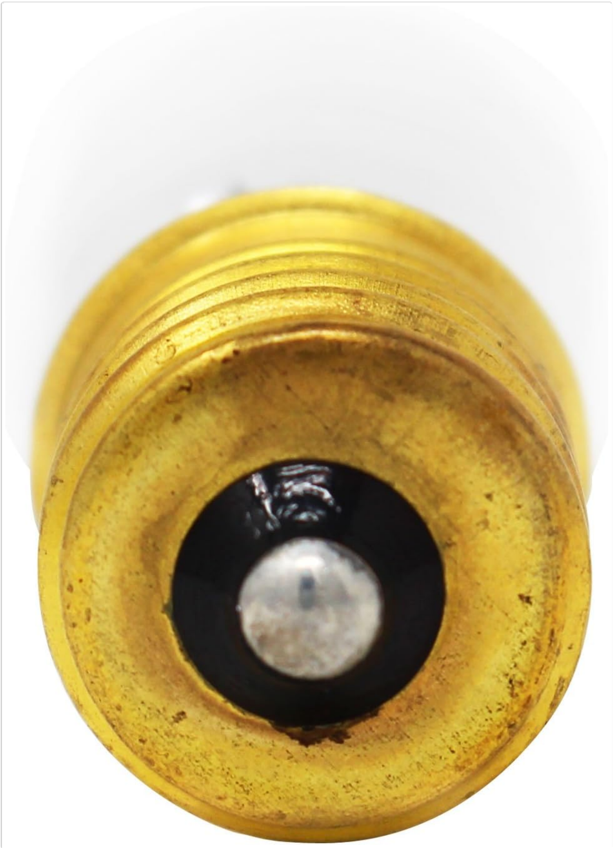
Figure 3: Detailed view of the E17 screw base, showing the contact point and threading for secure installation.