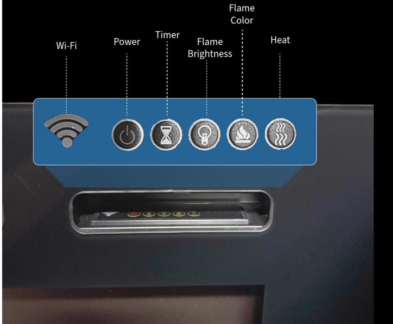
Image: Control panel with labeled functions.

The control panel located on the unit provides direct access to essential functions, mirroring many of the remote control features.