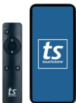
Image: Front view of the fireplace with remote and app for control.