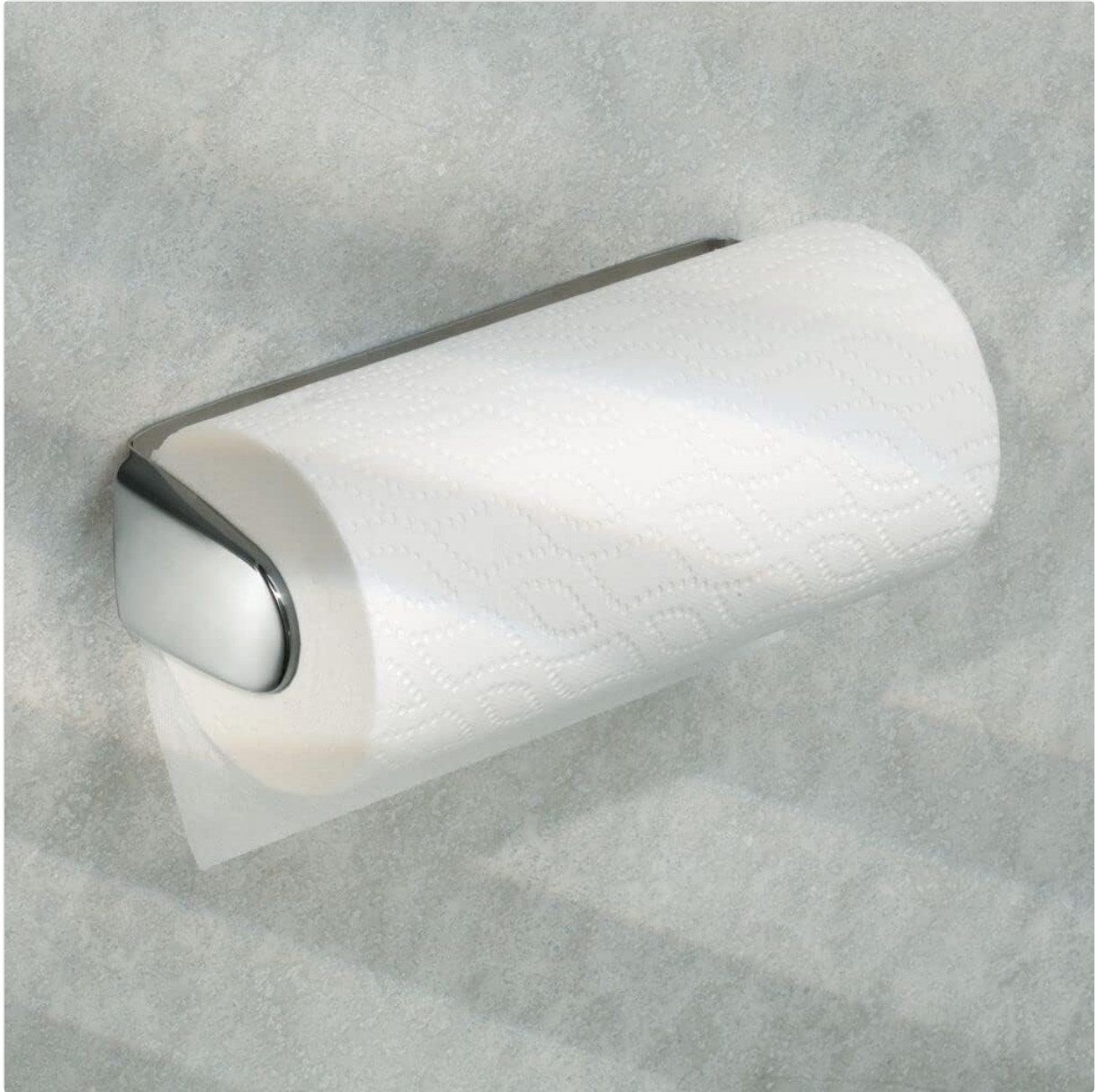
Image: The paper towel holder installed horizontally on a wall, holding a standard paper towel roll.