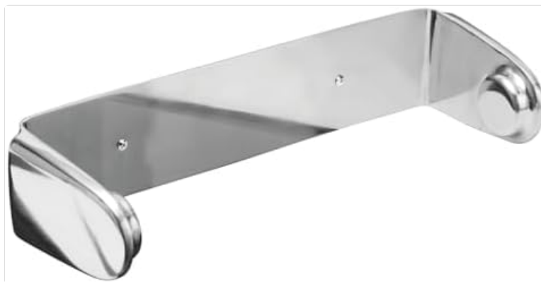
Image: The mDesign Metal Wall Mounted Paper Towel Holder, featuring a polished stainless steel finish.

This product is designed to store and dispense standard and jumbo paper towel rolls, offering a space-saving solution for your kitchen, pantry, or utility areas.