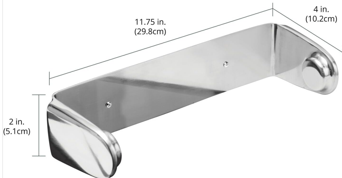
Image: Dimensional diagram of the mDesign paper towel holder.