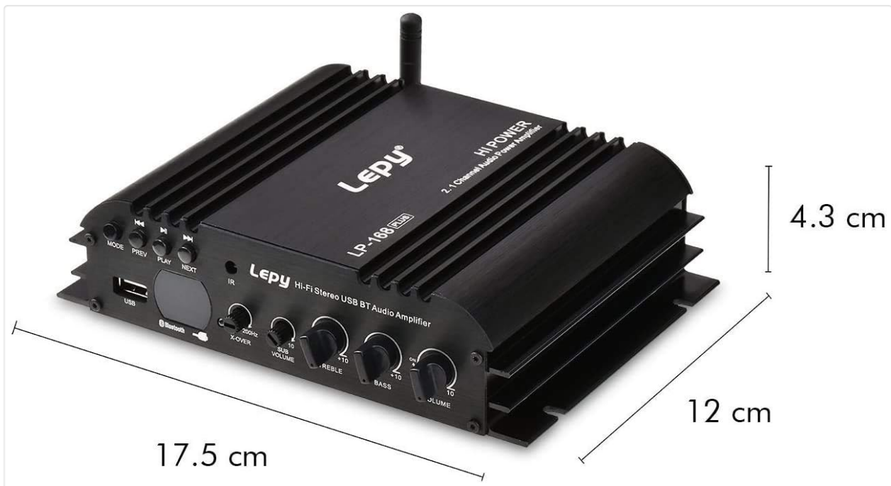
Image: Dimensions of the LP-168 Plus amplifier.