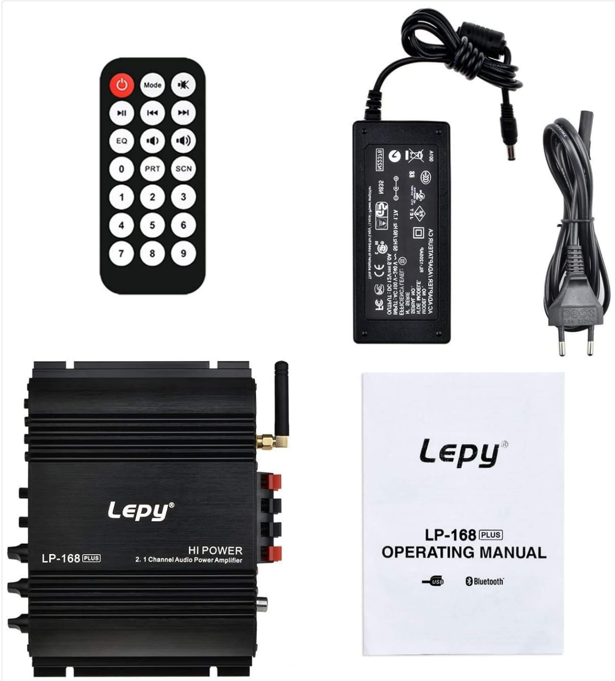
Image: Contents of the WINGONEER LP-168 Plus package, showing the amplifier, remote, power supply, and manual.