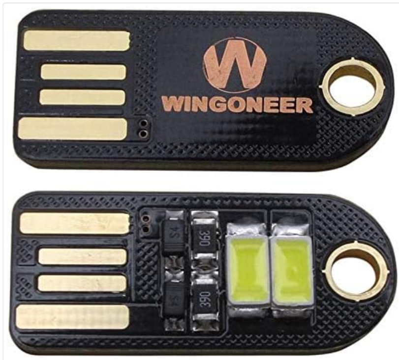
Image: The included WINGONEER USB LED Light.