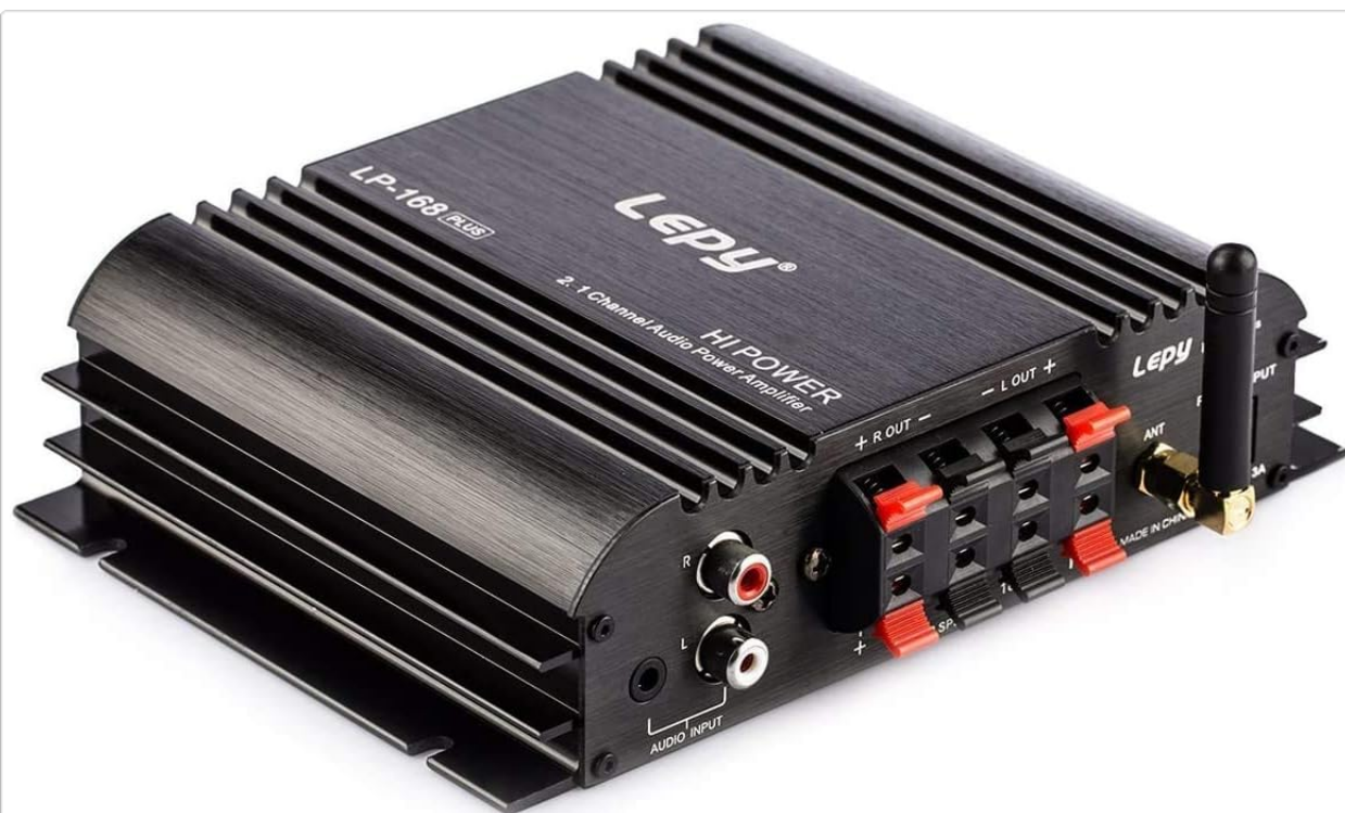
Image: Rear panel connections of the LP-168 Plus amplifier.