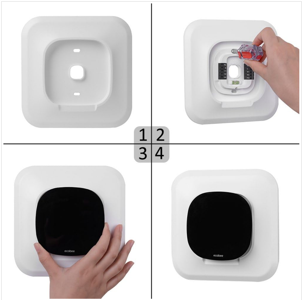
Image: A four-panel image illustrating the installation process: 1. The wall plate is placed on the wall. 2. A hand inserts wiring into the thermostat base. 3. The Ecobee3 lite thermostat is attached to the wall plate. 4. The final mounted thermostat and wall plate.