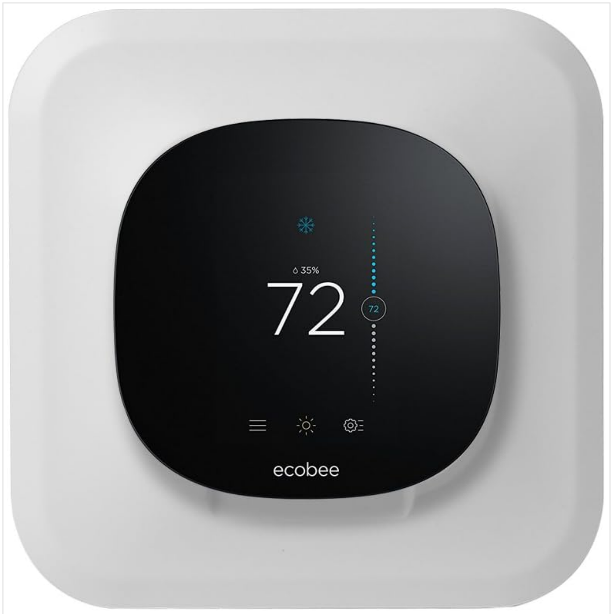
Image: A close-up view of the Ecobee3 lite Smart Wi-Fi Thermostat securely mounted on the white HOLACA Wall Plate Bracket Cover, showcasing a clean and integrated appearance.