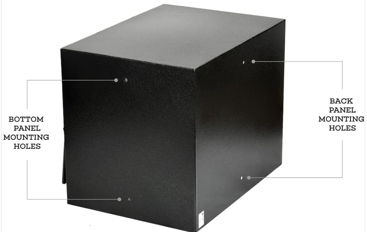
Image: A visual representation highlighting the pre-drilled mounting holes on both the bottom and back panels of the safe, indicating options for securing it to a surface.