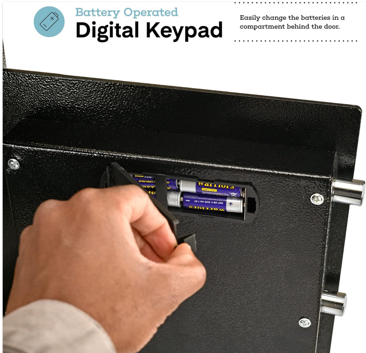
Image: A hand demonstrating the installation of AA batteries into the designated compartment located on the interior of the safe door, which powers the digital keypad.

The electronic keypad requires four (4) AA batteries for operation. The battery compartment is located behind the door of the safe. Open the safe using the override key (if it's the first time opening or if batteries are dead), locate the battery cover, and insert the batteries according to the polarity markings. Close the battery cover securely.