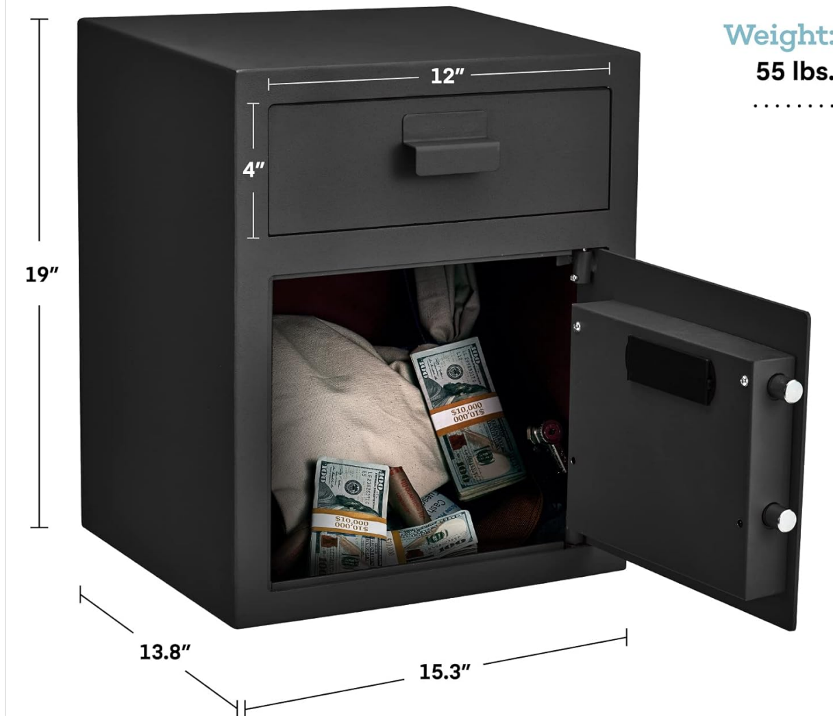
Image: A diagram illustrating the external and internal dimensions of the safe, including height, width, and depth measurements.