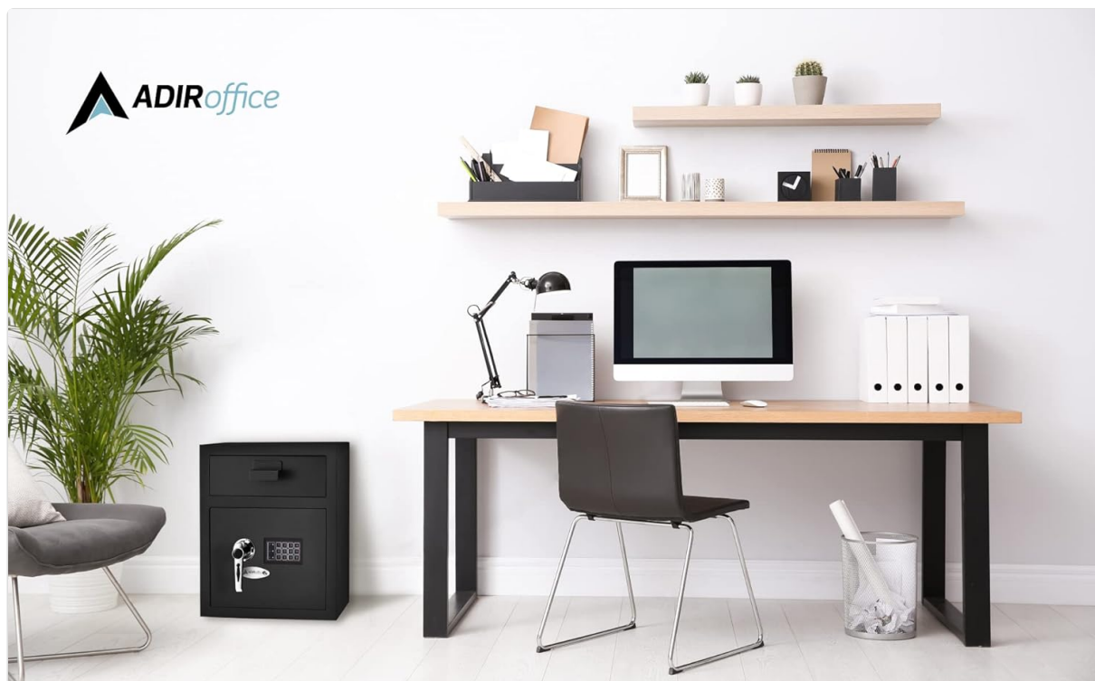
Image: The AdirOffice Digital Depository Safe positioned in an office environment, demonstrating its compact size and discreet appearance.

The AdirOffice Digital Depository Safe is designed to provide secure storage for valuables, cash, and important documents. Constructed from rugged steel, it offers robust protection against unauthorized access. This safe features both an electronic keypad lock and a manual key override, along with a convenient front-loading drop slot for quick deposits without opening the main compartment. Its design is suitable for both home and business environments.