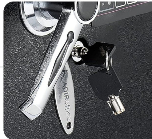
Image: A close-up demonstrating the use of the manual access key, highlighting the concealed keyhole for emergency entry.