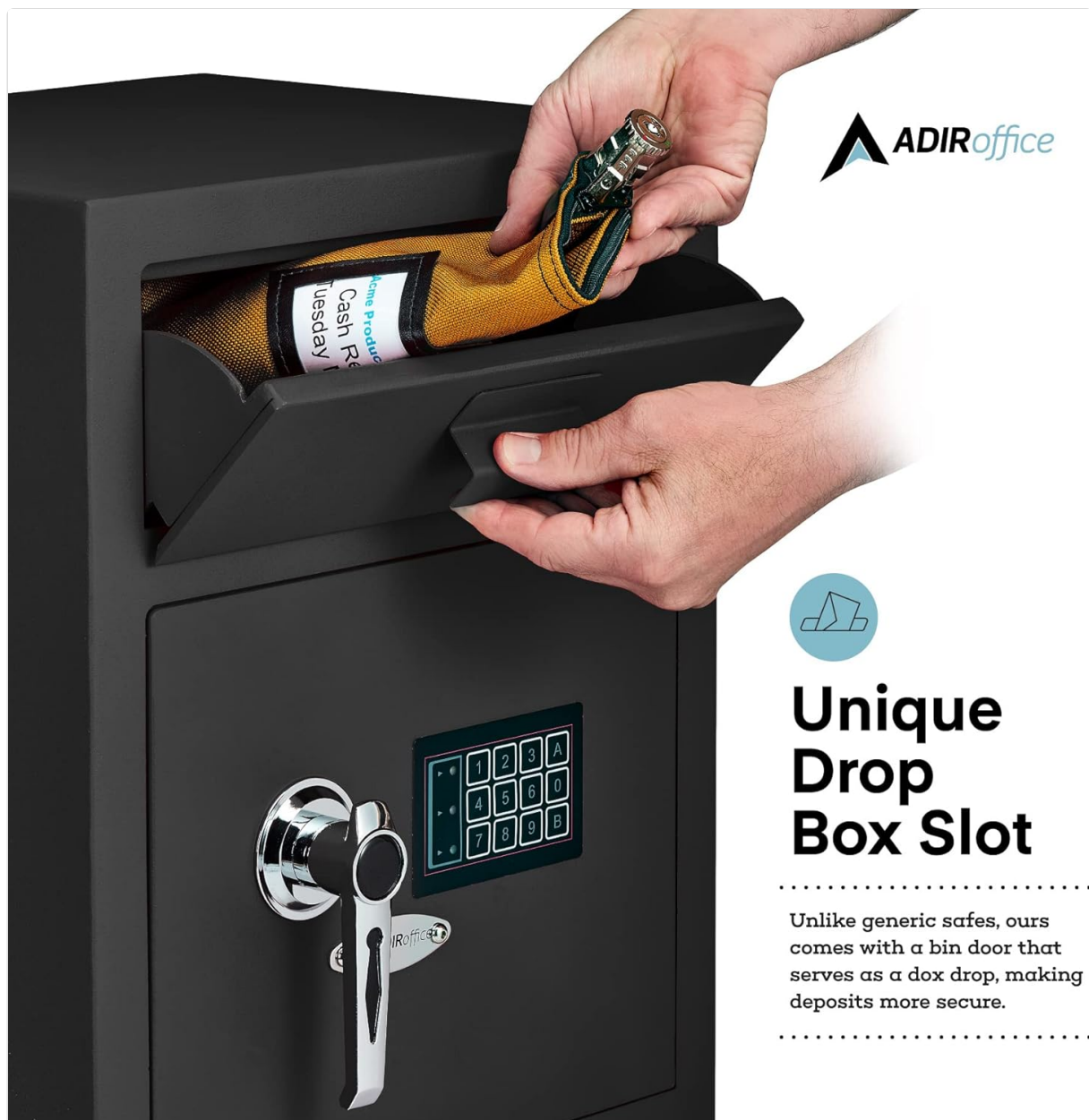
Image: A hand inserting an envelope into the secure drop box slot, demonstrating the convenient feature for quick and secure deposits.