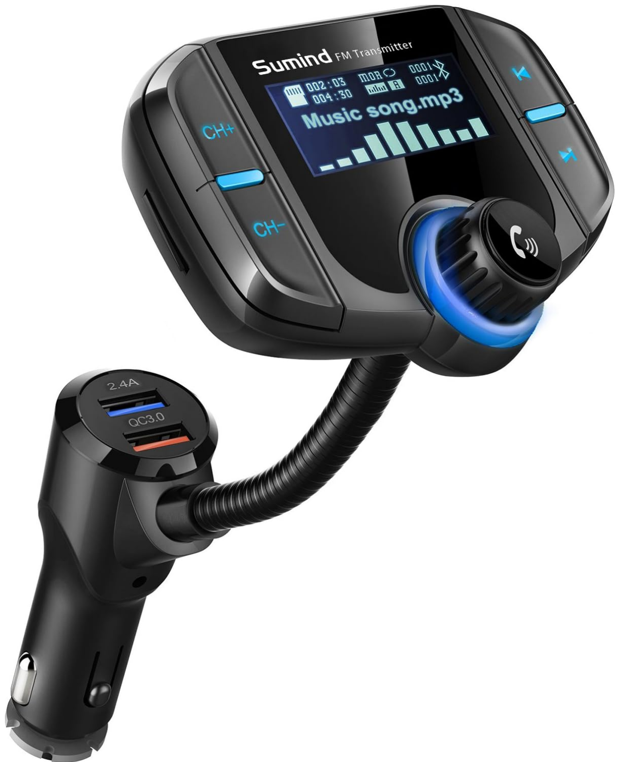
Figure 1: Sumind Bluetooth FM Transmitter (Model BT70B)