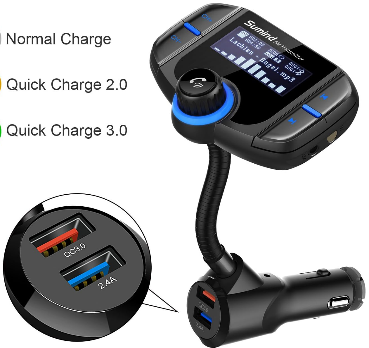
Figure 4: Dual USB Charging Ports