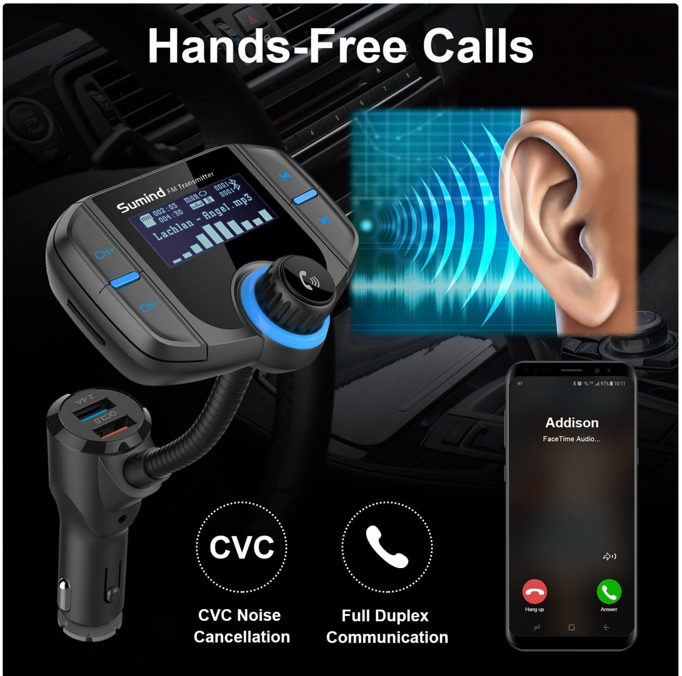
Figure 3: Hands-Free Calling Feature