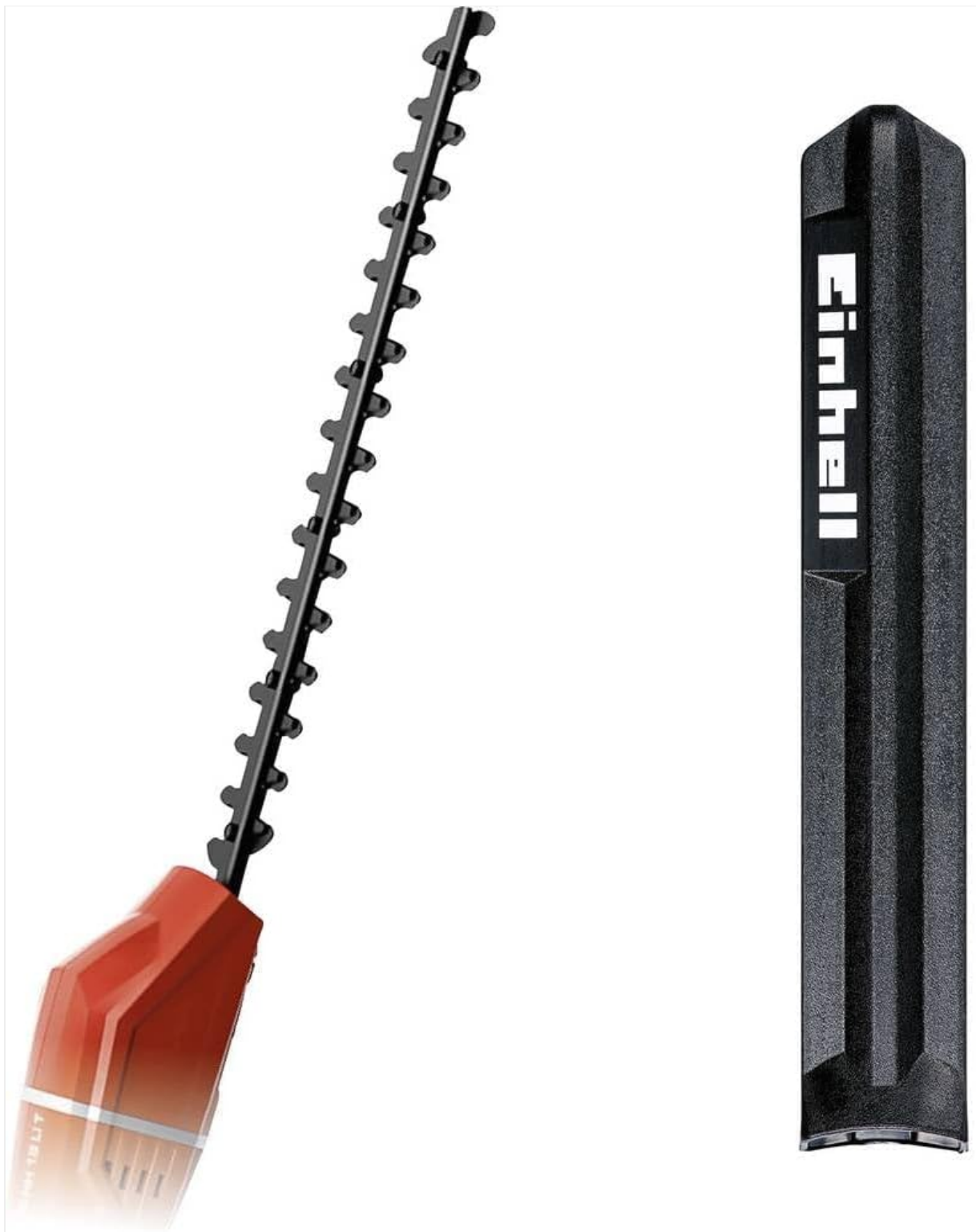
Image 1: The Einhell GE-LC 18 Li T Cordless Hedge Trimmer blade attachment and a portion of the handle. The blade features multiple cutting teeth along its length, designed for efficient trimming. The handle section shows the Einhell logo.