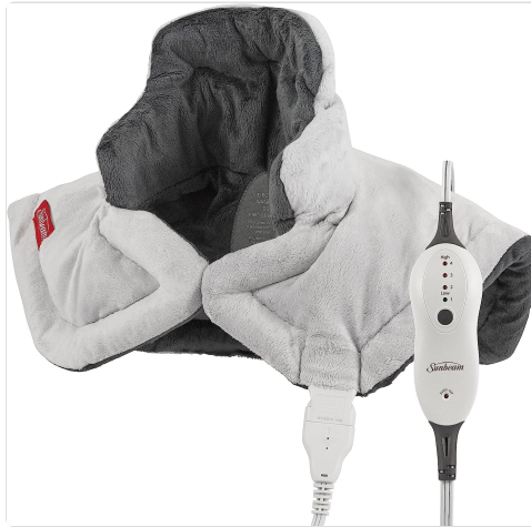
Overall view of the Sunbeam Contoured Heating Pad with its controller.