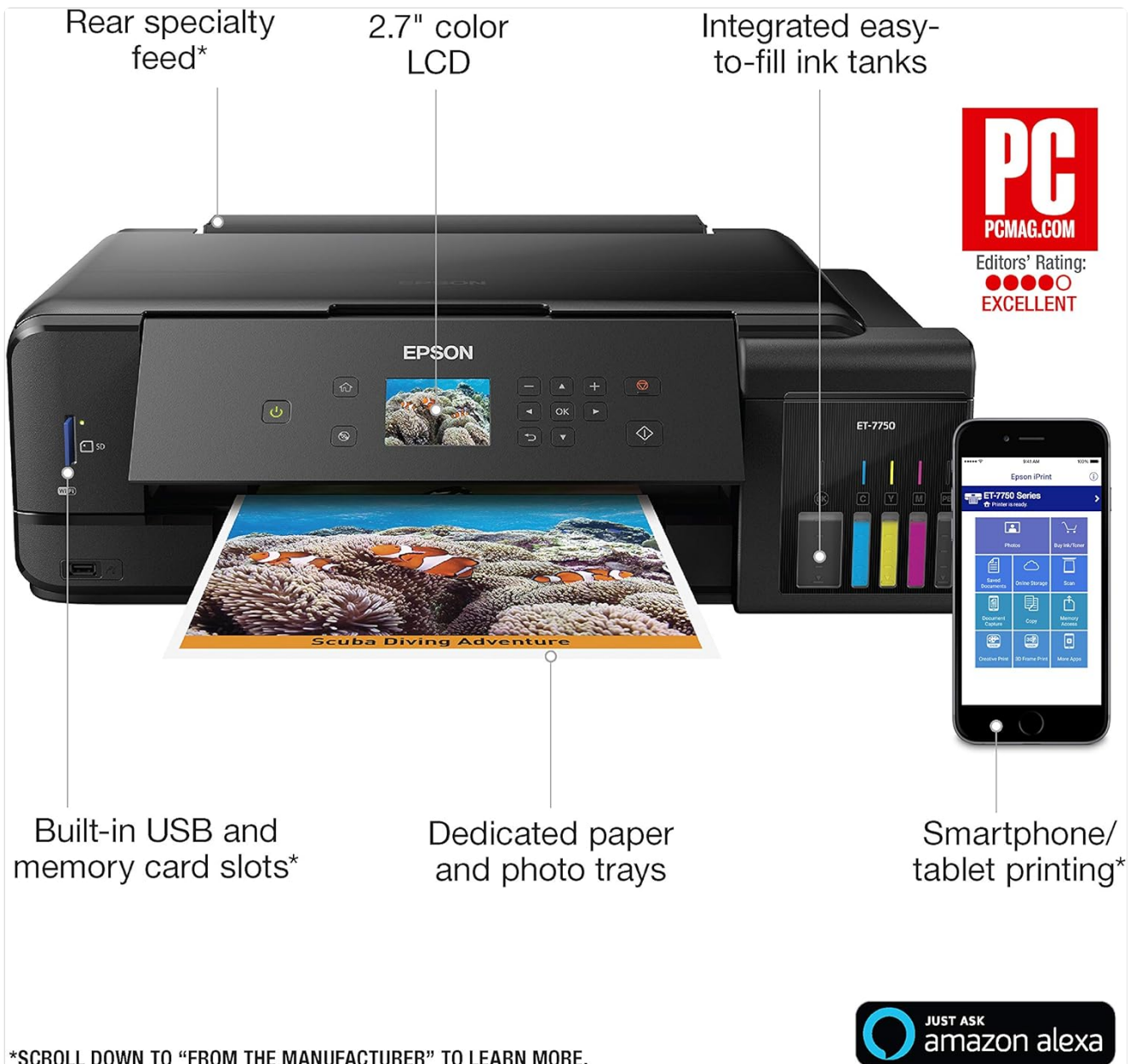
Figure 4: Overview of printer features, including wireless printing from mobile devices.