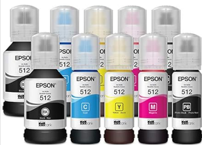
EcoTank 512 Ink Bottles

We recommend genuine Epson® Ink for the best print quality and performance.