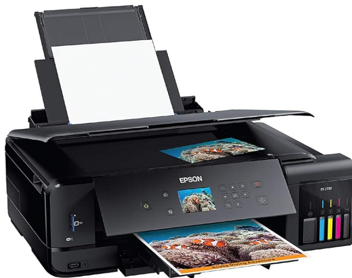
Expression® Premium ET-7750 EcoTank® All-in-One Supertank Printer