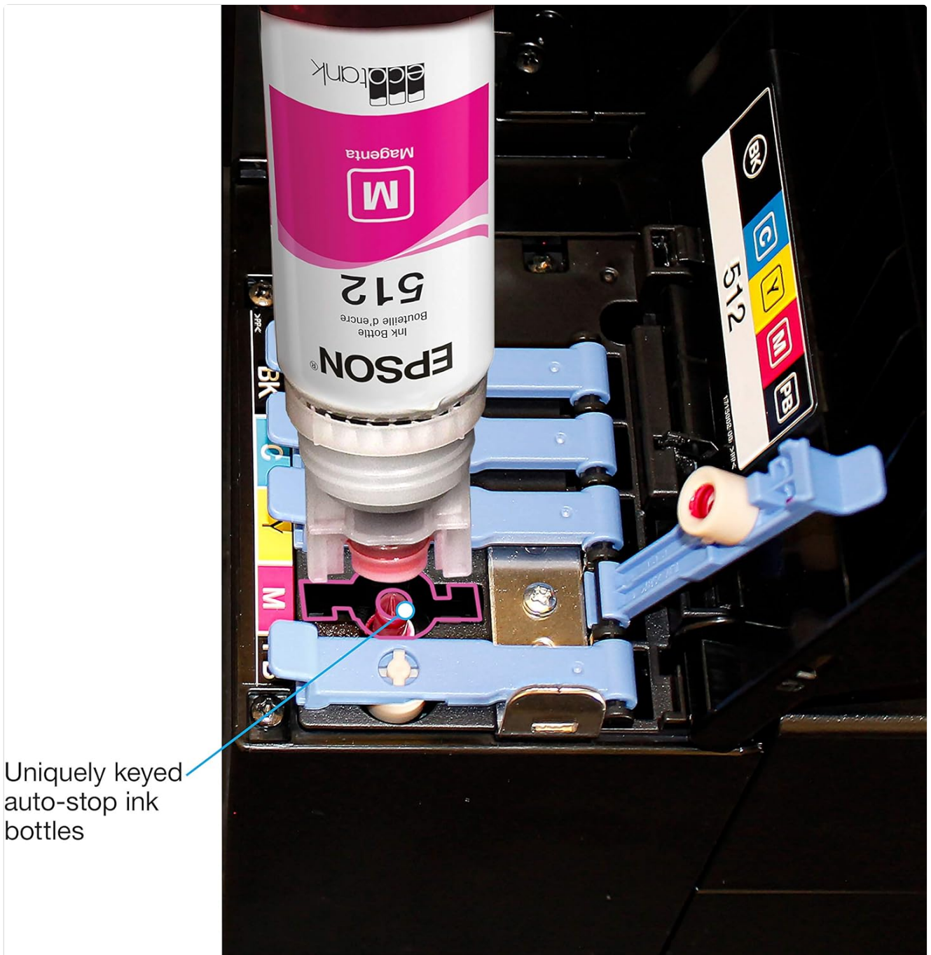
Figure 3: Demonstrating the clean and easy ink refilling process with uniquely keyed auto-stop ink bottles.