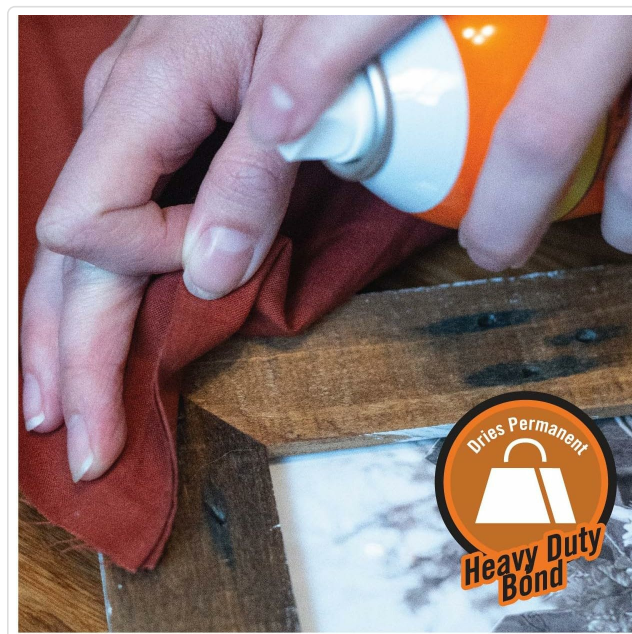
Figure 2: Applying adhesive to fabric for bonding.

**Note: Not recommended for use on polypropylene (PP) or polyethylene (PE) plastics, vinyl, or any type of rubber with high oil or plasticizer content. Not for use on food contact surfaces. Do not use for bonding weighted materials.