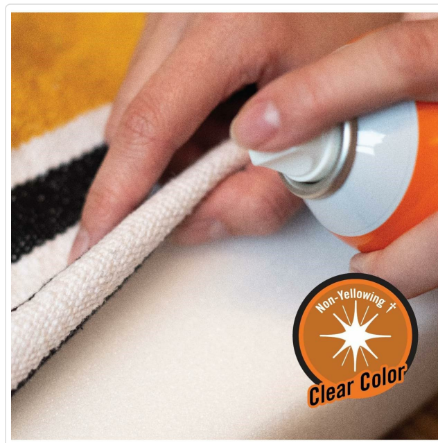
Figure 4: The adhesive dries clear, maintaining the original color of materials.