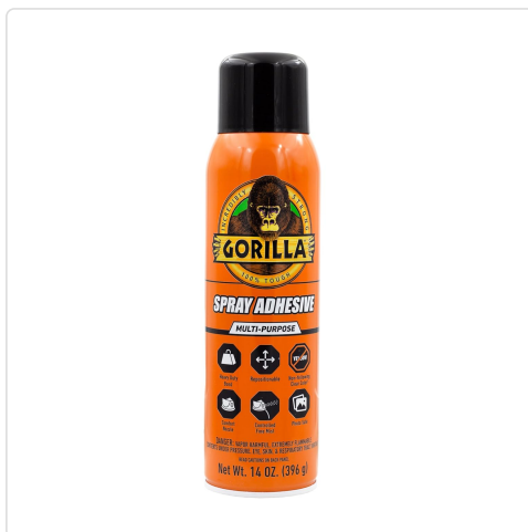
Figure 1: Gorilla Heavy Duty Spray Adhesive product can.