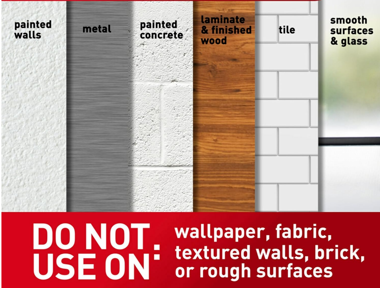
Image: Visual guide indicating suitable surfaces (painted walls, metal, painted concrete, laminates & finished wood, tile, smooth surfaces & glass) and unsuitable surfaces (wallpaper, fabric, textured walls, brick, rough surfaces).