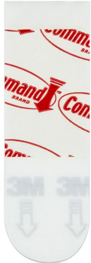
Image: Packaging of Command Poster Strips showing 64 strips and a single strip for detail.