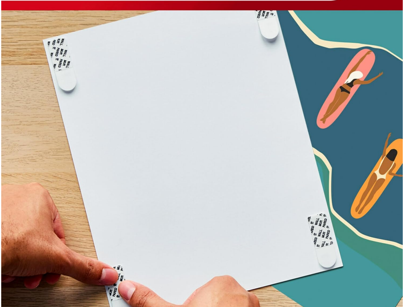
Image: A person's hands applying Command Poster Strips to the back of a poster before hanging.