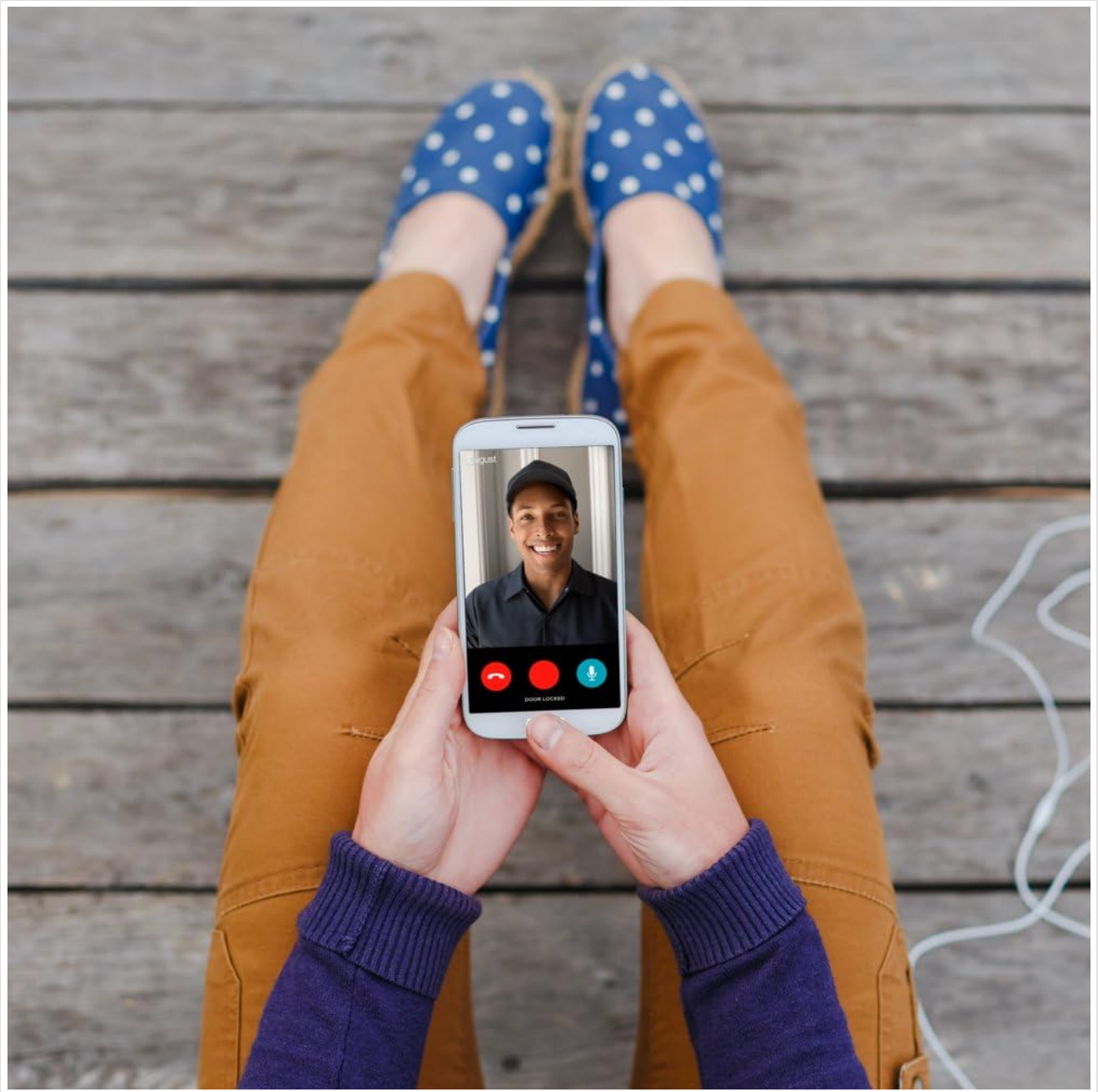
Image 5.1: A user interacting with a visitor at their door through the August app on their smartphone.