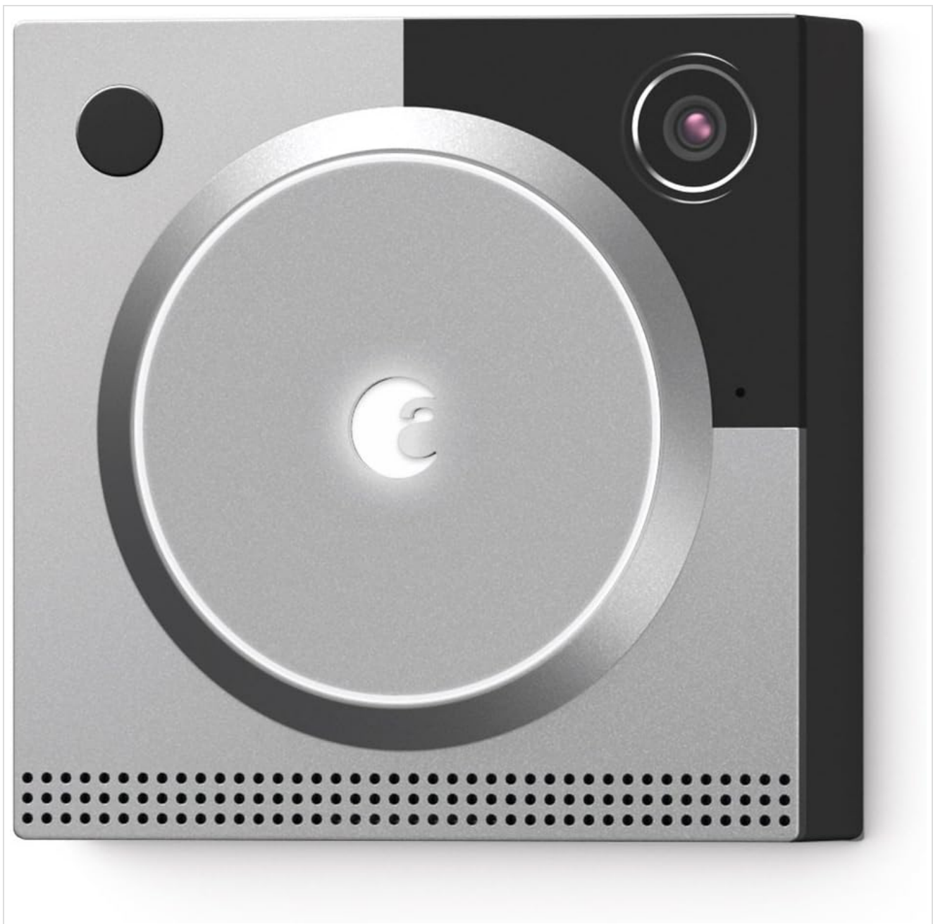
Image 1.1: Front view of the August Doorbell Cam Pro, showcasing its sleek design with a silver circular button and camera lens.