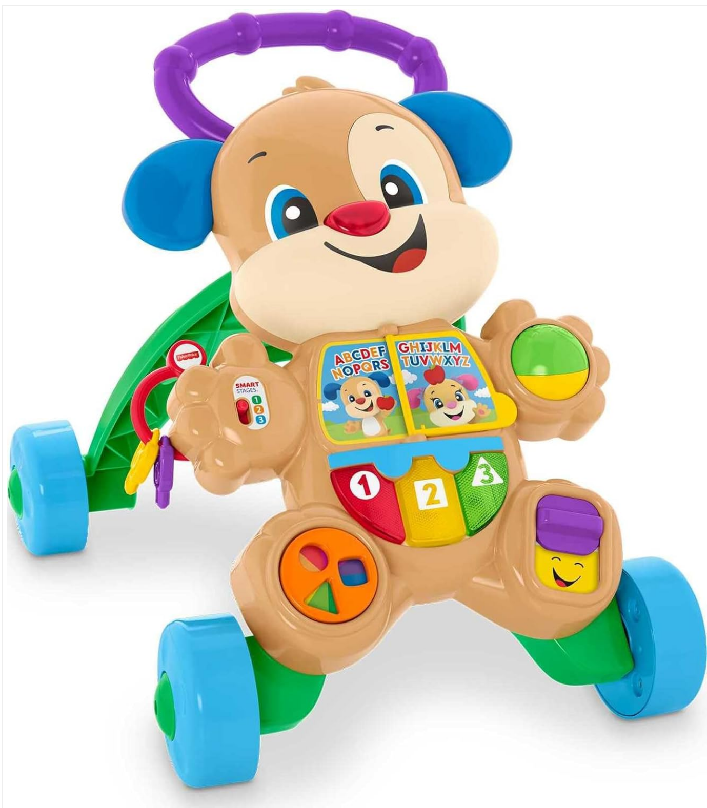
Image: The Fisher-Price Laugh & Learn Smart Stages Learn with Puppy Walker, featuring a friendly puppy design with interactive elements.